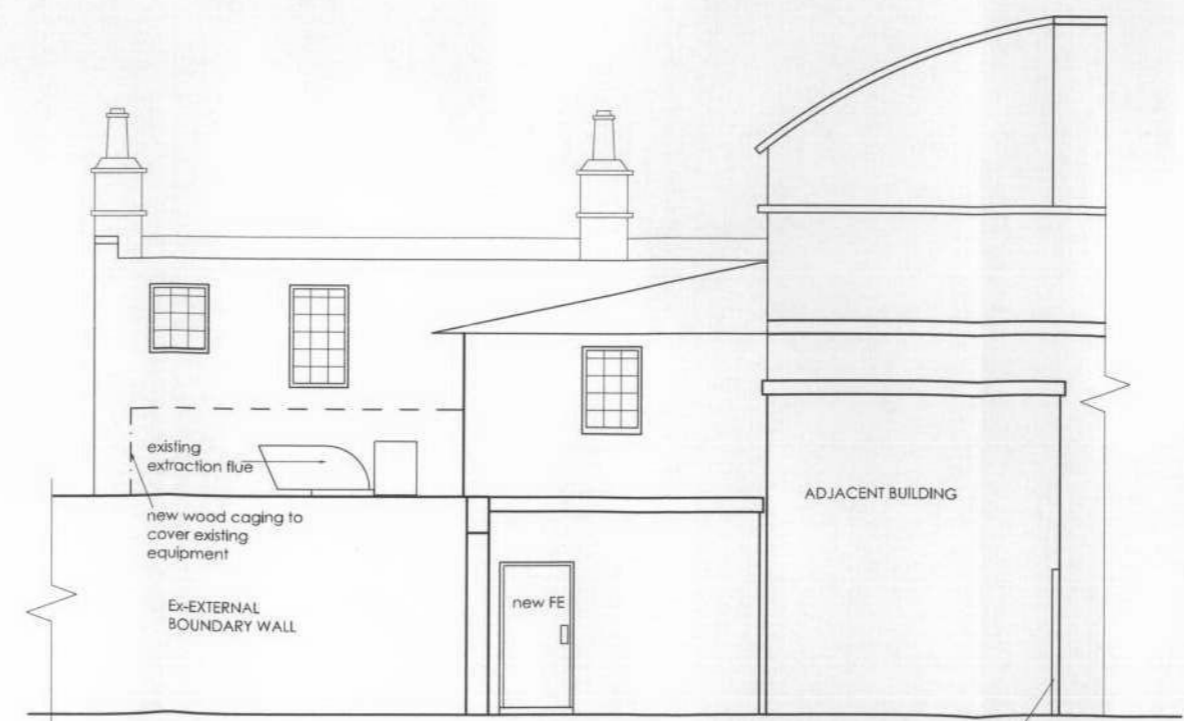
REAR ELEVATION C-C