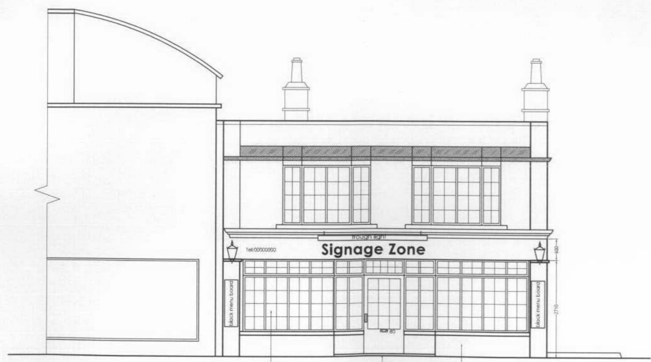
FRONT ELEVATION A-A