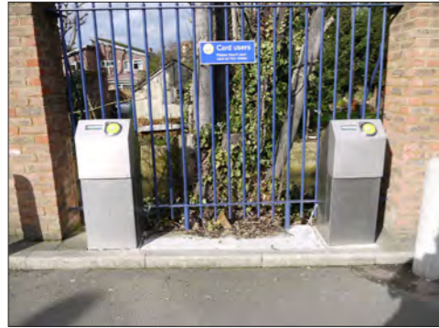
MULTIPLE ENTRANCES CONFLICT WITH TRAIN INFORMATION AND TICKETING REQUIREMENTS