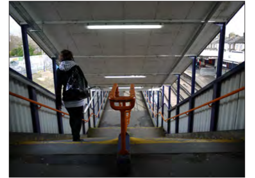
STAIRS POOR QUALITY INTERNAL AND EXTERNAL APPEARANCE