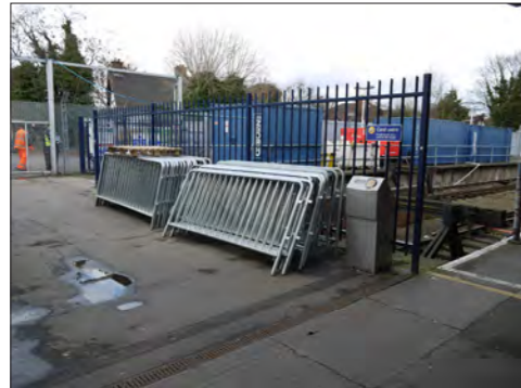
STORAGE FOR MATCHDAY BARRIERS INADEQUATE