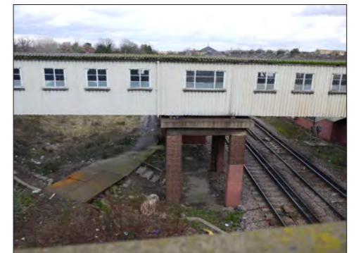
LINK BRIDGE VERY NARROW, POOR INTERNAL ENVIRONMENT AND NEGATIVE EXTERNAL APPEARANCE