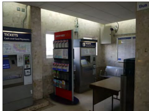
CONCOURSE TOO SMALL, CEILING HEIGHT INADEQUATE