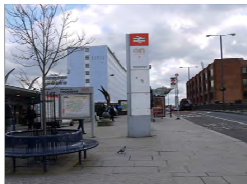
ARRIVAL DISAPPOINTING AND FORECOURT CRAMPED