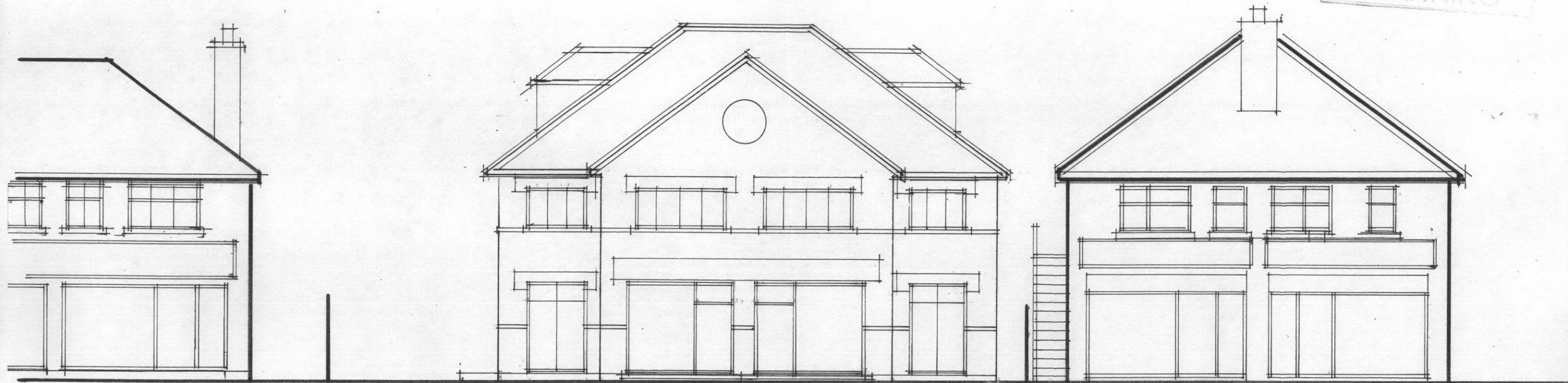
Proposed Street Scene Elevation