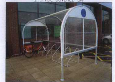
03 NTS CYCLE SHELTER AD-007 PROPOSED 'NUTEK' CYCLE SHELTER