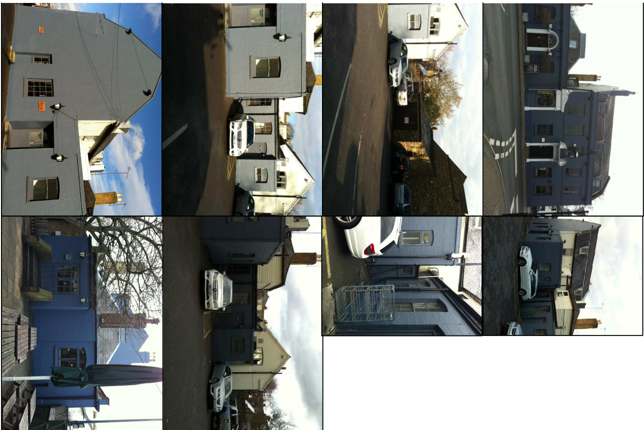
EXISTING PHOTOGRAPHS - NTS