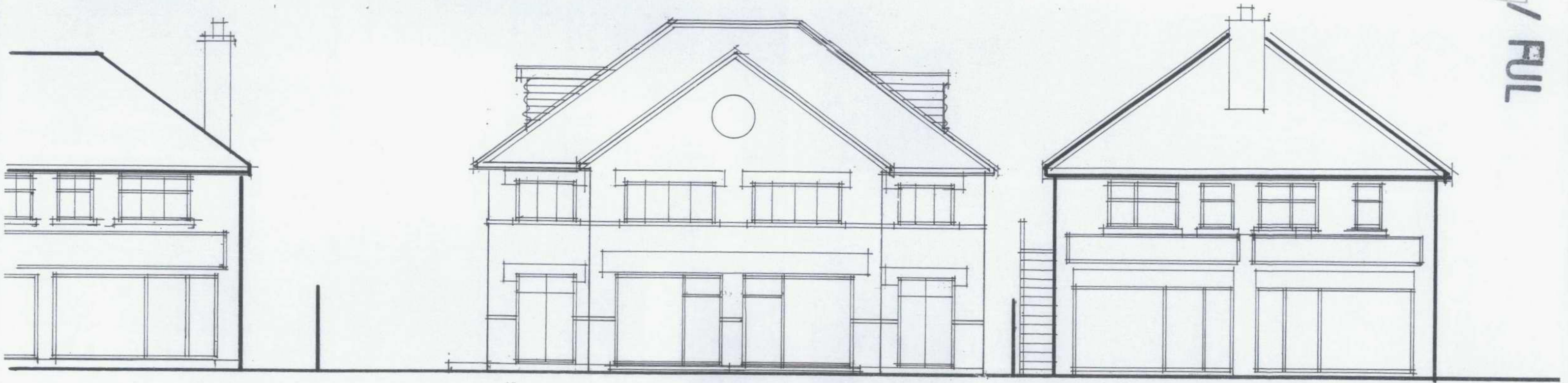
Proposed Street Scene Elevation