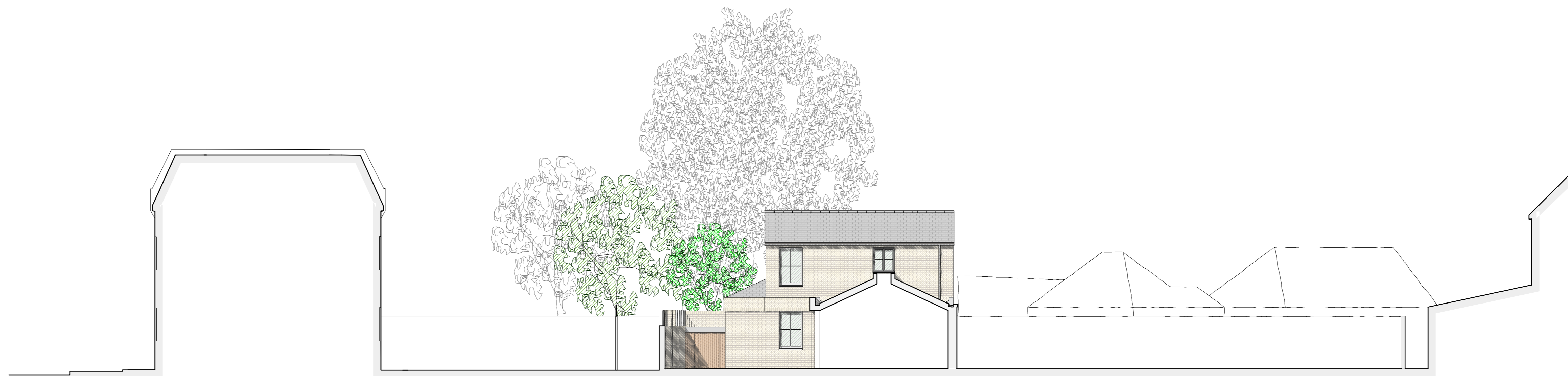
SECTION B B HOUSE 3