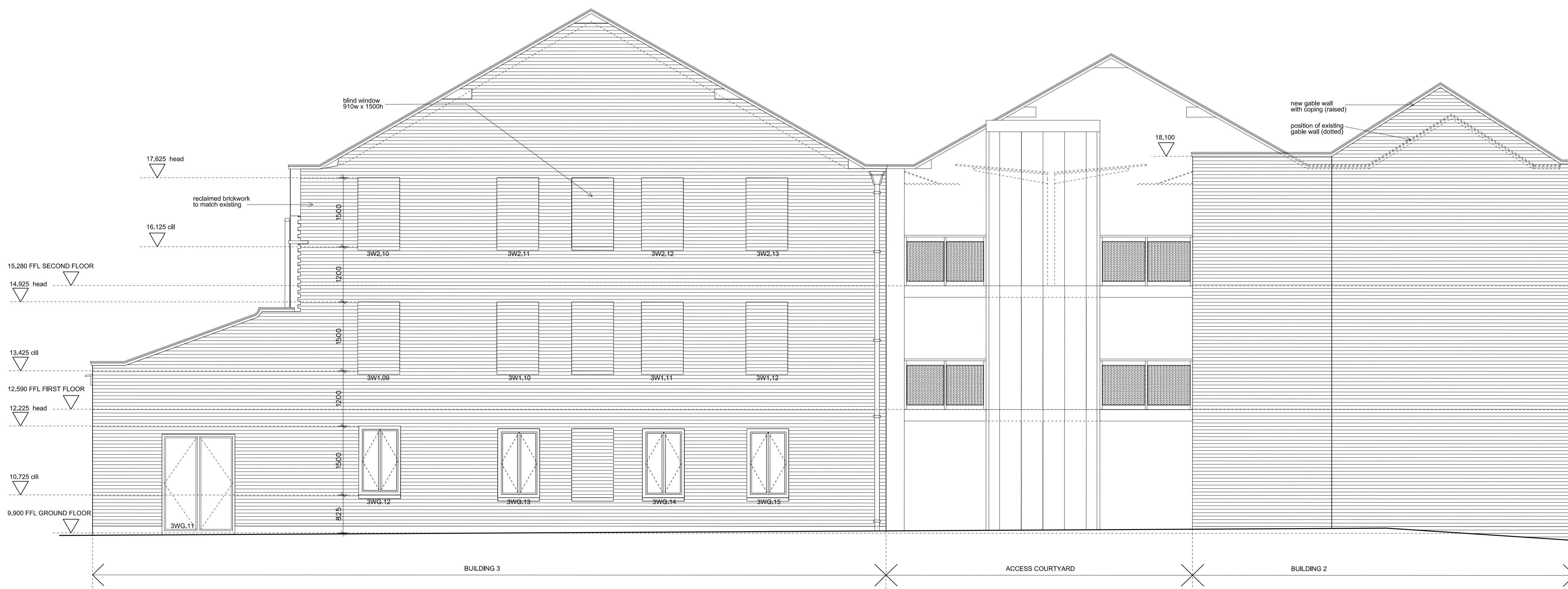
WEST ELEVATION - Buildings 2 and 3