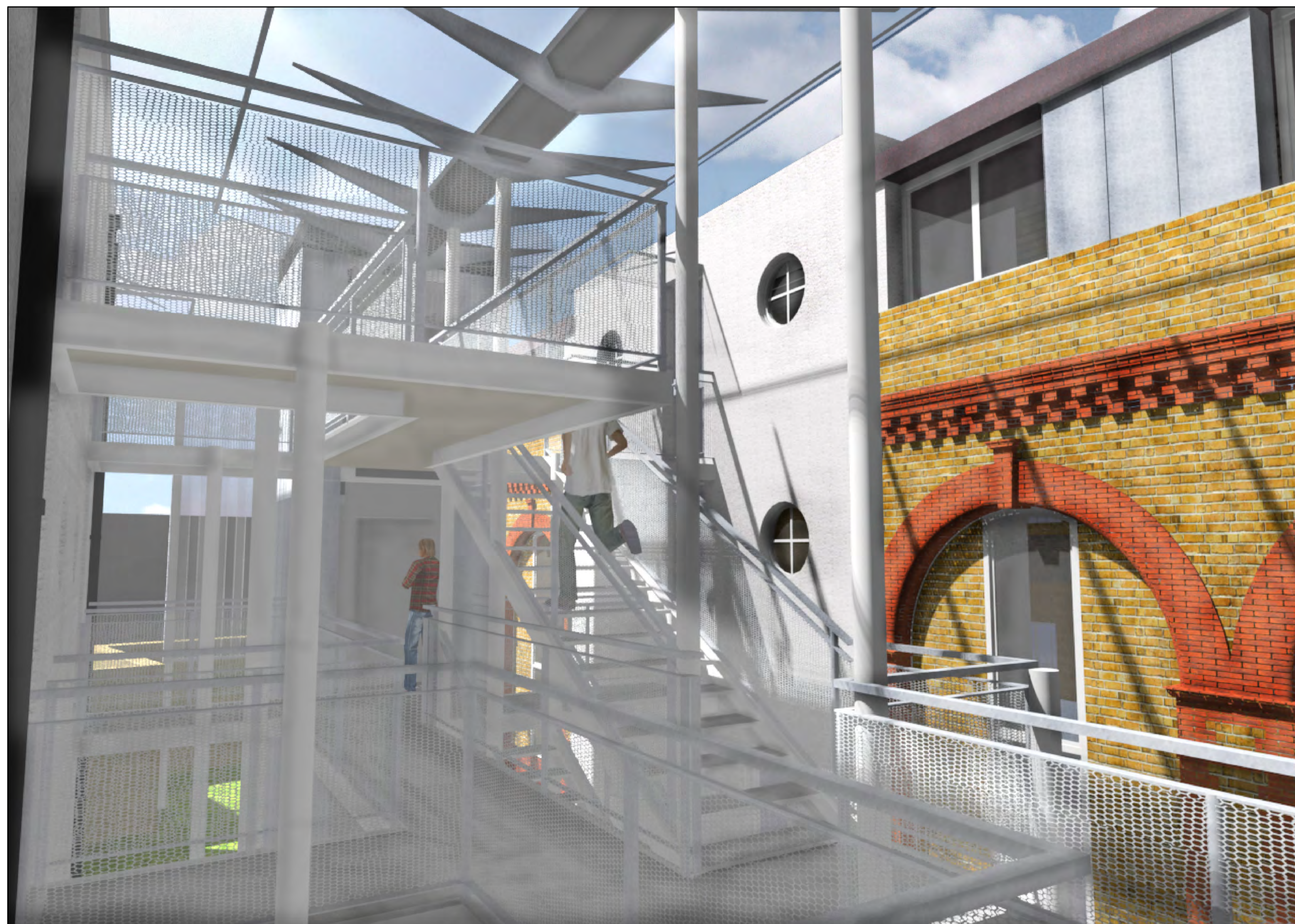
VIEW OF PROPOSED COURTYARD