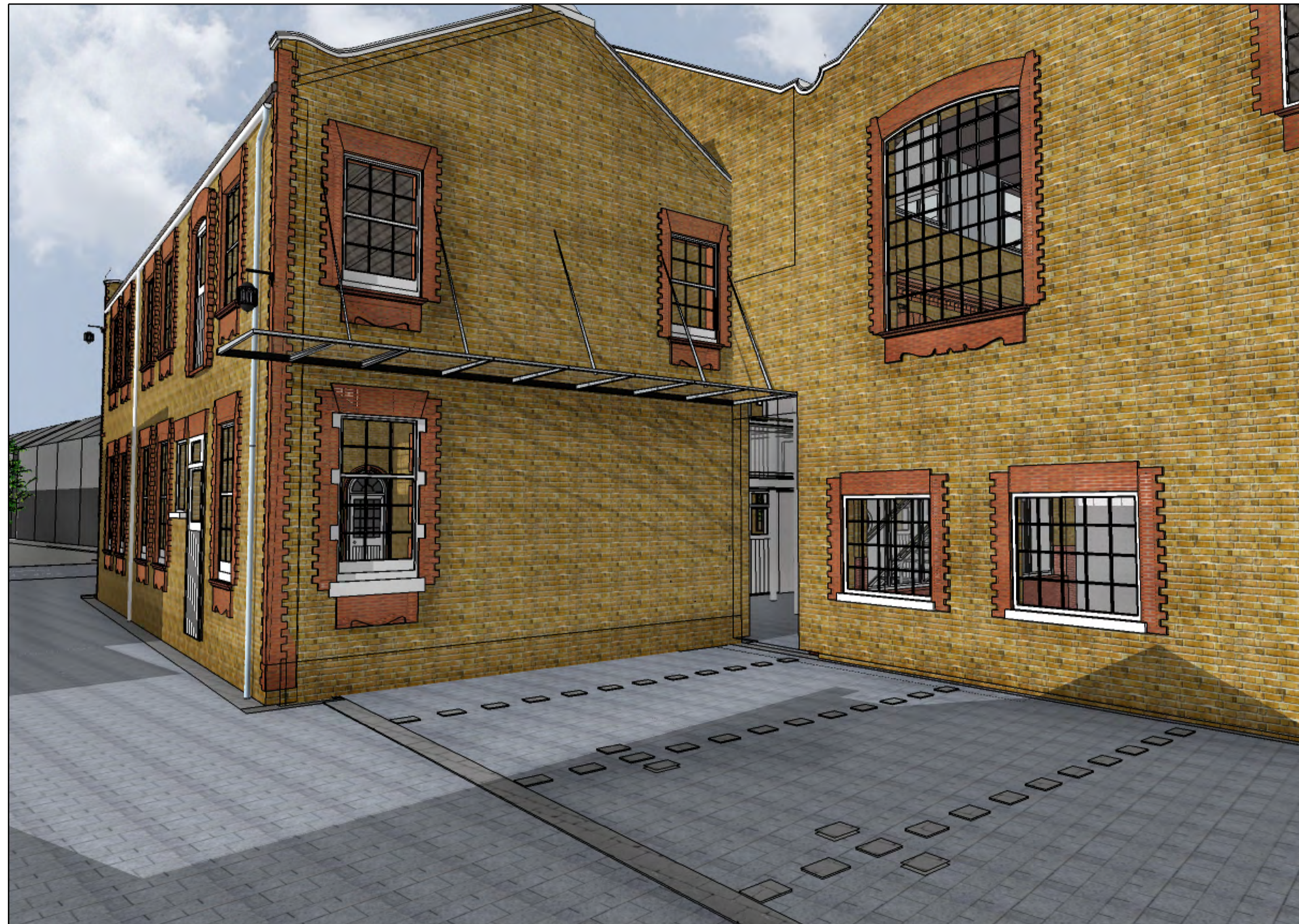
PROPOSED ENTRANCE CANOPY