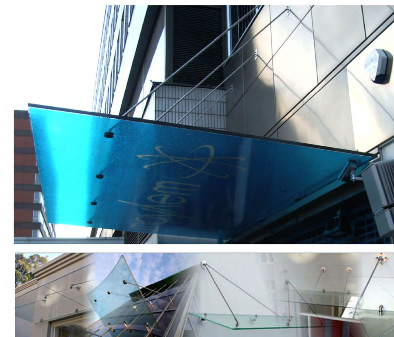
EXAMPLES OF SUSPENDED CANOPIES