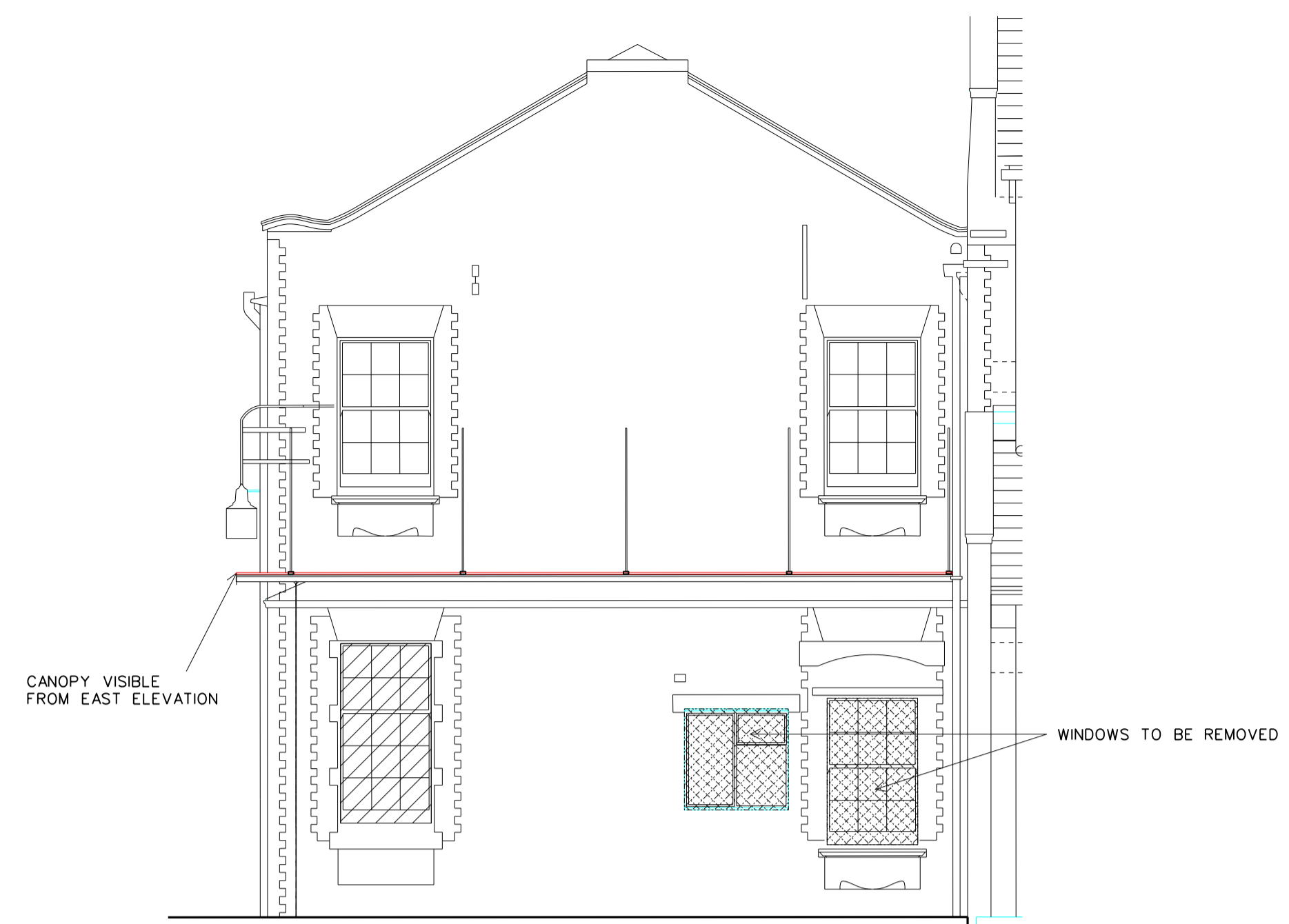
ELEVATION OF ENTRANCE CANOPY