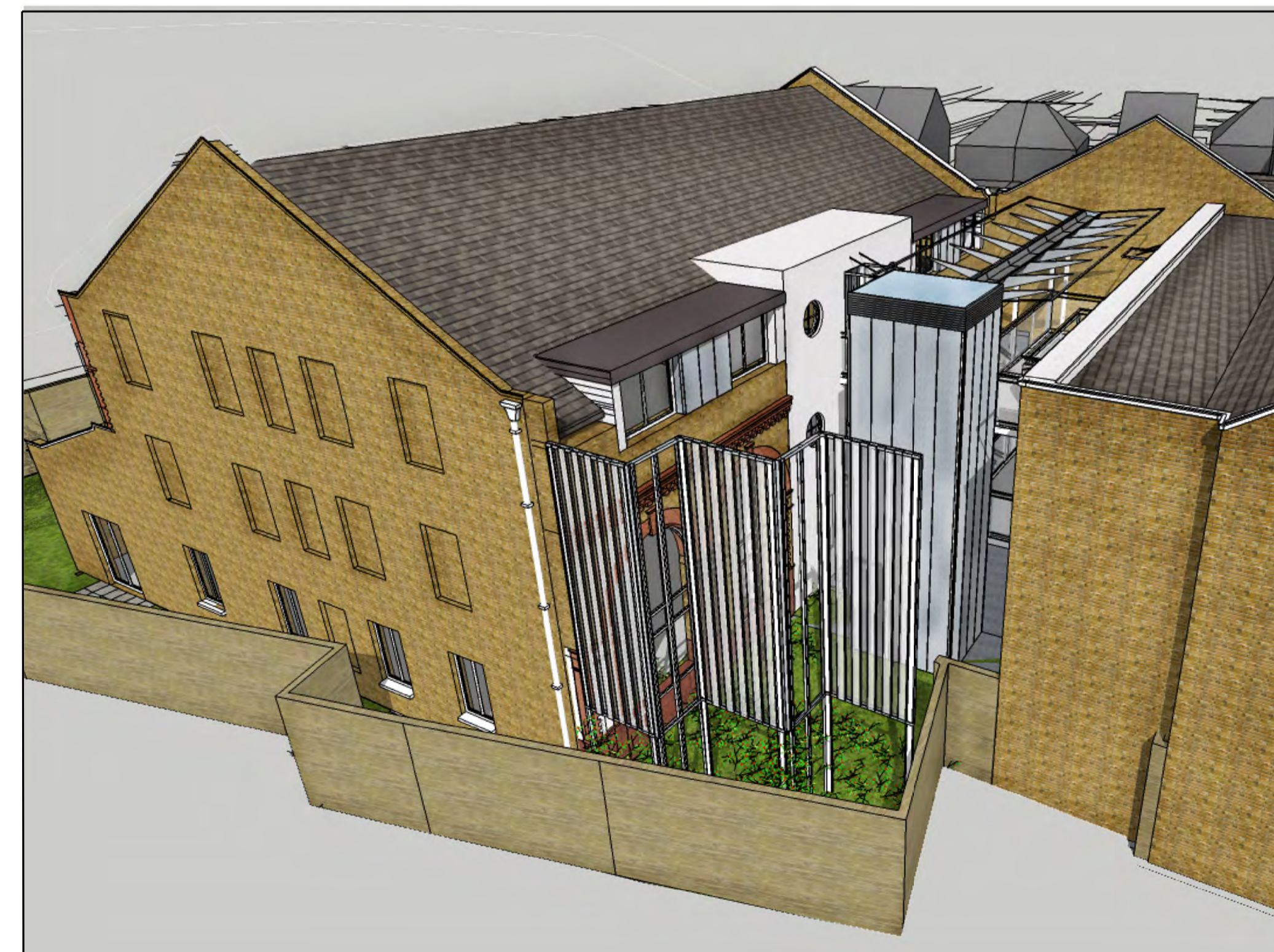
BIRDS EYE VIEW OF REGLIT SCREEN