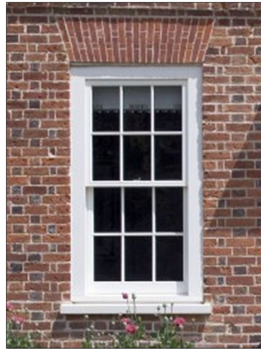
EXAMPLE OF TIMBER SASH WINDOW FOR BUILDING 1