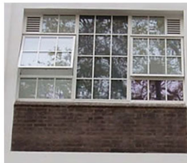
PROPOSED METAL WINDOWS