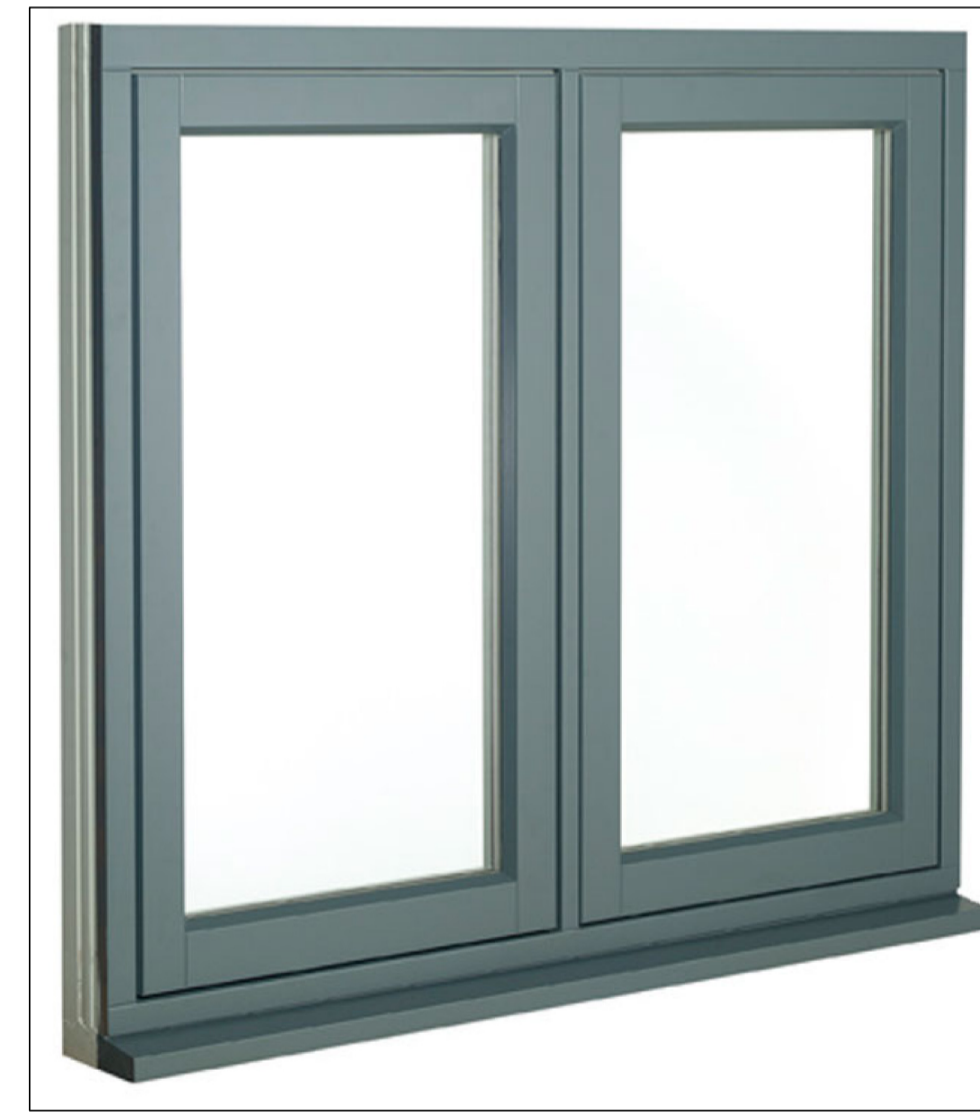
EXAMPLE OF ALUMINIUM CASEMENT WINDOW FOR COURTYARD, BUILDING 3 WEST ELEVATION