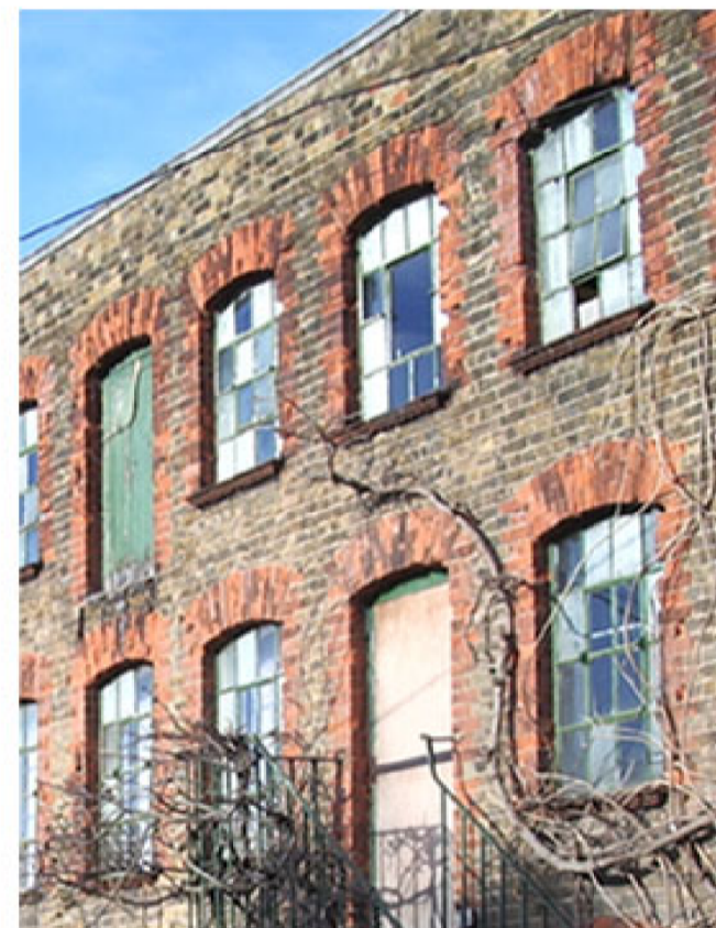
EXISTING SOUTH ELEVATION - BUILDING 2