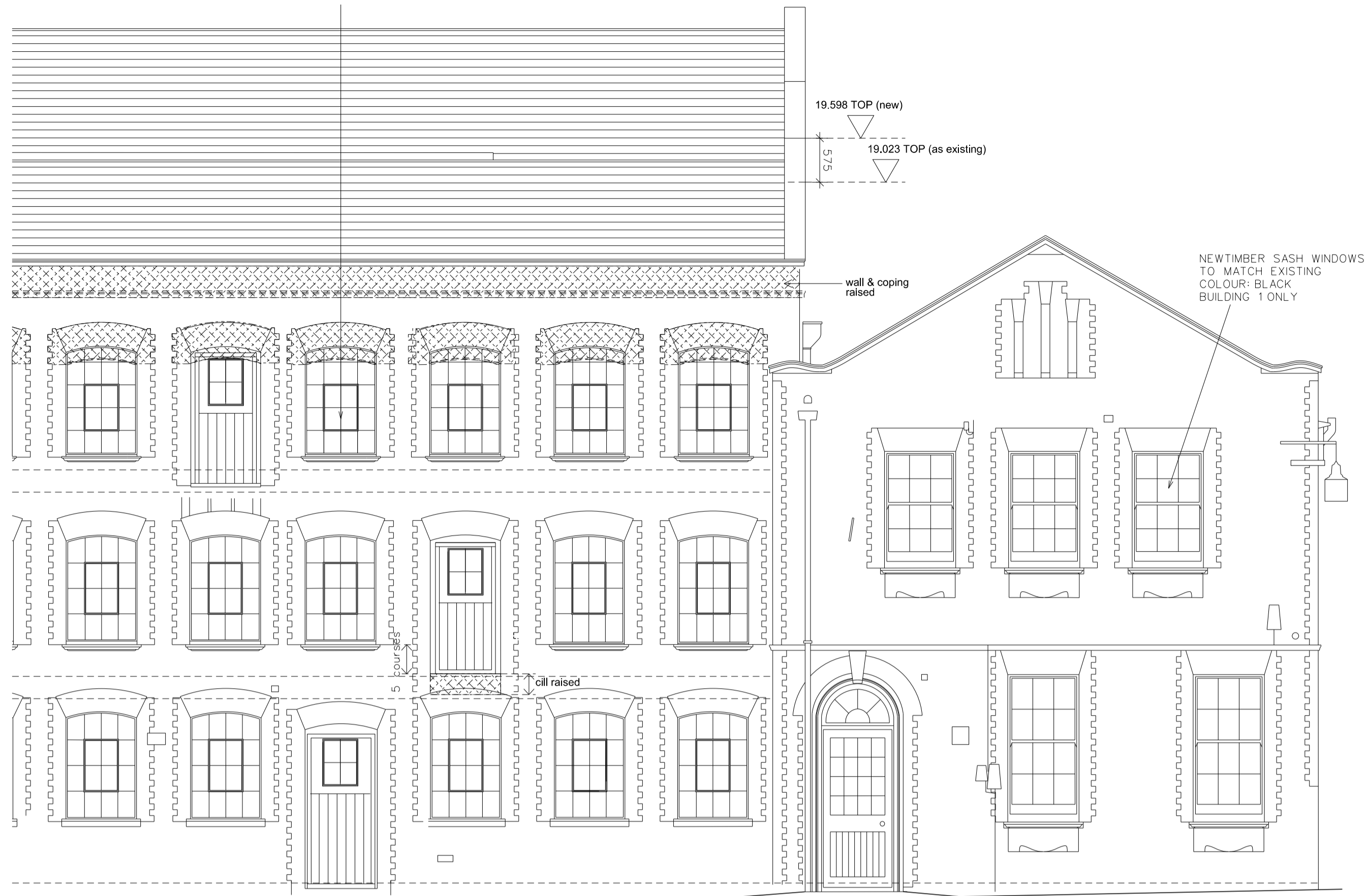
SOUTH ELEVATION - BUILDING 2

REPLACEMENT METAL WINDOWS TO MATCH EXISTING COLOUR: BLACK ALL BLOCKS EXCEPT BLOCK 1