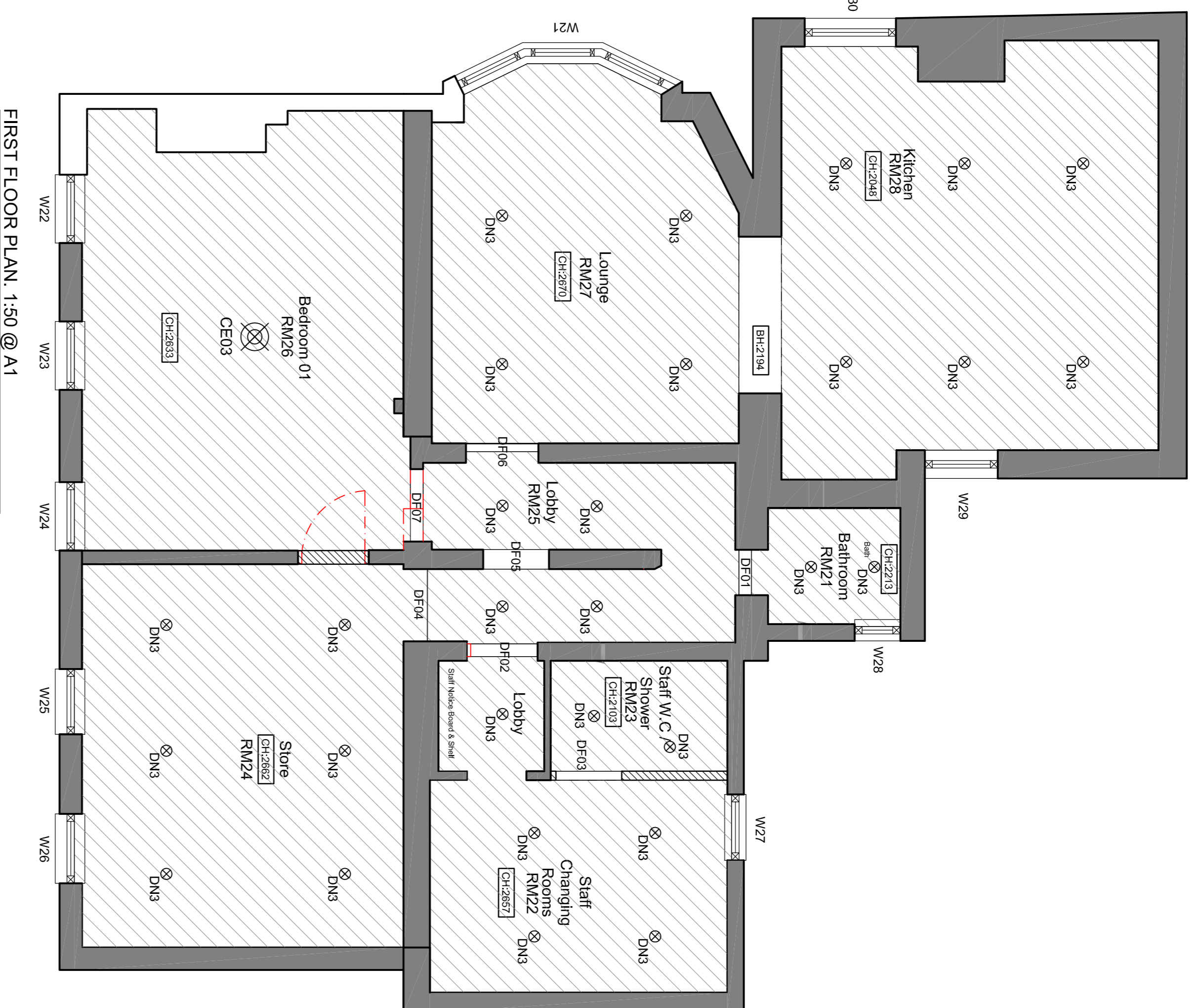
FIRST FLOOR PLAN, 1:50 @ A1