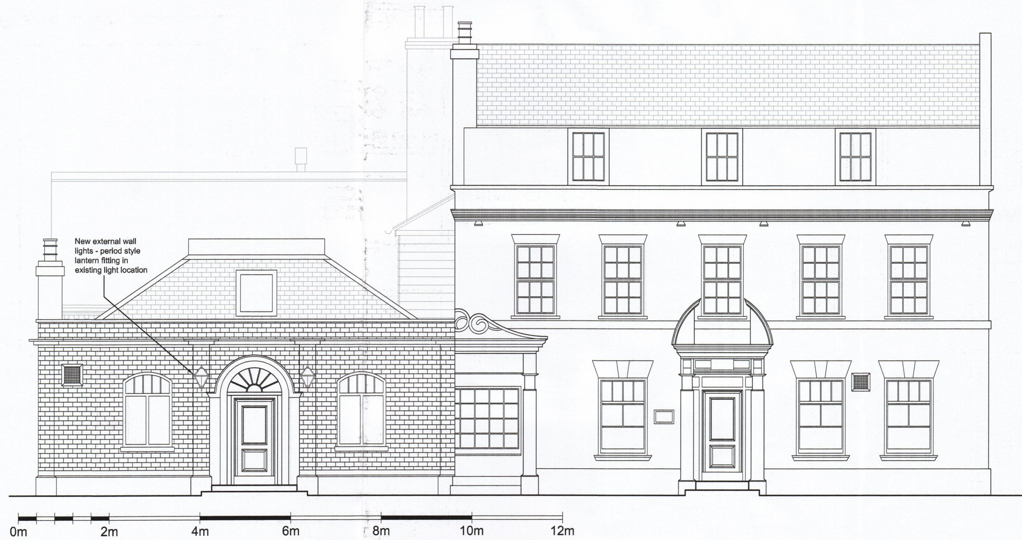
SECTION AA. 1:50 @ A1