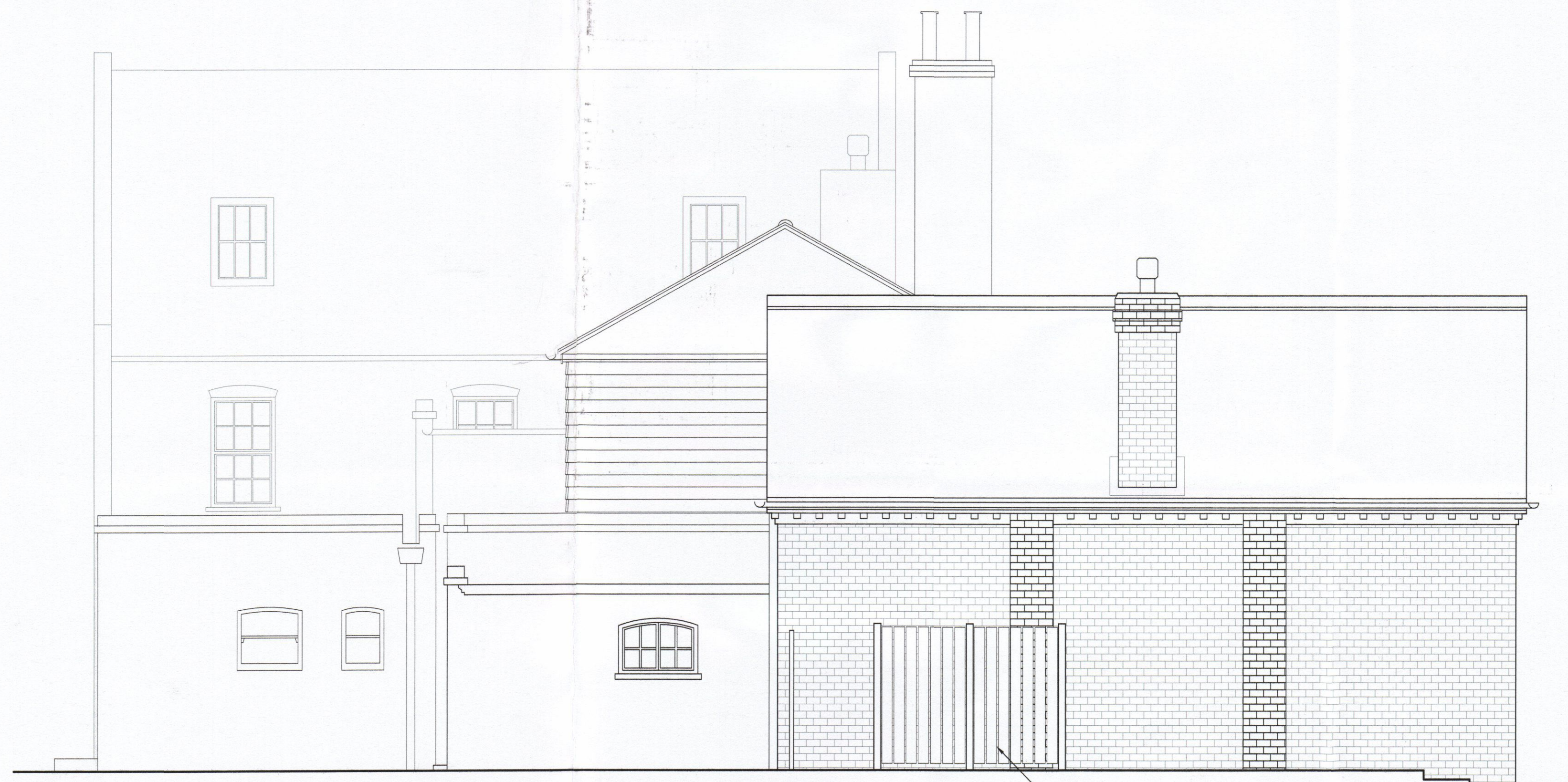
SECTION AA, 1:50 @ A1

NOTE: EXISTING HALL FACADE TO BE RETAINED