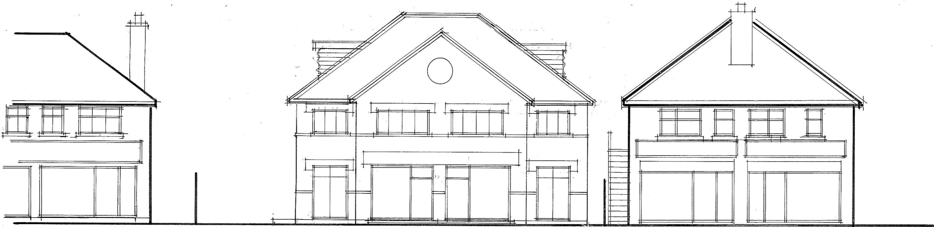
Proposed Street Scene Elevation

Woodlawn Garage 644 Hanworth Road Hounslow Middlesex TW4 5NP