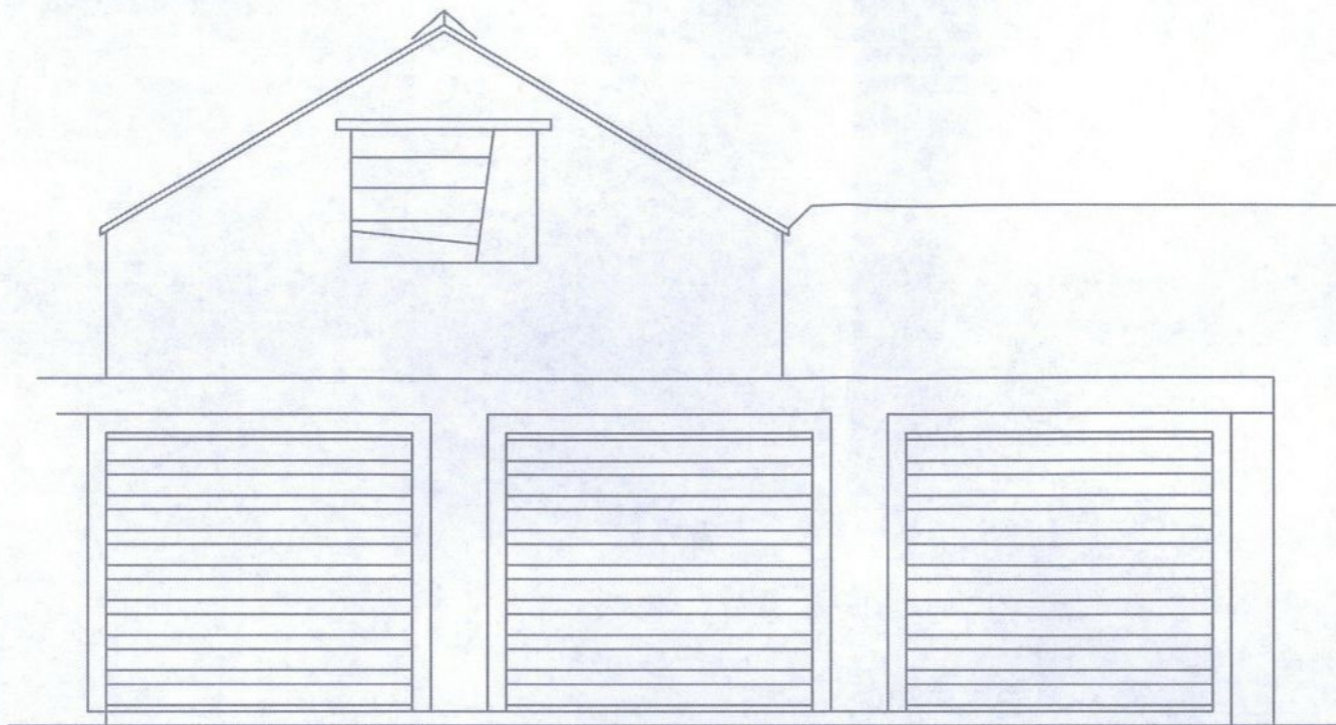
EXISTING REAR (WEST) ELEVATION