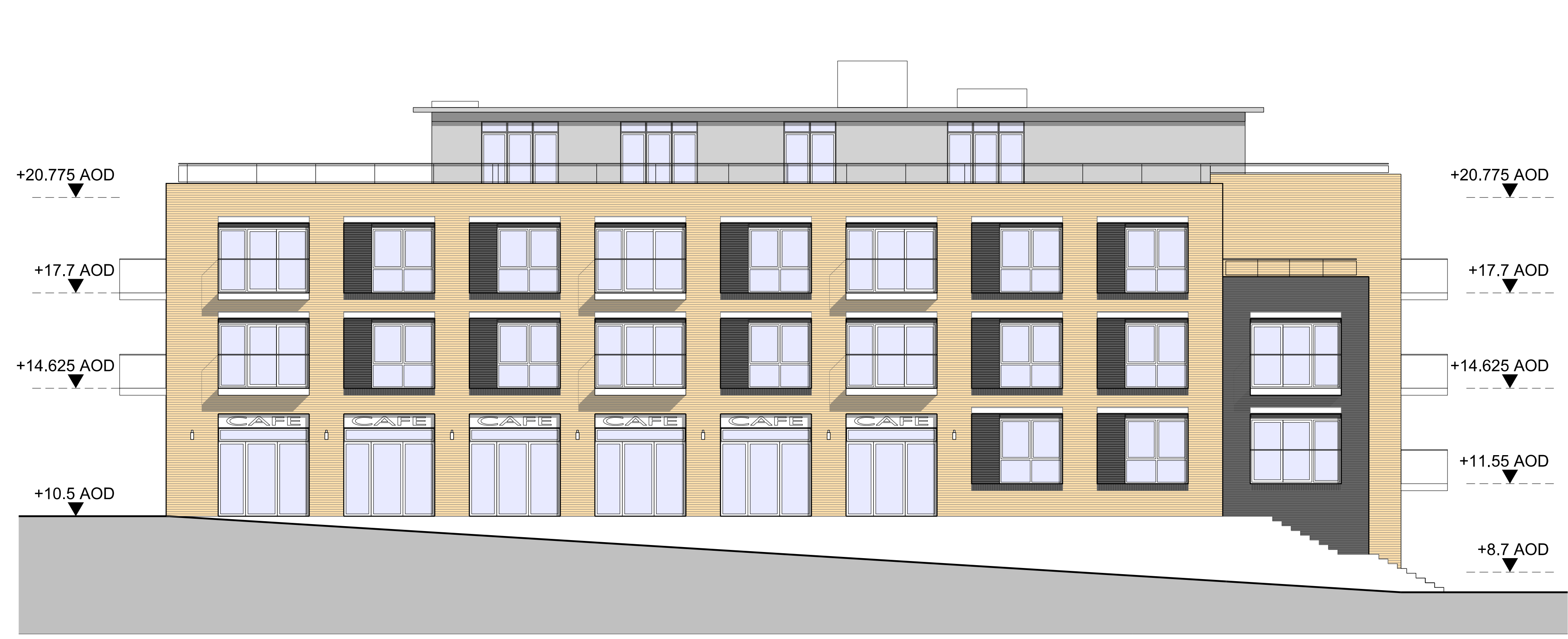
Elevation C (facing River Crane)