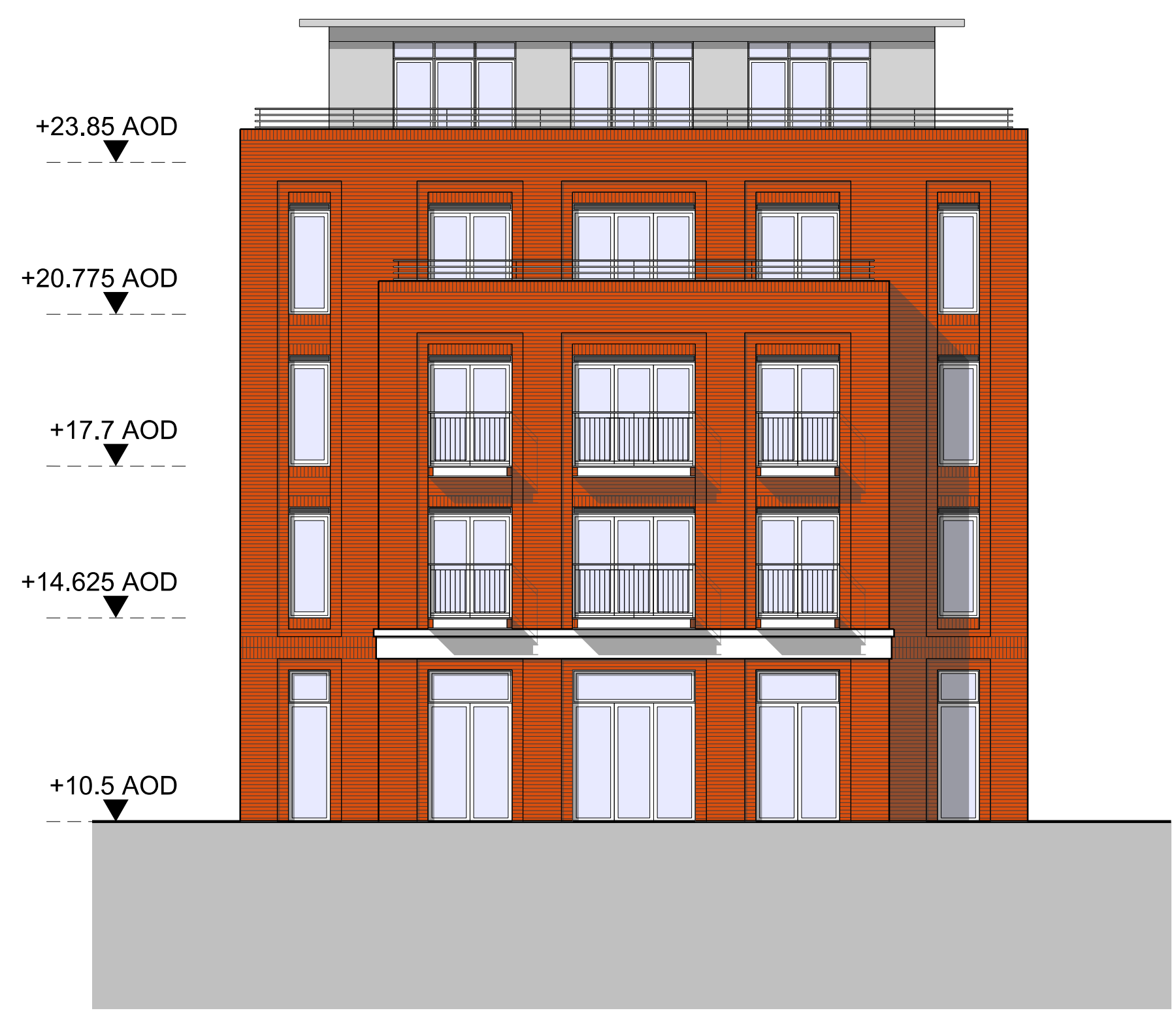
Elevation A (facing Piazza)

Note: Do not scale from this drawing. All contractors must visit the site and be responsible for taking and checking dimensions. All construction information should be taken from figured dimensions only. Any discrepancies between drawings, specifications and site conditions must be brought to the attention of the supervising officer. This drawing & the works depicted are the copyright of John Thompson & Partners. This drawing is for planning purposes only. It is not intended to be used for construction purposes, whilst all reasonable efforts are used to ensure drawings are accurate, John Thompson & Partners accept no responsibility or liability for any reliance placed on, or use made of, this plan by anyone for purposes other than those stated above.