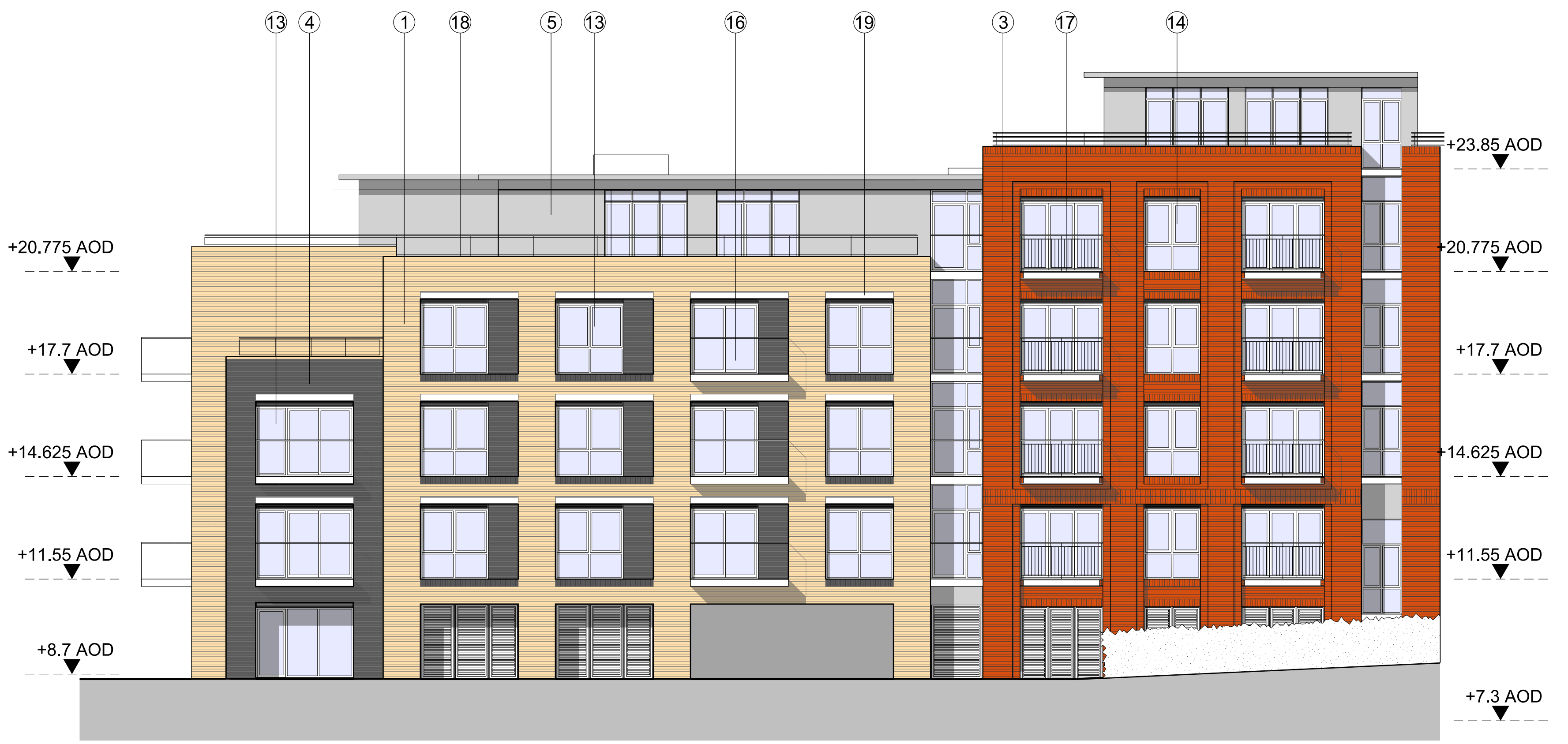
Elevation E (facing railway)