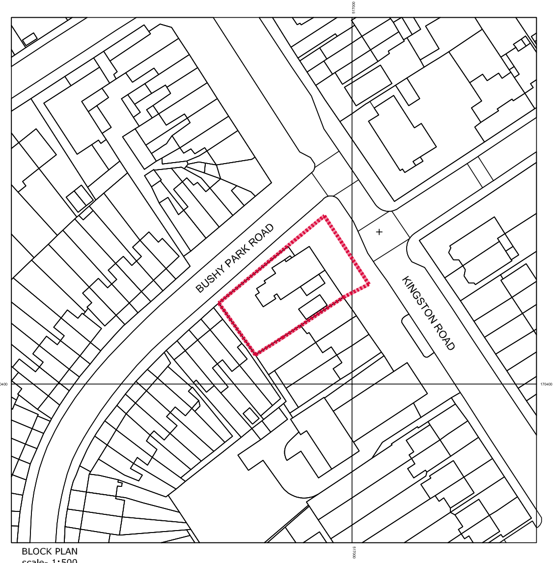
BLOCK PLAN scale- 1:500