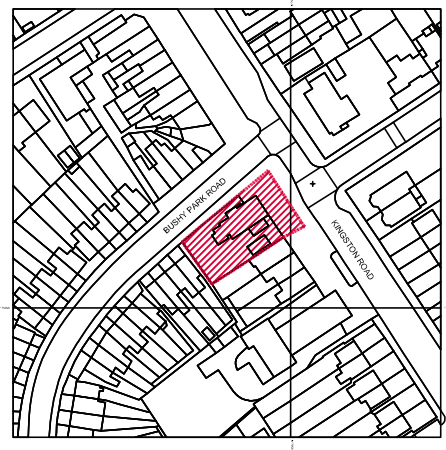
LOCATION PLAN scale- 1:1250