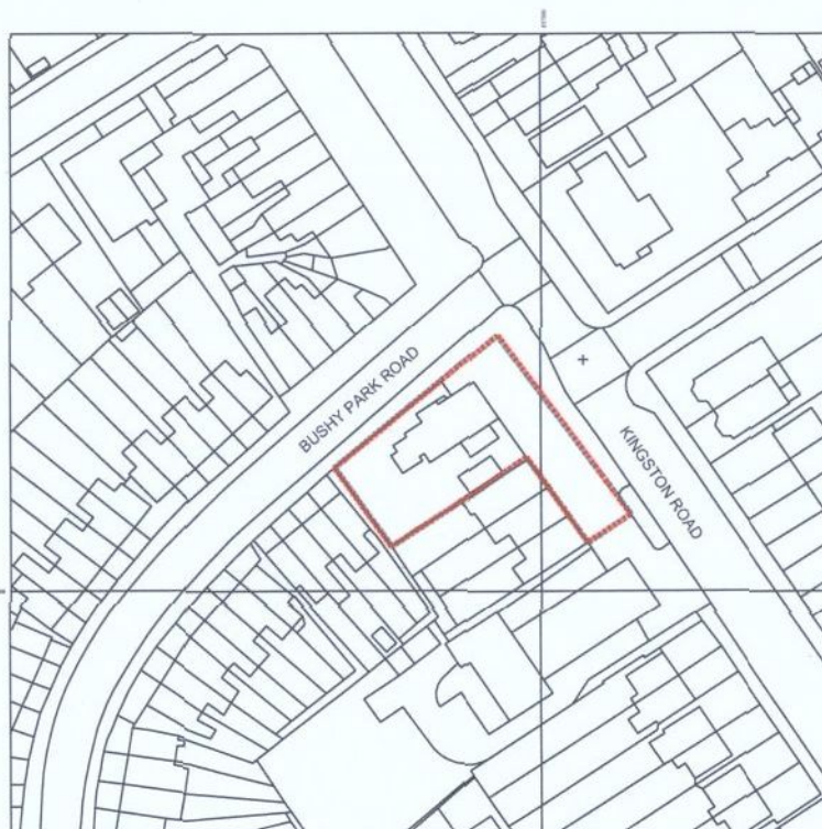
BLOCK PLAN scale- 1:500