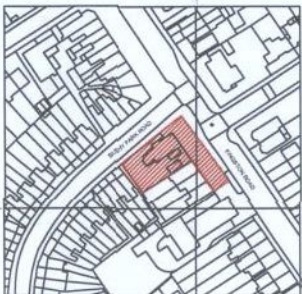
LOCATION PLAN scale- 1:1250