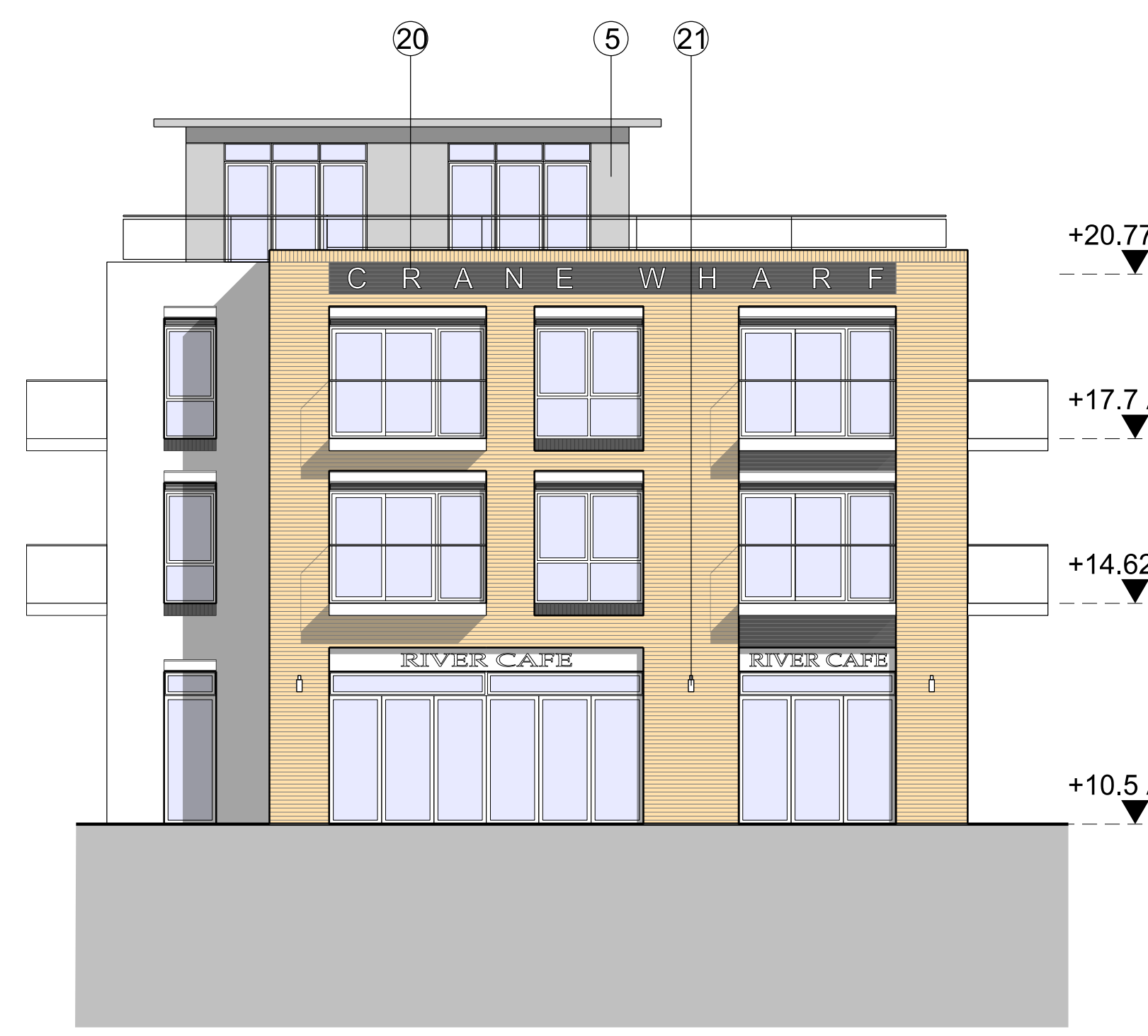
Elevation B (facing Piazza)