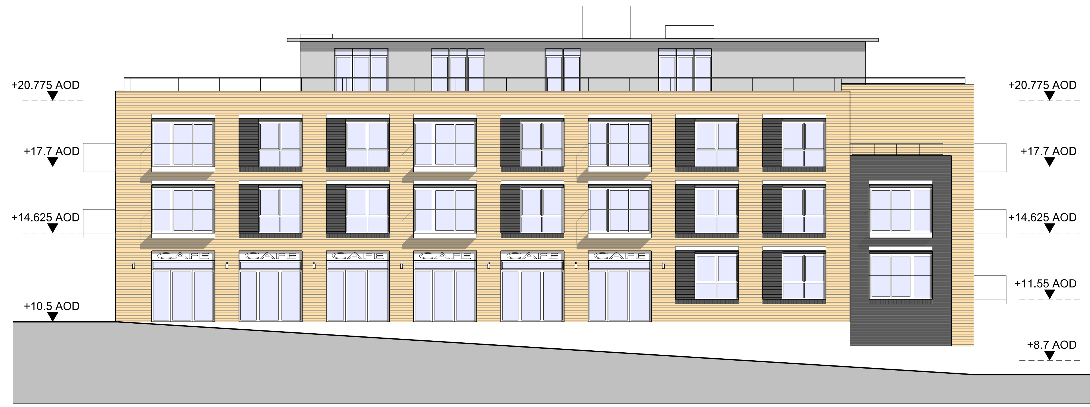
Elevation C (facing River Crane)