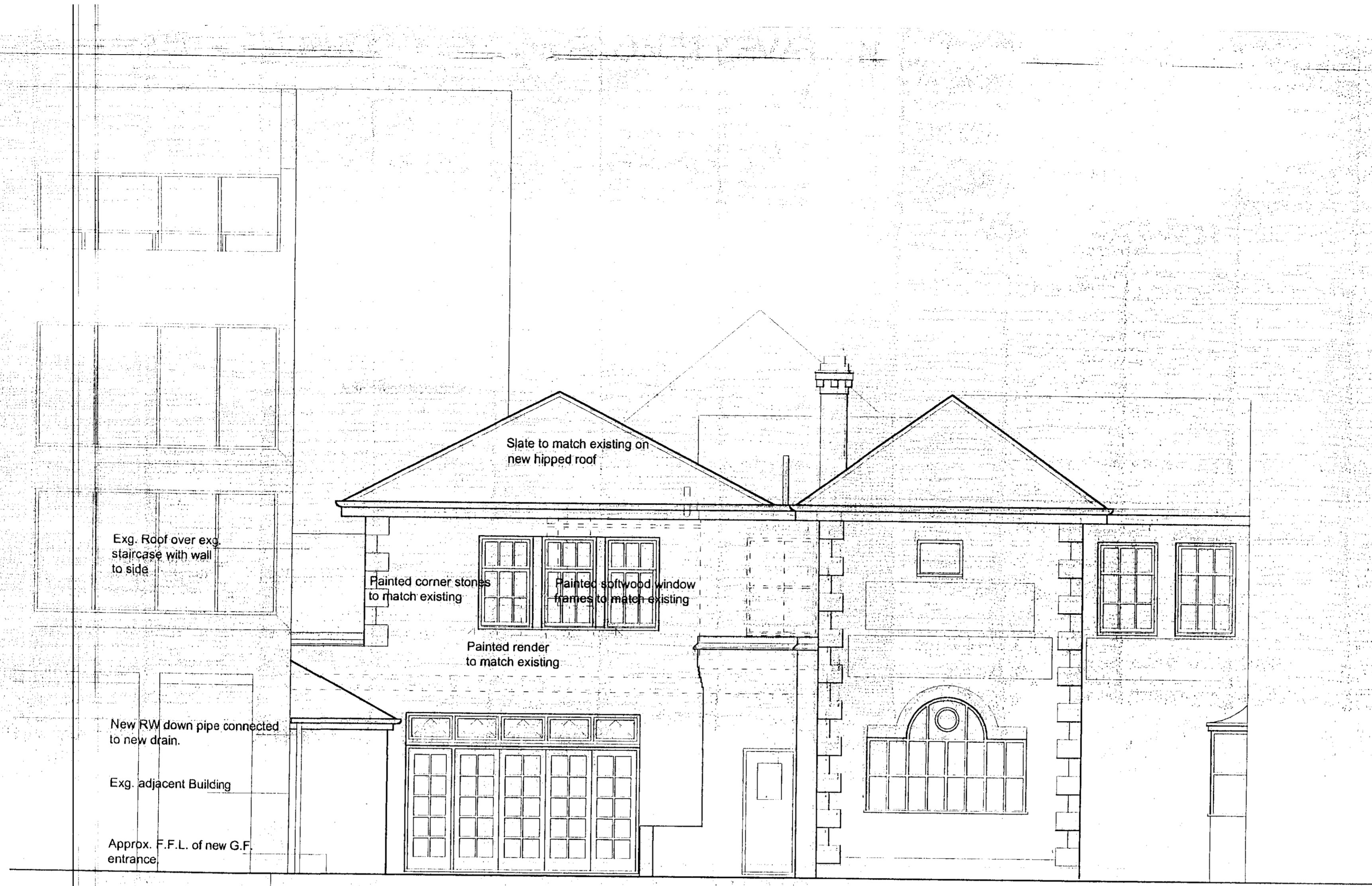
PROPOSED part FRONT ELEVATION