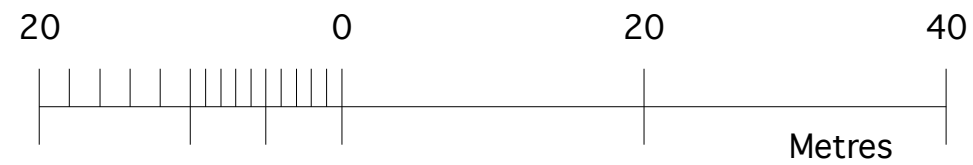
1:500 BLOCK PLAN