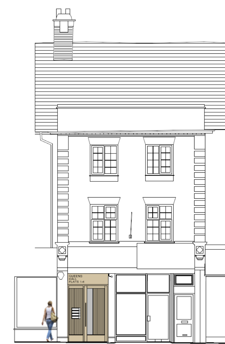
North-West Street Elevation