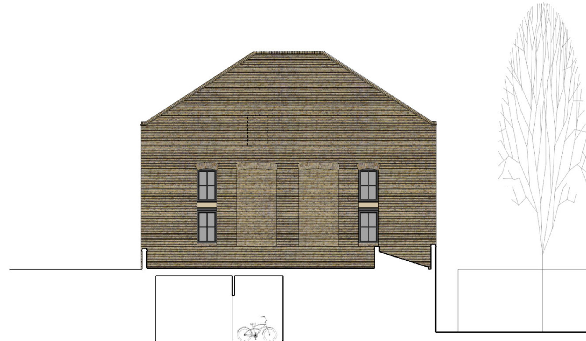
North-West Sectional Elevation