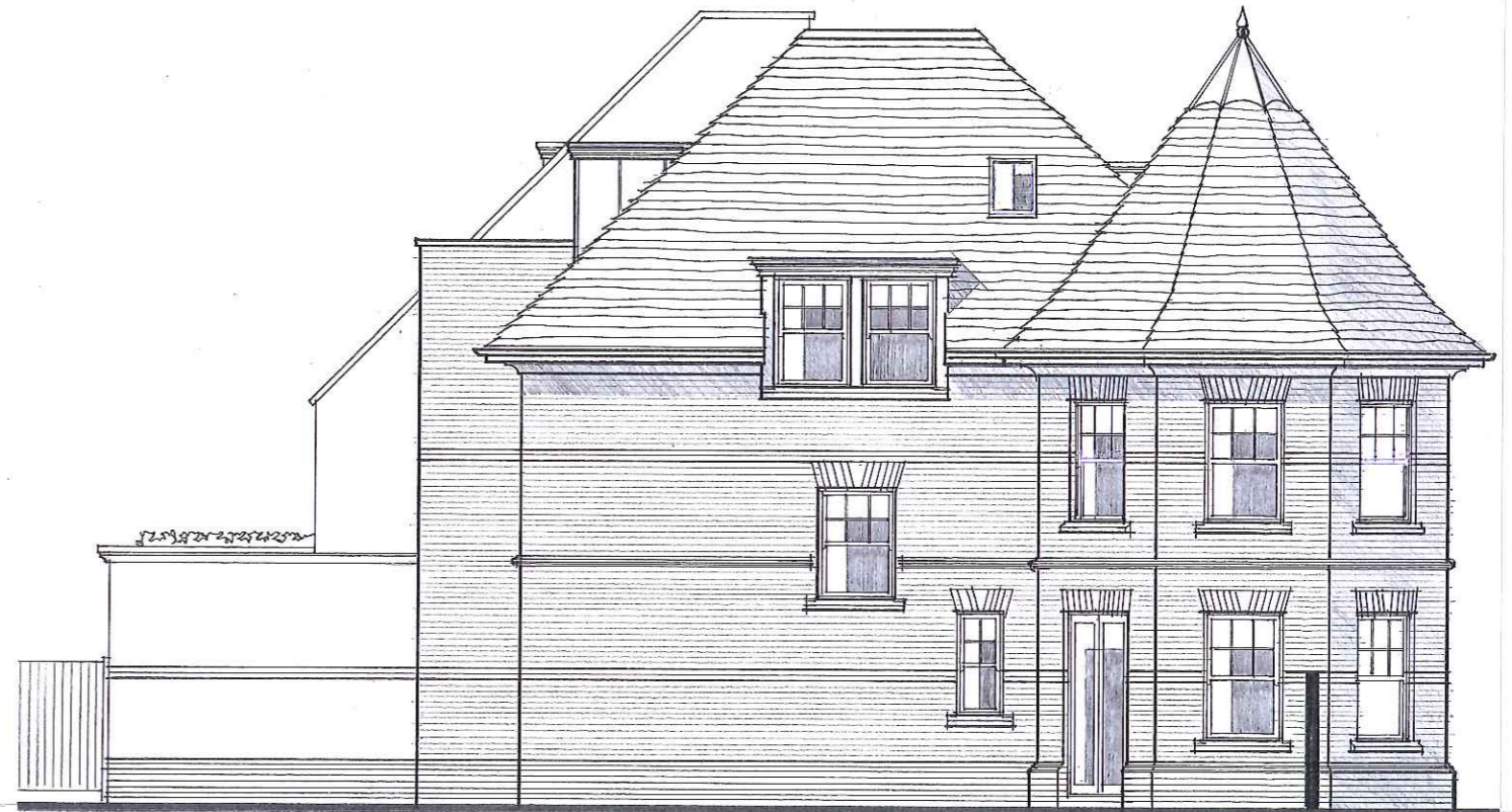
SIDE ELEVATION ~ PLOT 1