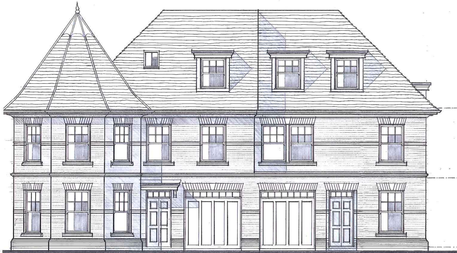
FRONT ELEVATION ~ PLOTS 1-2