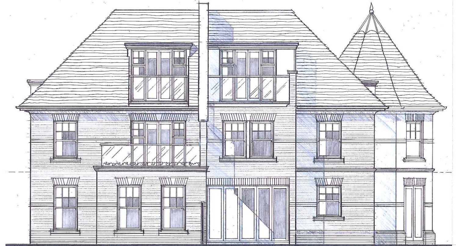
REAR ELEVATION ~ PLOTS 1-2.