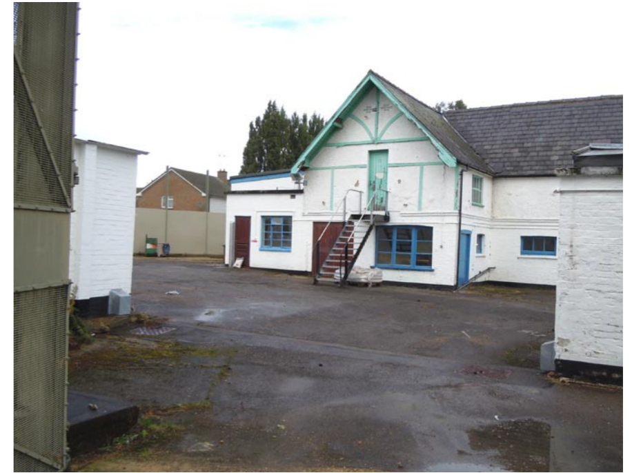
Existing buildings and hardstanding