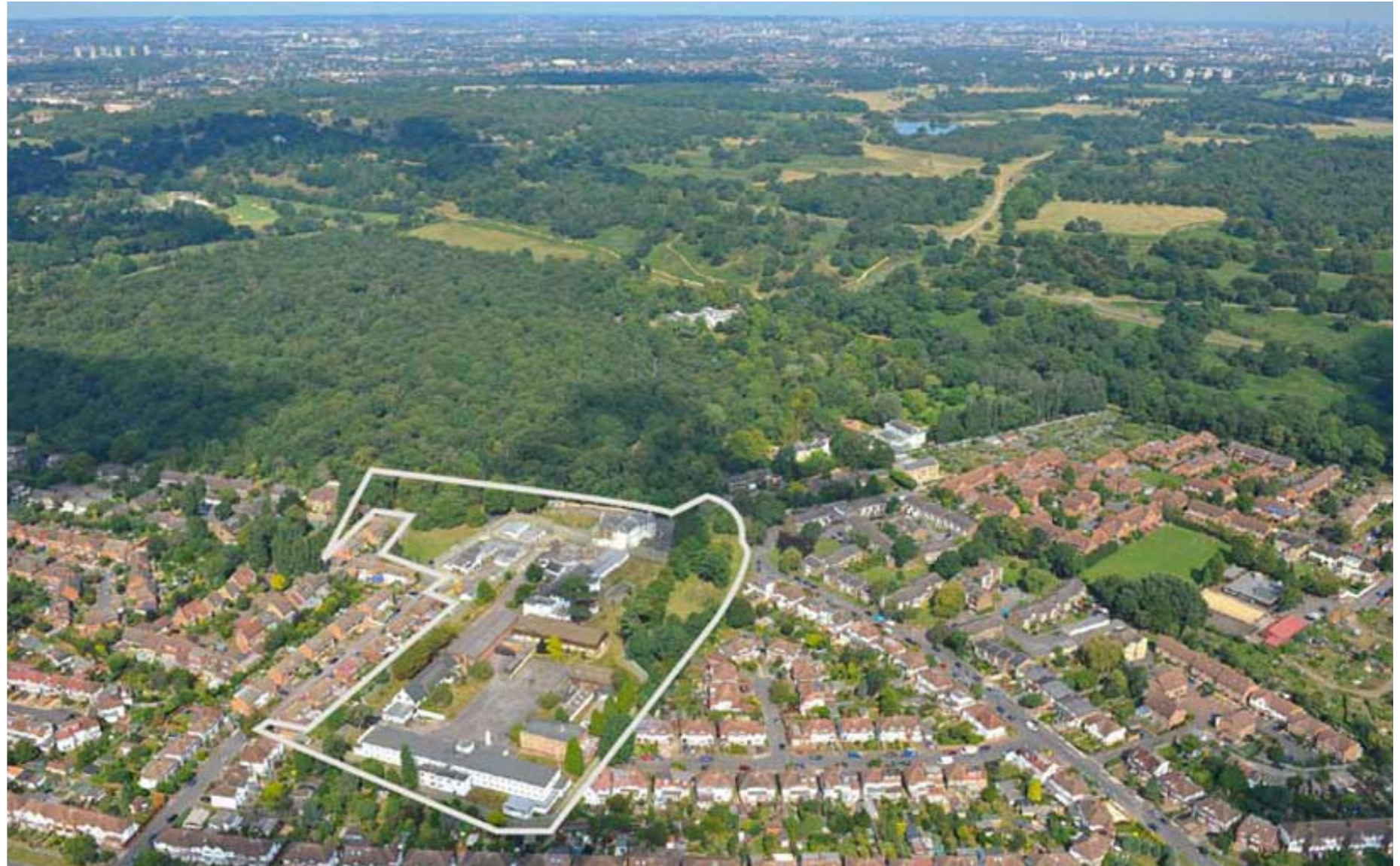
Aerial view of Latchmere House site with Richmond Park in the background

The scheme illustrated here is for the demolition of all buildings on site, with the exception of Latchmere House itself, and construction of 69 houses – a mixture of three, four and five bedrooms – the sensitive conversion of Latchmere House into 7 apartments and also the construction of 22 new apartments across three small apartment blocks. The landscape setting of Latchmere House will be hugely improved, with a new public green and open parkland provided.