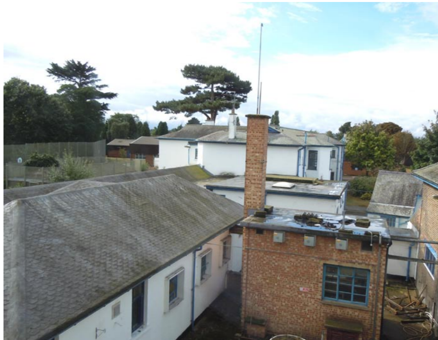
View across existing building roofs