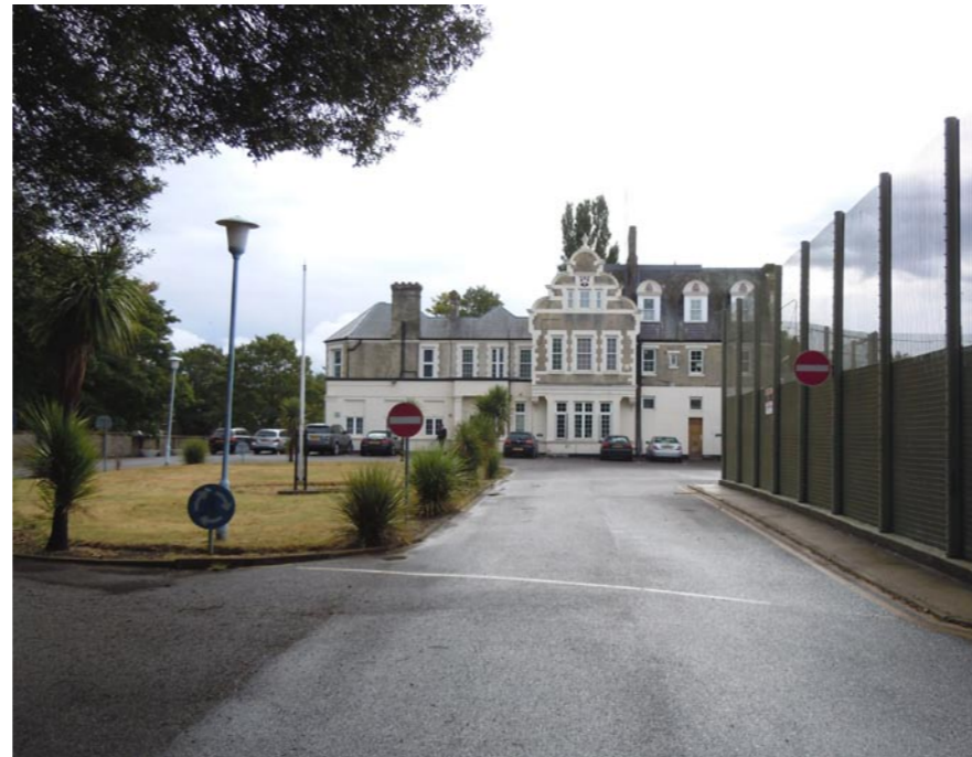
View towards Latchmere House