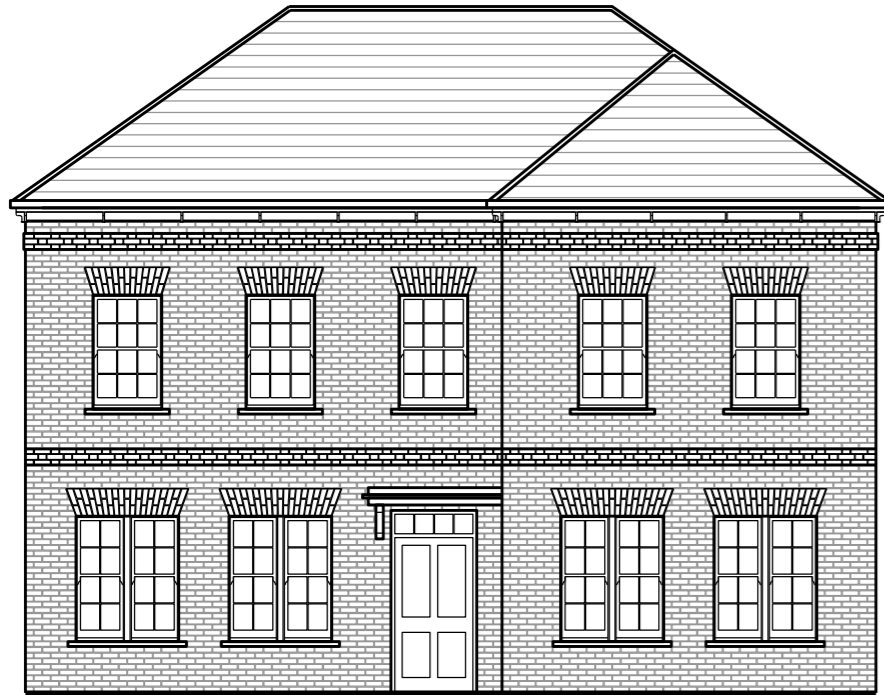
Front Elevation House Type F3