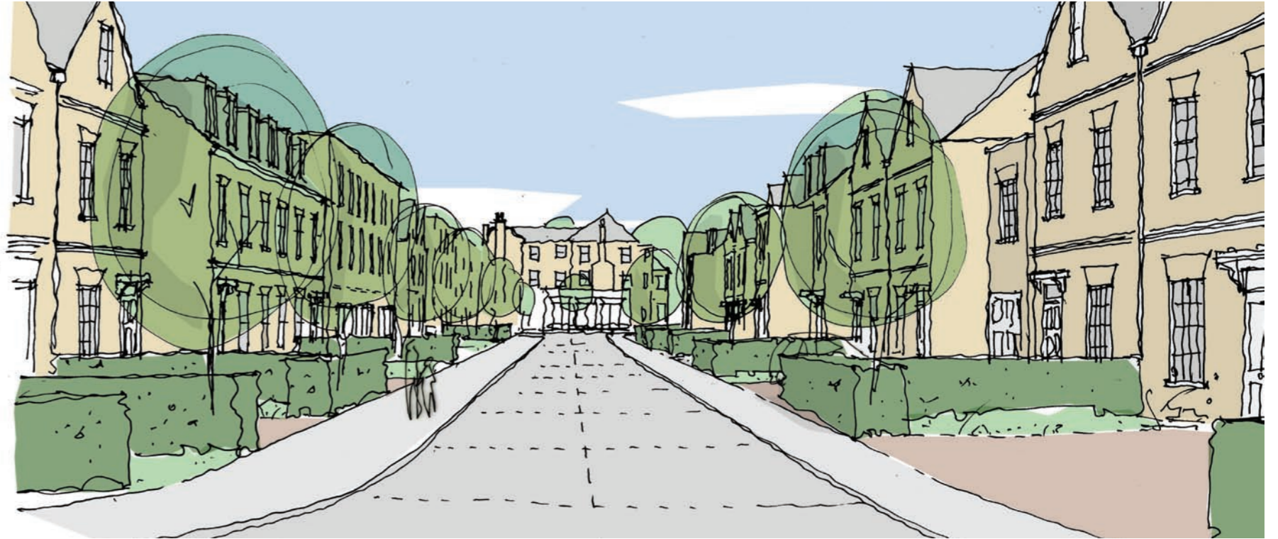
View east along main avenue towards Latchmere House

Latchmere House provides the focal point for the avenue and is framed at the eastern end. Front gardens are a mixture of pavers, hedges, low brick walls, trees and soft landscape.