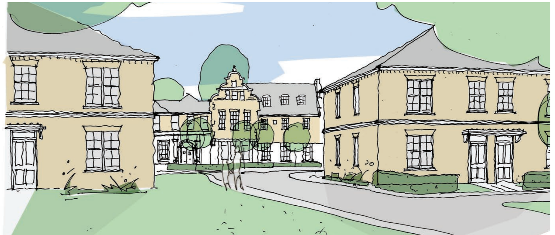
View past 'gatehouses' towards Latchmere House

The gatehouses compress the entrance driveway, frame the view to Latchmere House and create a sense of arrival.