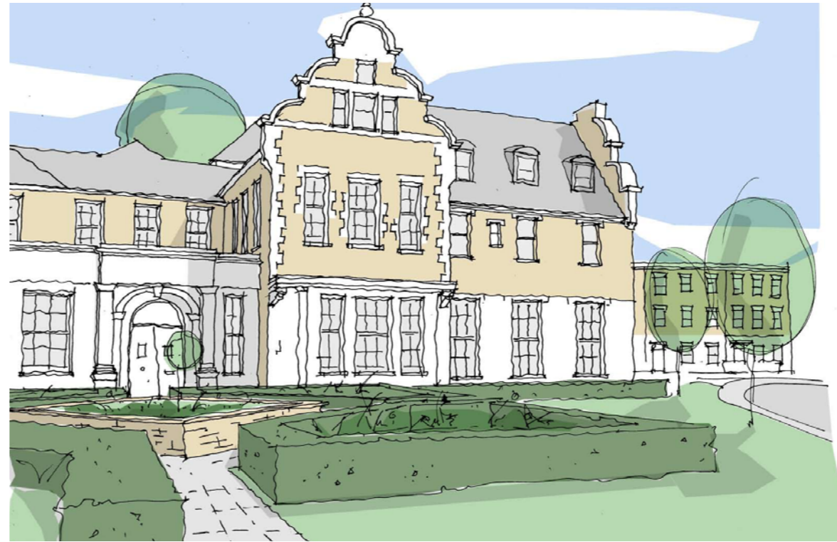
View of front of Latchmere House

To the front of Latchmere House significant landscape improvements are proposed including a formal knot garden, water feature and pedestrian paths on axis with the front entrance. This is all described in greater detail in the landscape section. Architecturally the building will be restored, blocked up windows reinstated and PVC windows replaced with timber windows.