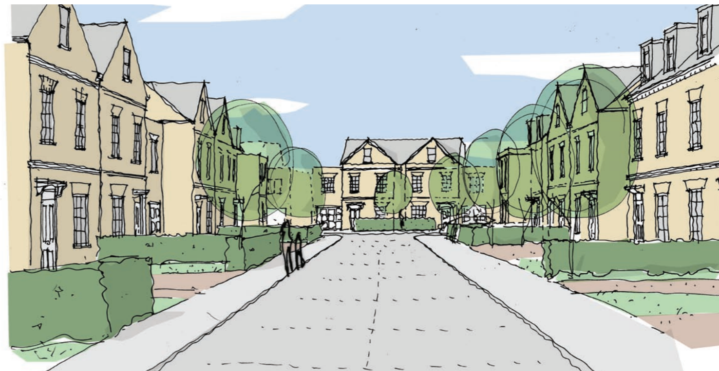
View west along main avenue

The main avenue is lined with trees and maximises the amount of green space to front gardens whilst providing off-street parking. This view has changed in final masterplan to include a focal double fronted house at the termination of the avenue with a feature gable.