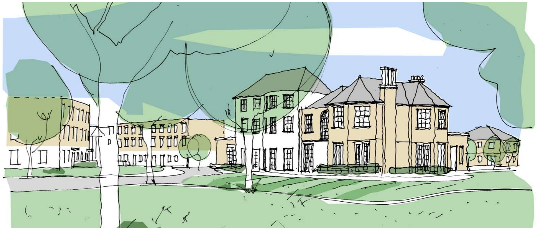
View across parkland to south west of Latchmere House

The view to Latchmere House from Latchmere Lane is opened up with the removal of the concrete boundary walls. A formal mown lawn recreates the setting of the house, with open parkland on the Latchmere Lane itself. Sensitive separations between public and private are envisaged and outlined in the landscape sections.