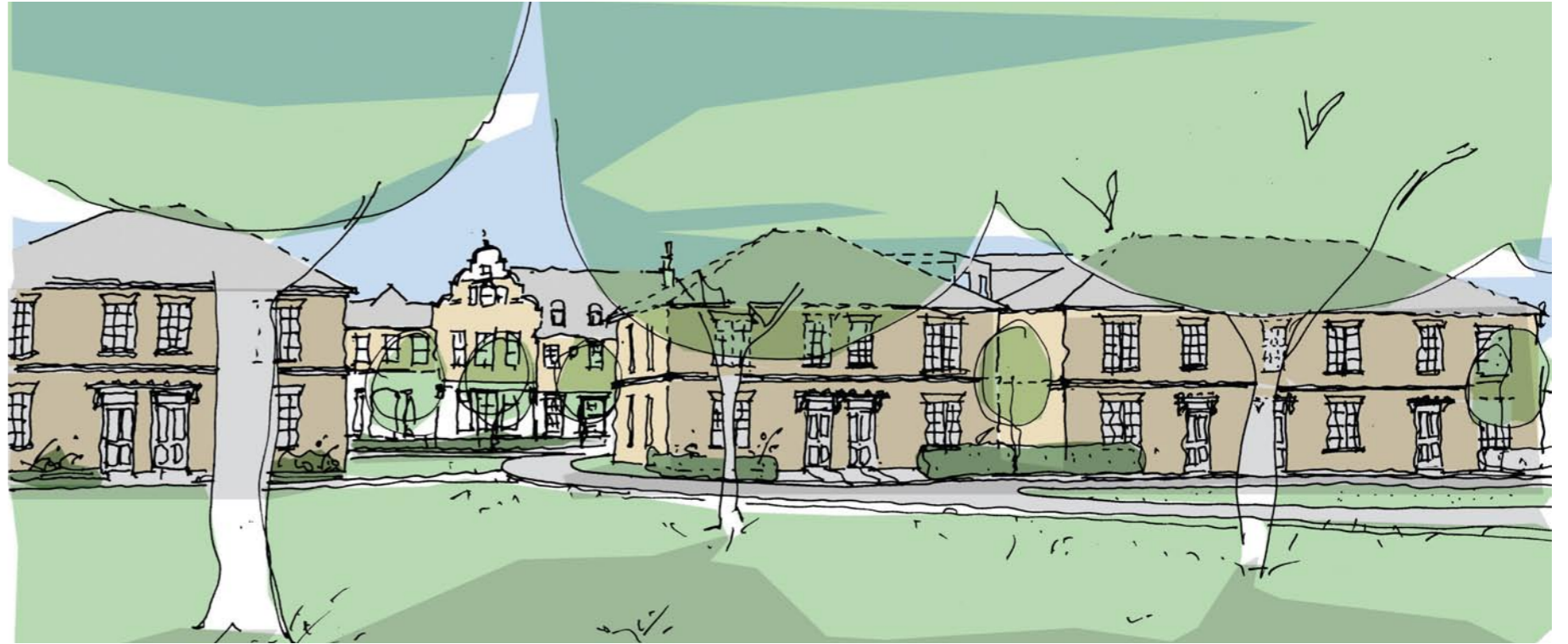
View across Latchmere Green towards Latchmere House

Approaching the site from Church Road passing the new village green on the right and mature woodland on the left. The village green is framed to the south by two new terraced houses with landscaped front gardens and entrances doors addressing the street. This terrace completes the framing of the square together with the existing properties on Latchmere Close. A pair of 'gatehouses' frame the view to Latchmere House itself.