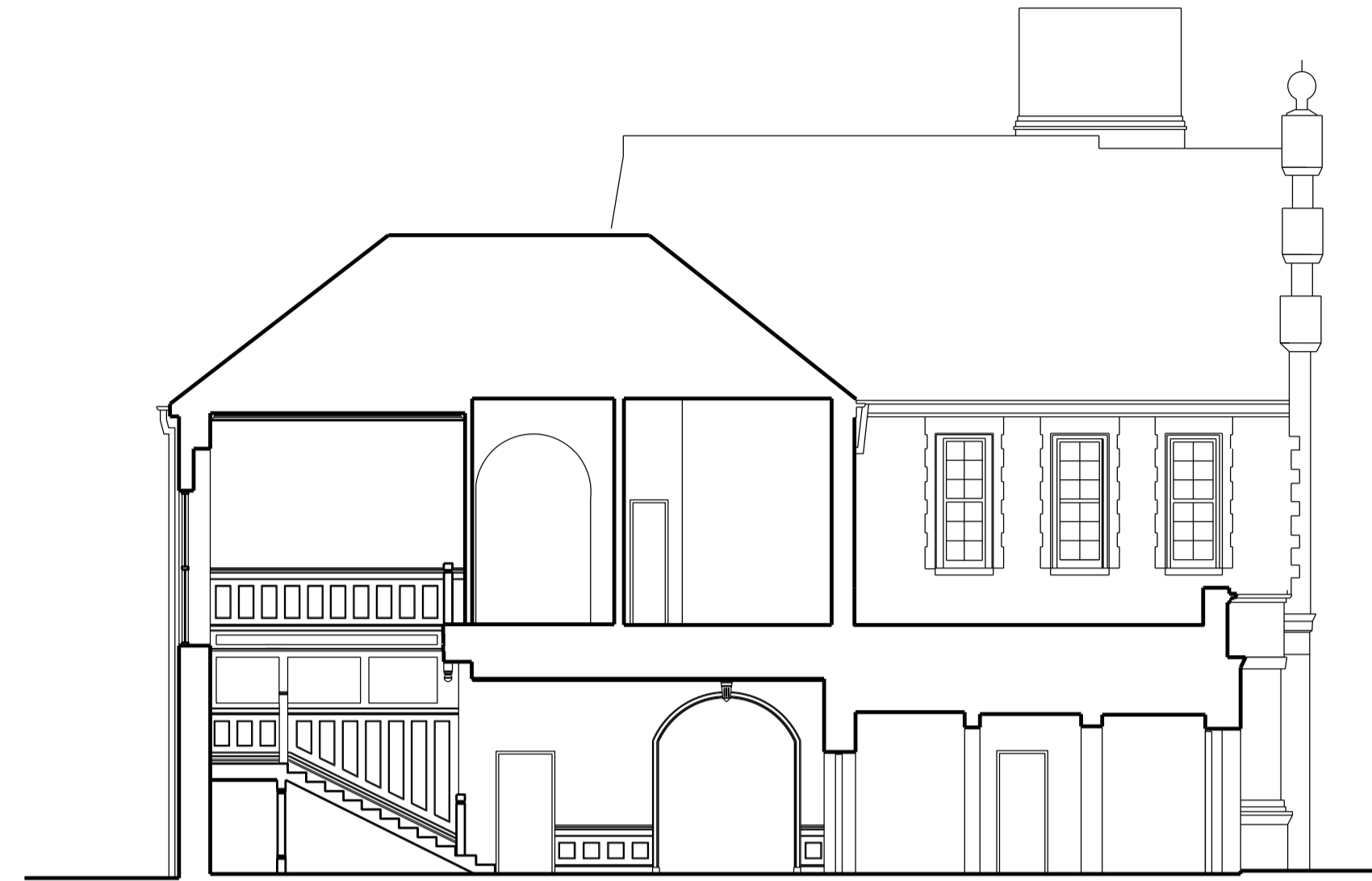
02 Existing Section B - B SCALE: 1:100