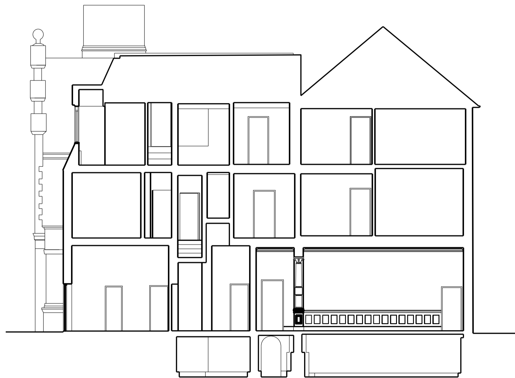
04 Existing Section C - C SCALE: 1:100