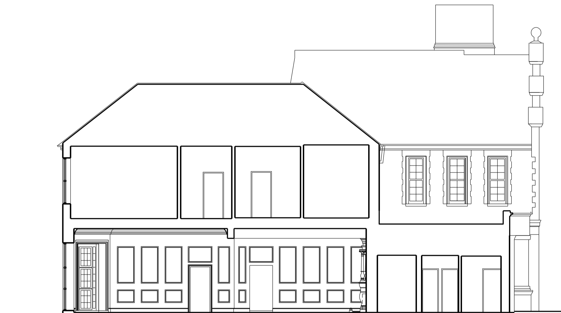
03 Existing Section E - E SCALE: 1:100

00 Issued for Planning 20/12/13 ET GS Rev: Description: Date Dwn by: Ckd by: