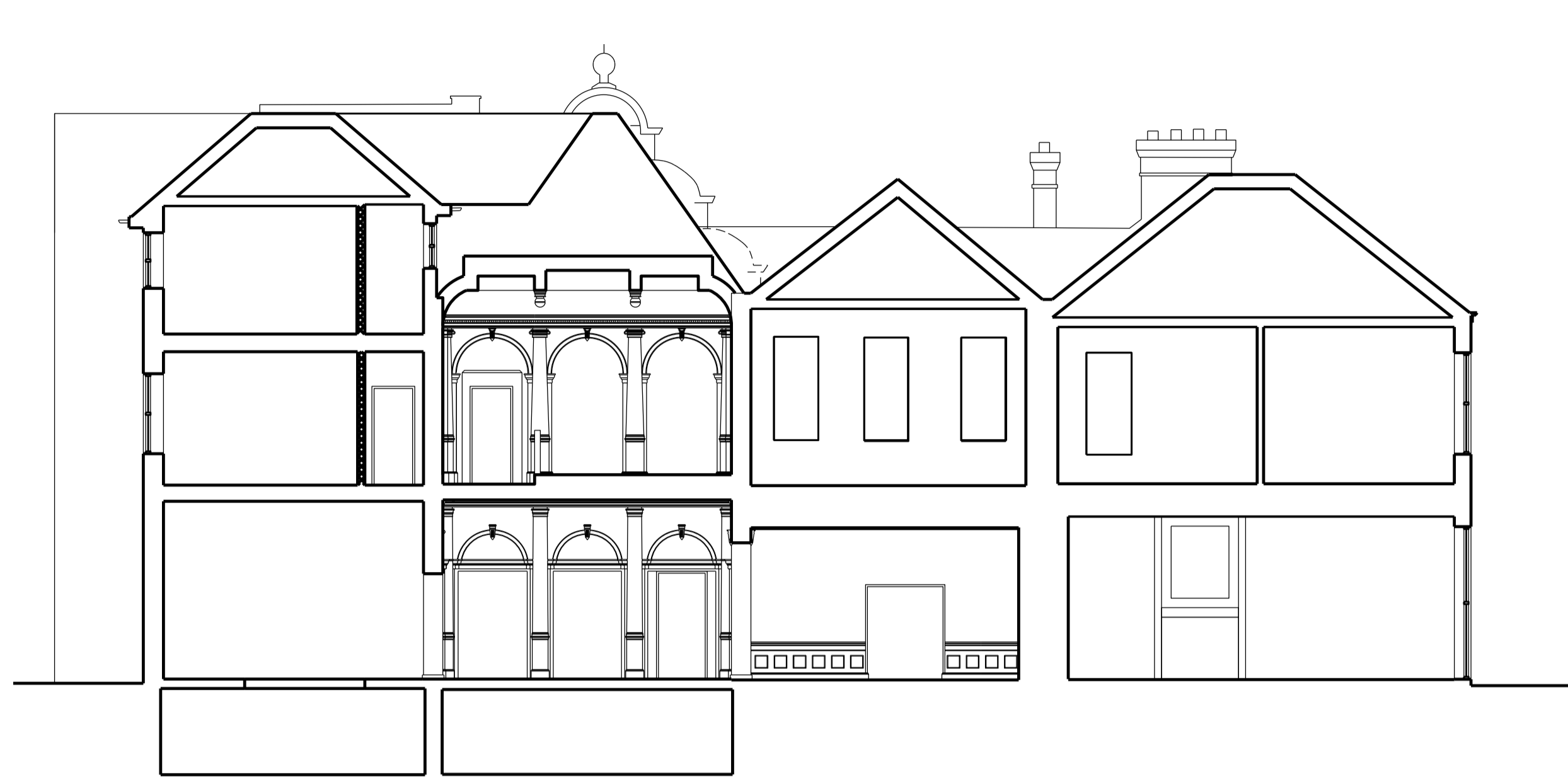
01 Existing Section A - A SCALE: 1:100

All materials shown or highlighted are indicative only and may be subject to changes made during the detailed design development.