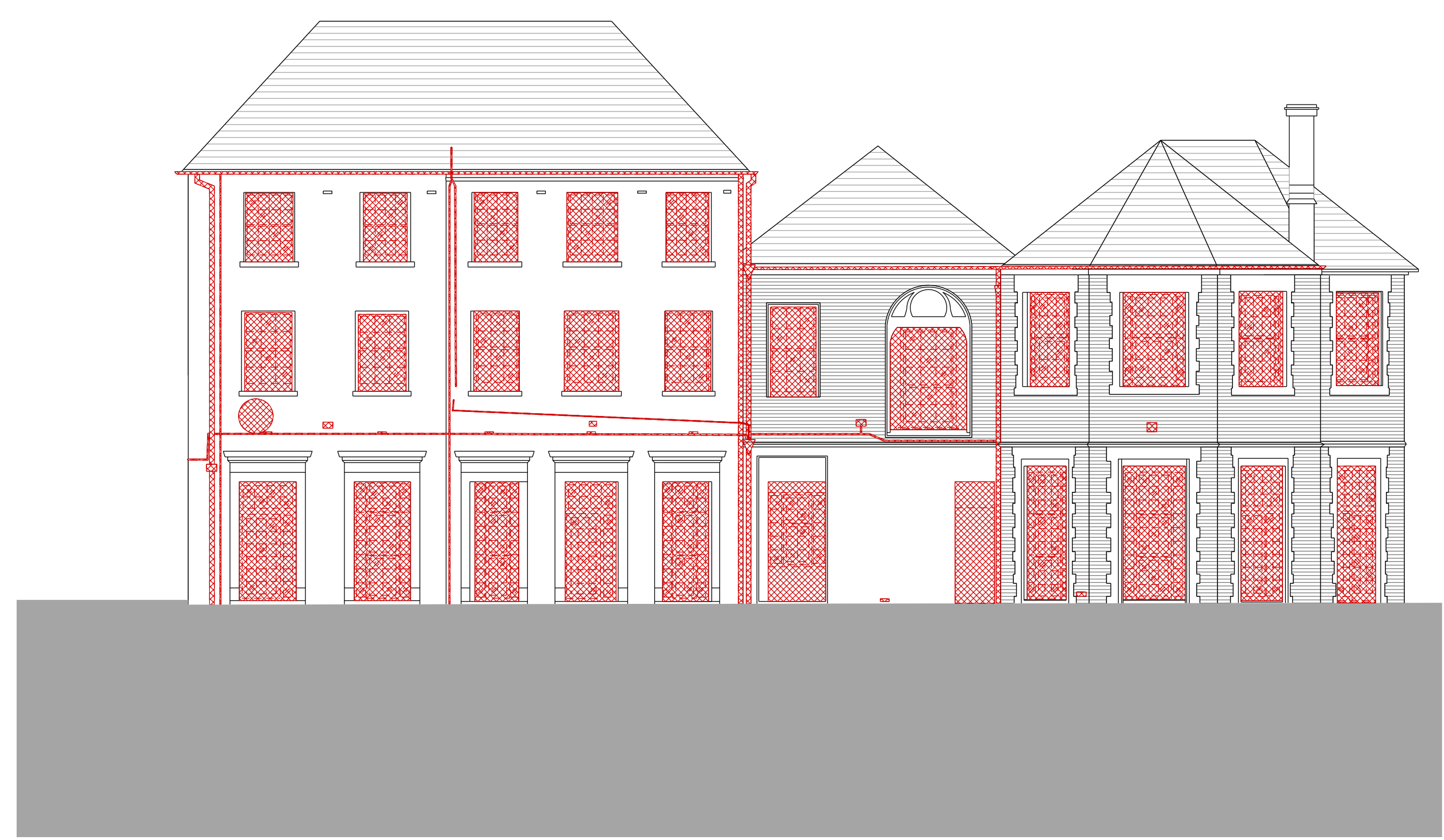
04 South East (Garden) Elevation SCALE: 1:100