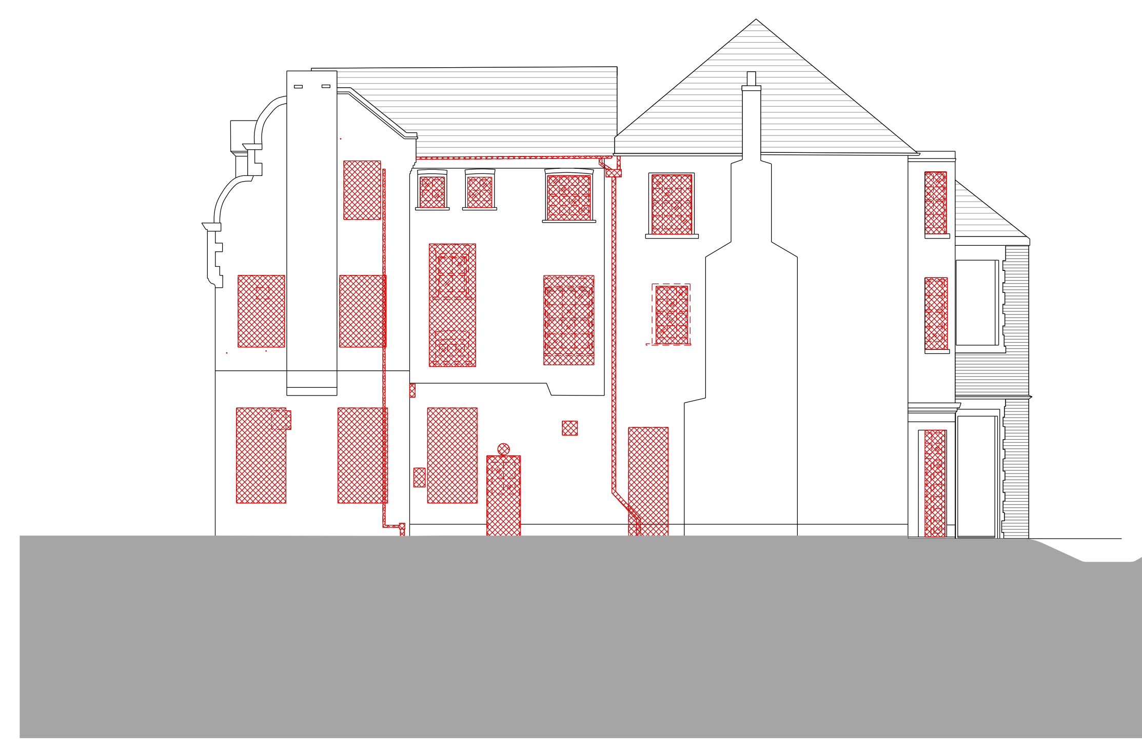
03 South West Elevation SCALE: 1:100

00 Issued for Planning 20/12/13 VW GS Rev: Description: Date Dwn by: Ckd by: