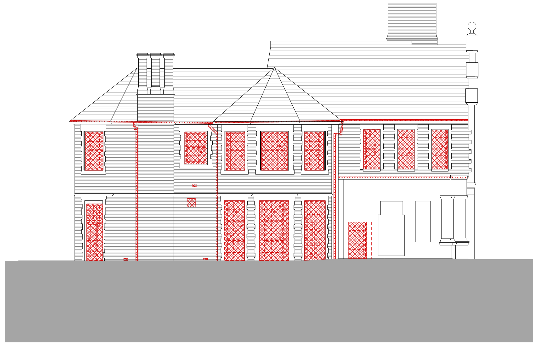
02 North East Elevation SCALE: 1:100