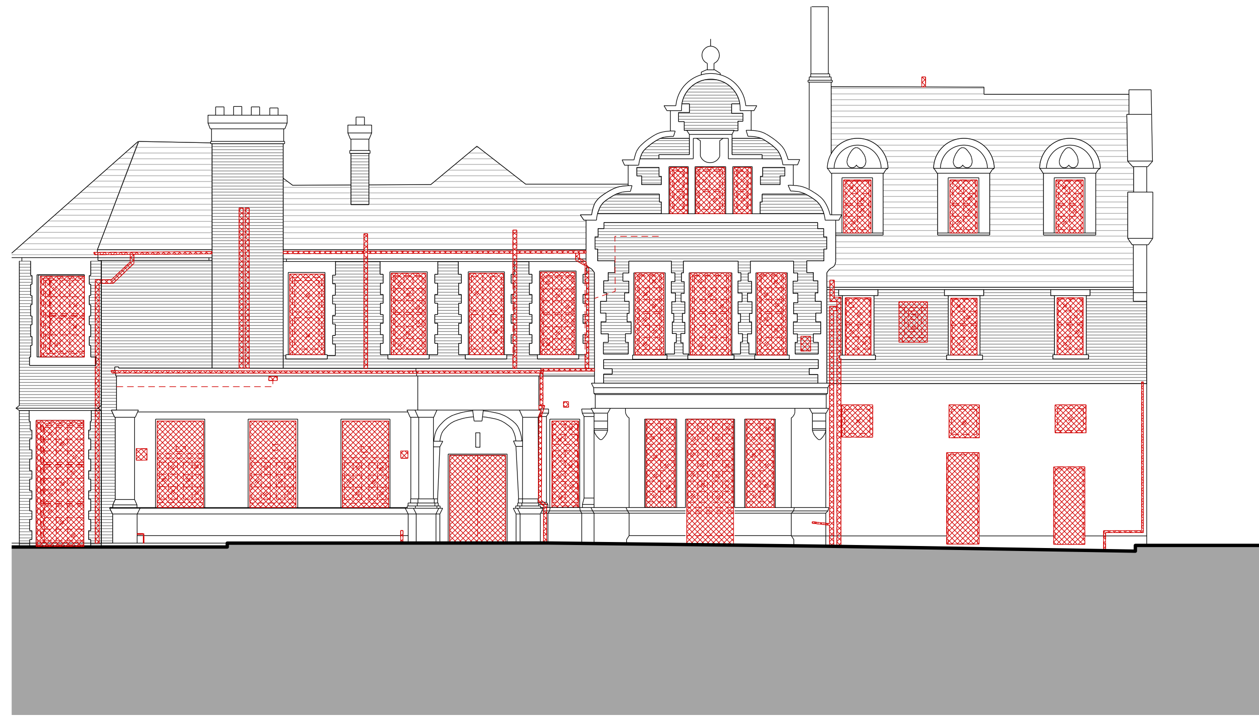
01 North West (Front) Elevation SCALE: 1:100