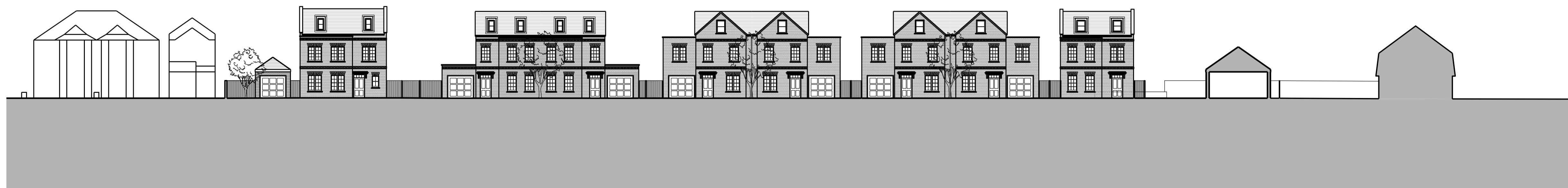
04 Proposed Street Scene Elevation: Close Looking South East SCALE: 1:500