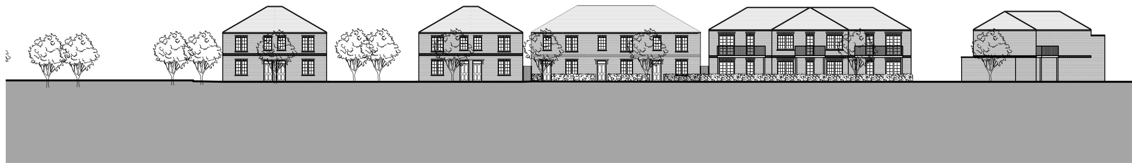
03 Proposed Street Scene 03: Greenside Houses SCALE: 1:500