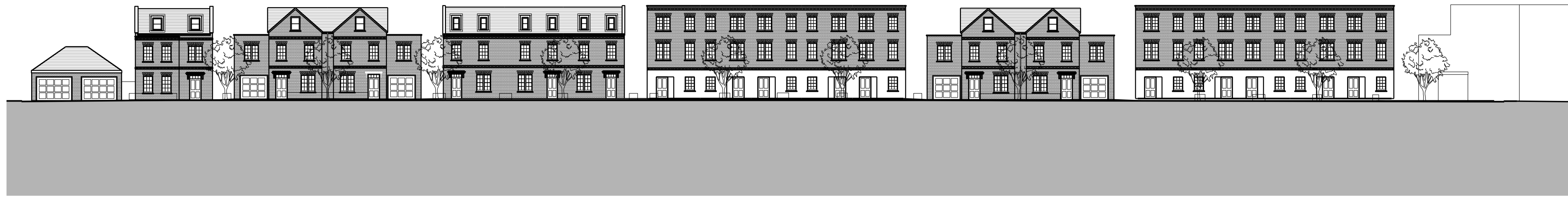
01 Proposed Street Scene Elevation 01: Avenue Looking North West SCALE: 1:500