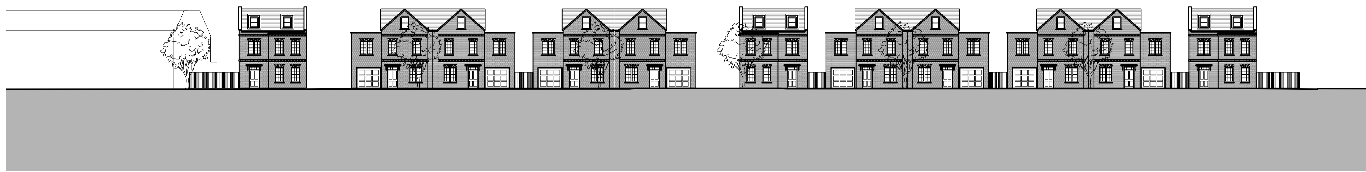
02 Proposed Street Scene Elevation 02: Avenue Looking South East SCALE: 1:500