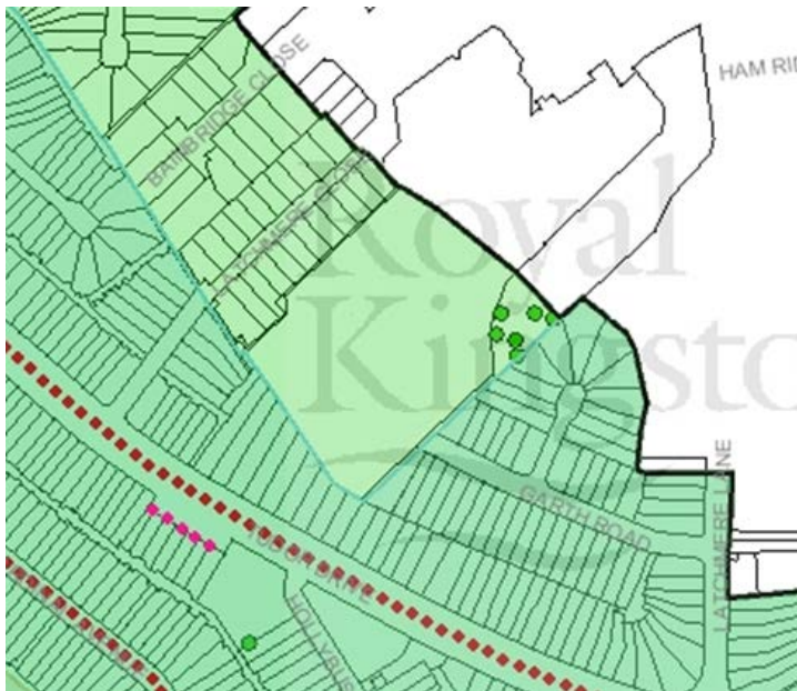
Figure 2: Kingston Core Strategy Proposals Map (2012)

3.9 The Latchmere House and HM Remand Centre Planning Brief (2013) was produced jointly by LBR and RBK; the Brief is a non-statutory document, which is a material consideration for the site.