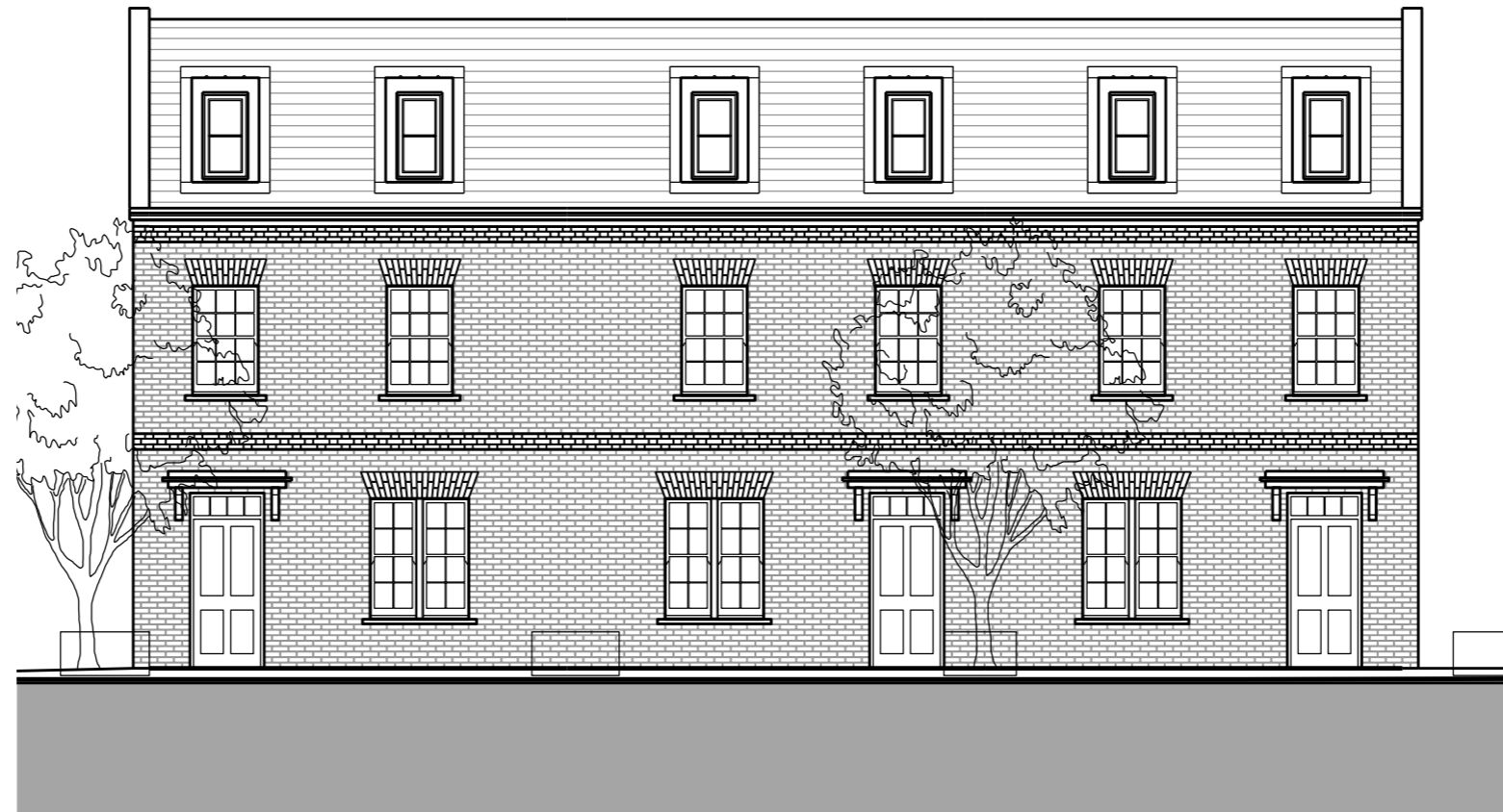
Front elevation - House Type B1 terrace