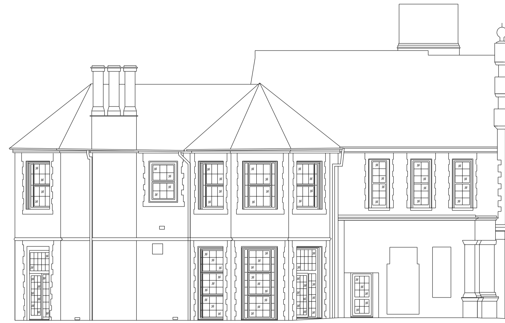
02 Existing North East Elevation WORKSHEET SCALE: 1/100