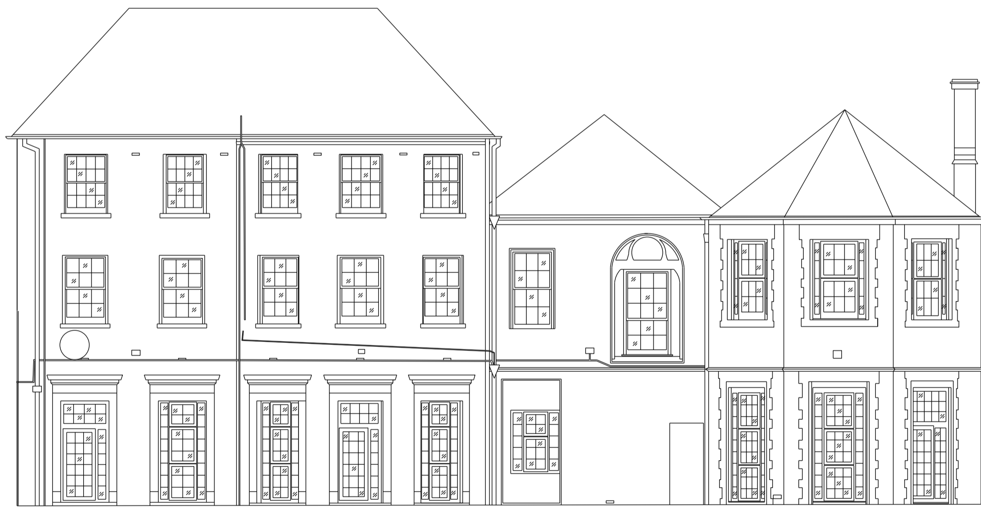
04 Existing South East (Garden) Elevation WORKSHEET SCALE: 1/100