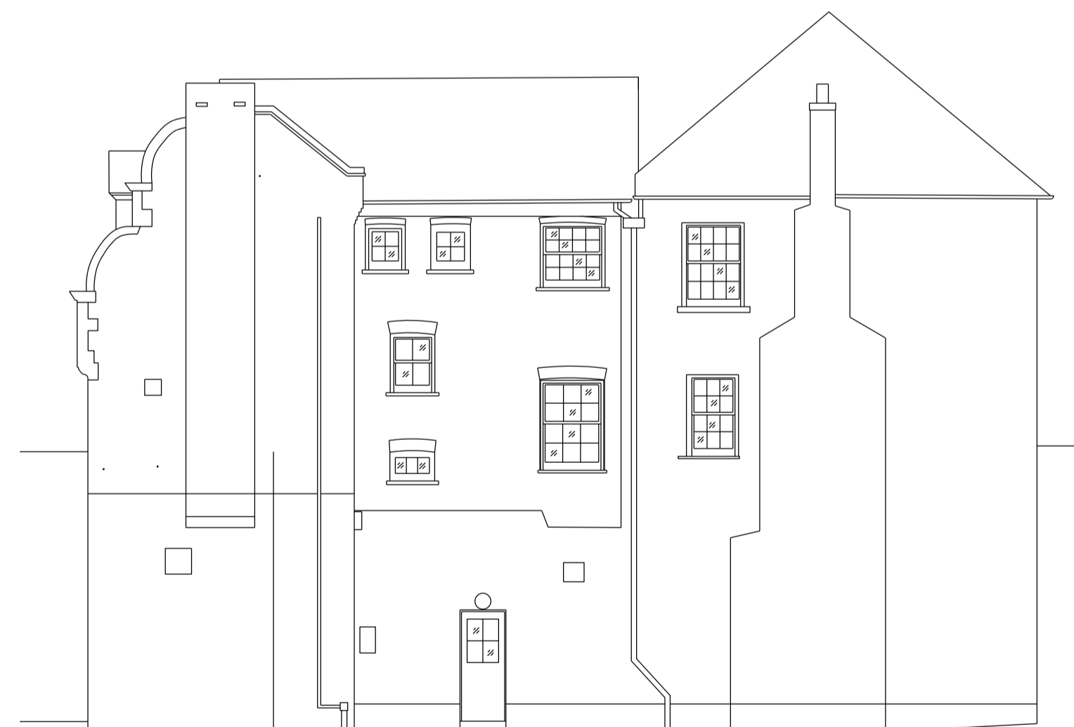
03 Existing South West Elevation WORKSHEET SCALE: 1/100

General Notes: Do not scale from this drawing. Use marked dimensions. Should any discrepancies be noted, please inform this office. This drawing is copyright of Matthew Allchurch Architects Limited