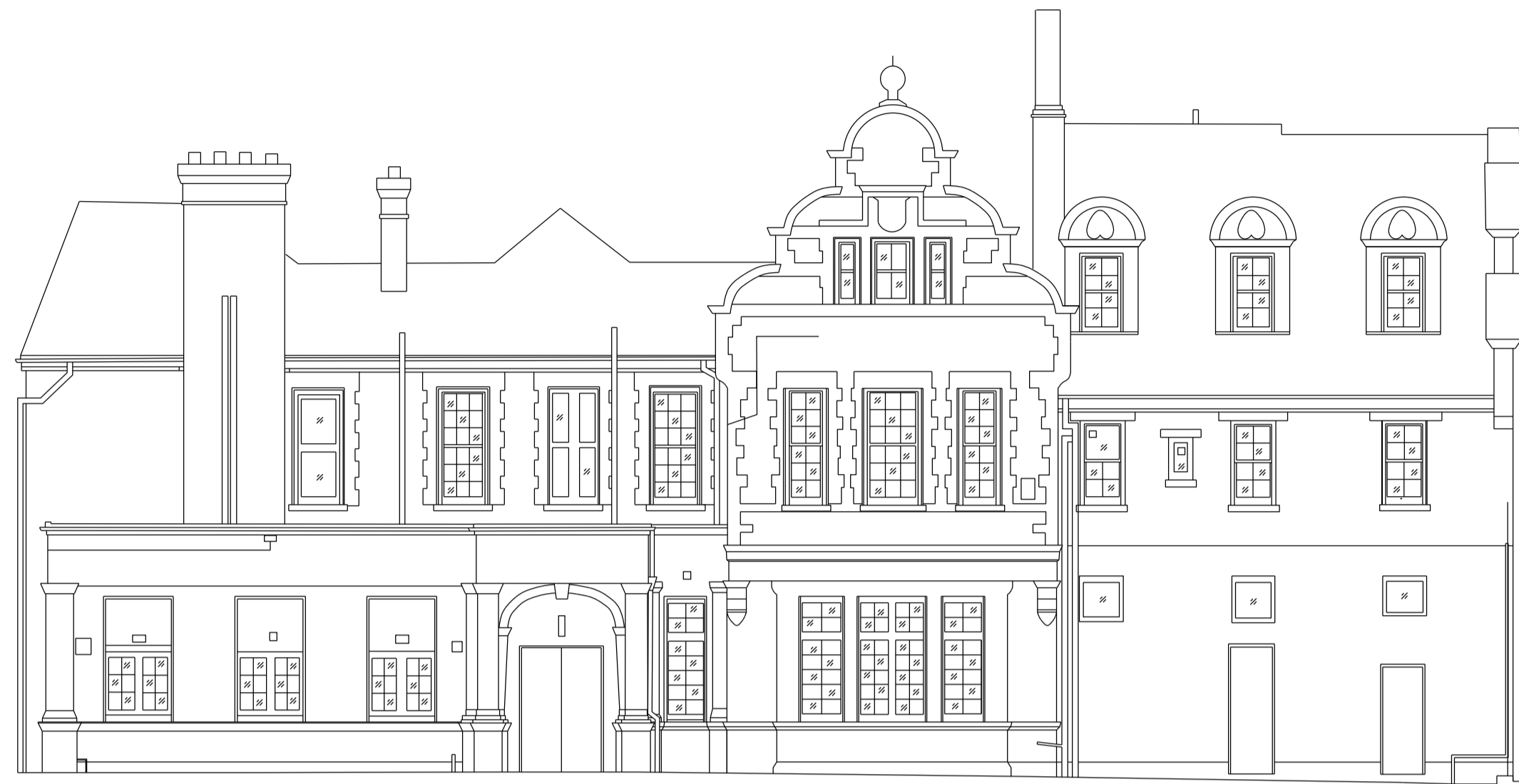
01 Existing North West (Entrance) Elevation WORKSHEET SCALE: 1/100