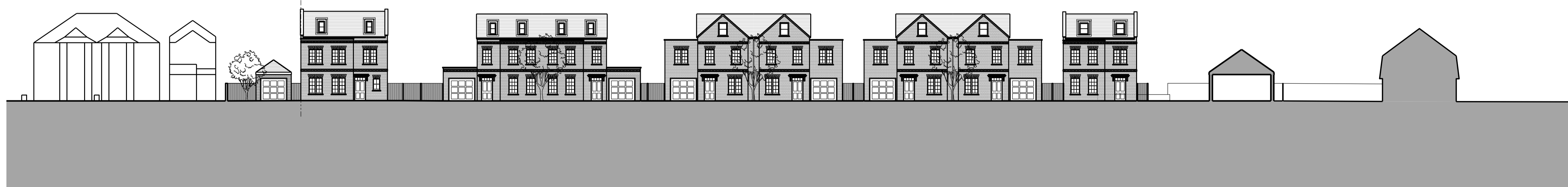
04 Proposed Street Scene Elevation: Close Looking South East SCALE: 1:500