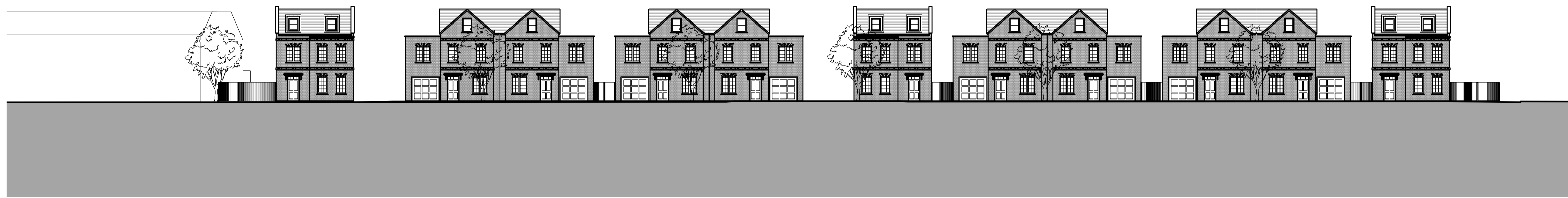
02 Proposed Street Scene Elevation 02: Avenue Looking South East SCALE: 1:500