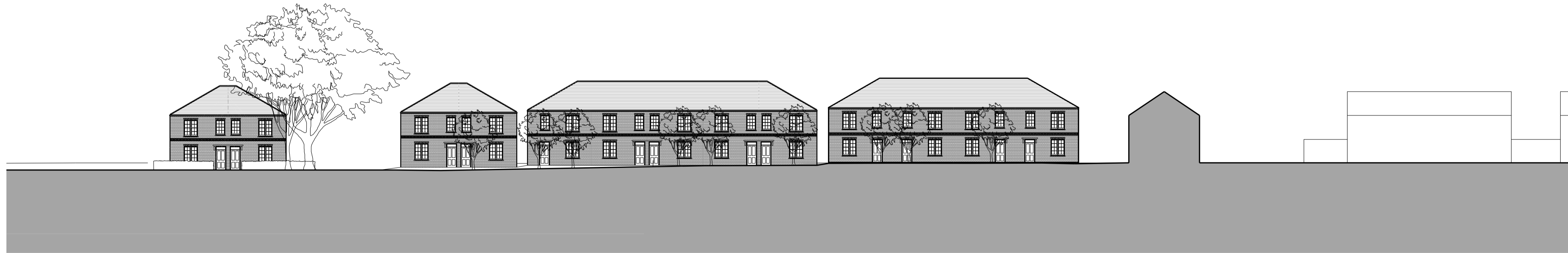
03 Proposed Street Scene 03: Greenside Houses SCALE: 1:500