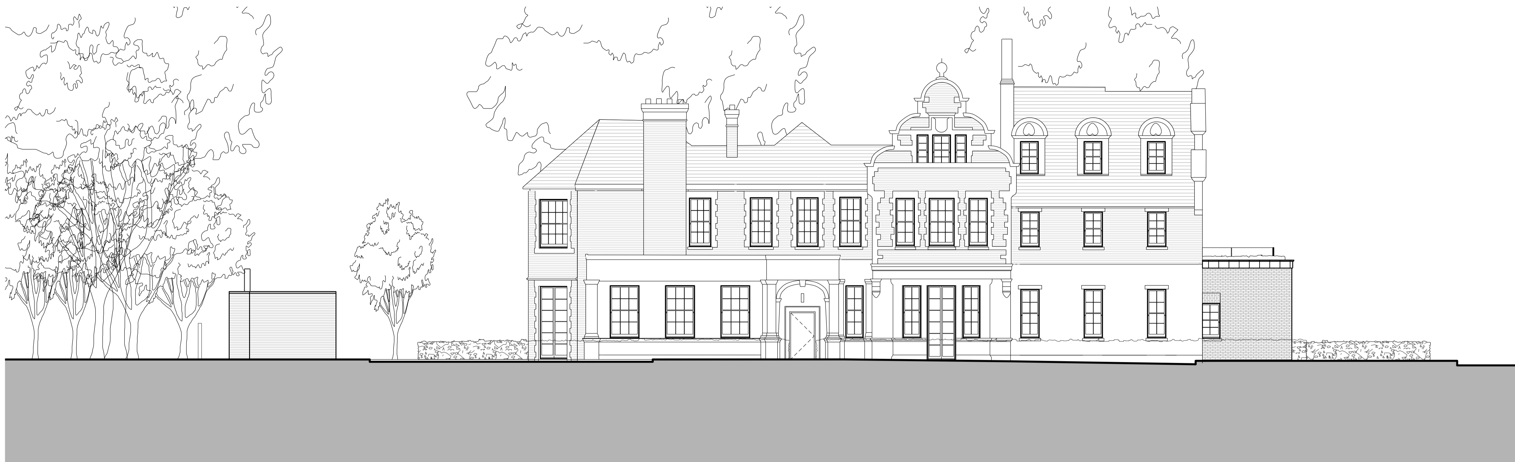
01 Proposed Front Elevation SCALE: 1:100