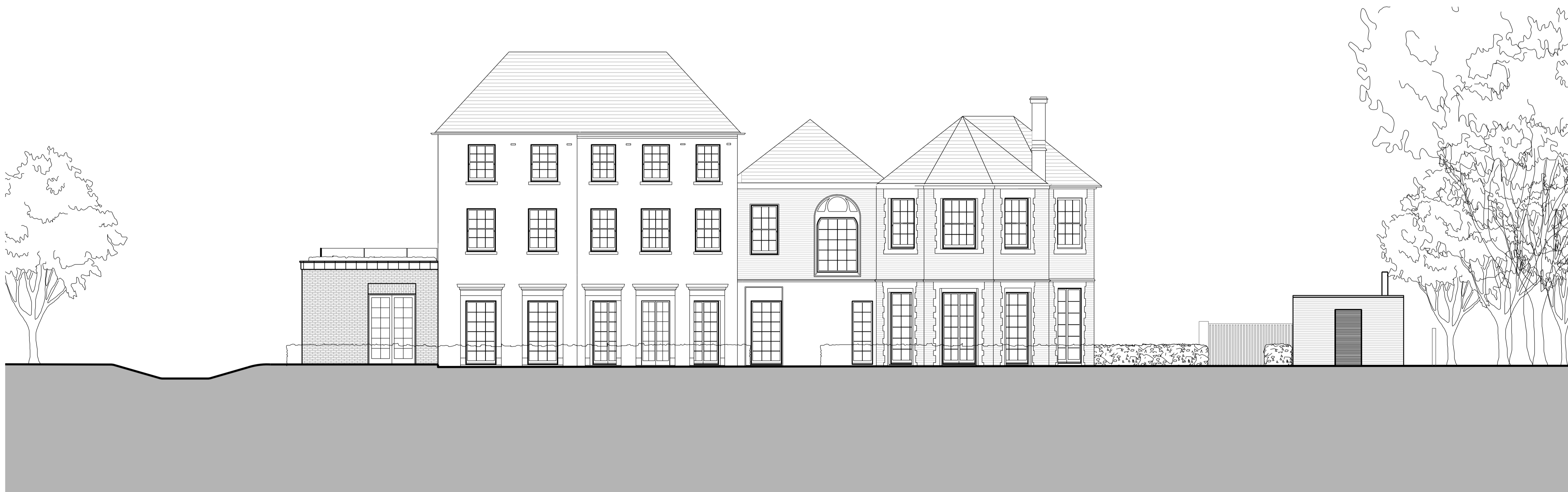
02 Proposed Rear Elevation SCALE: 1:100