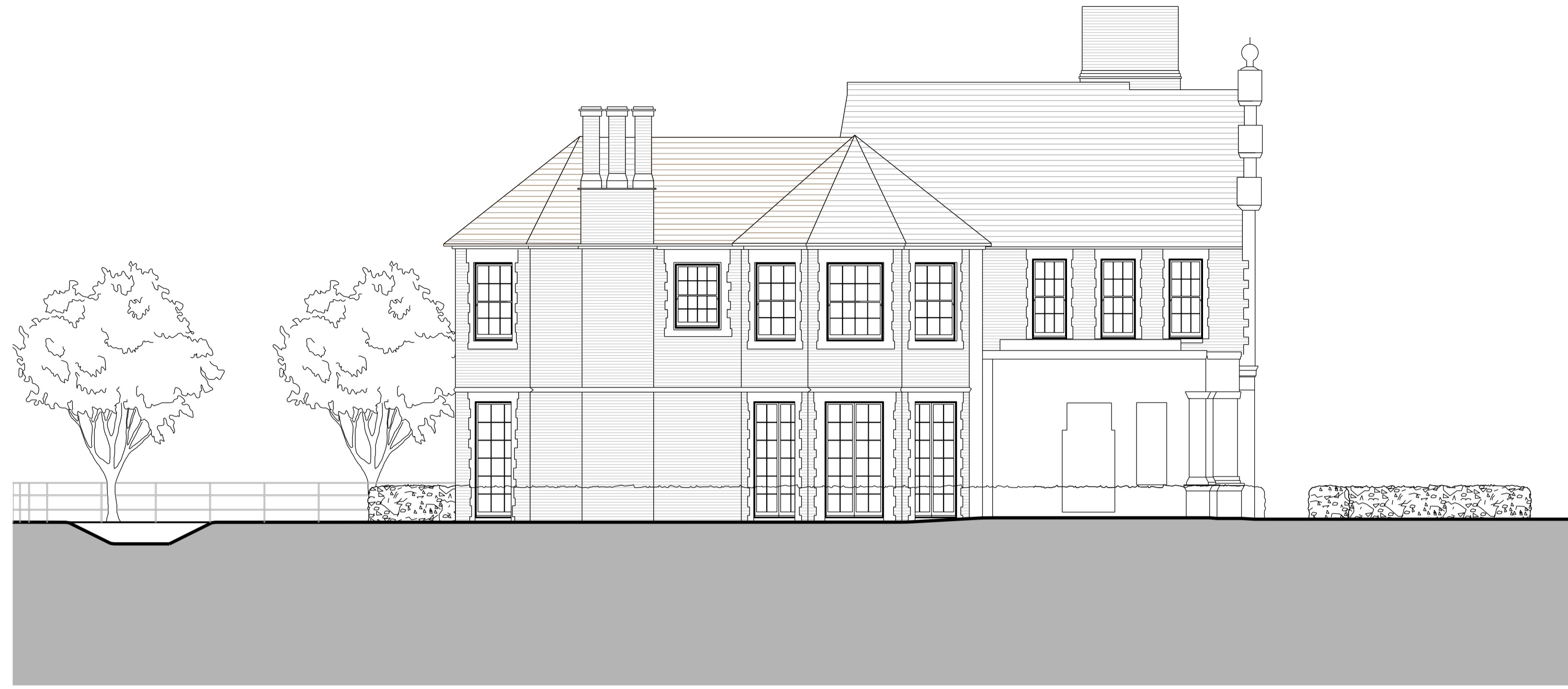
01 Proposed Right Side Elevation SCALE: 1:100