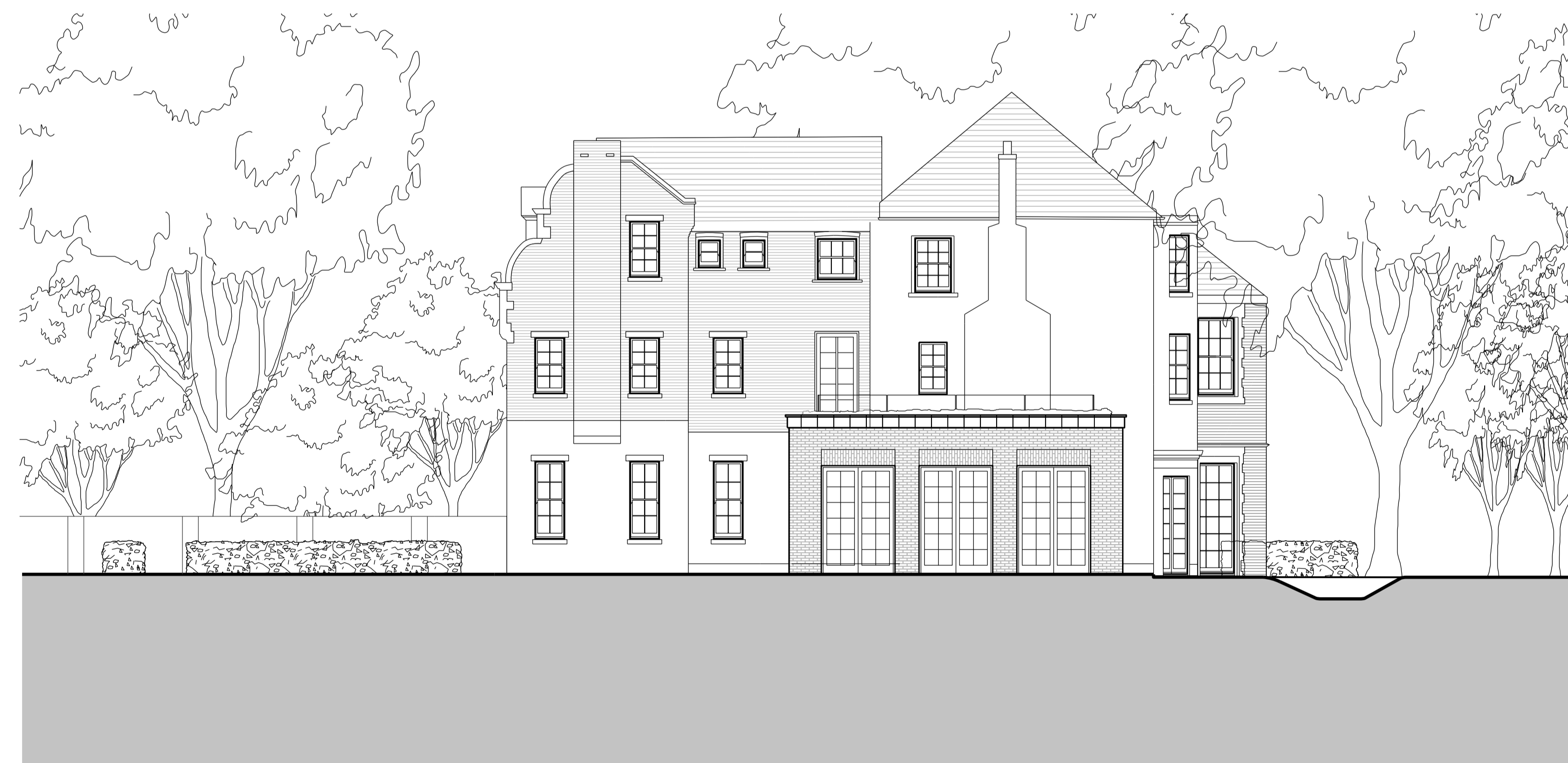
02 Proposed Left Side Elevation SCALE: 1:100