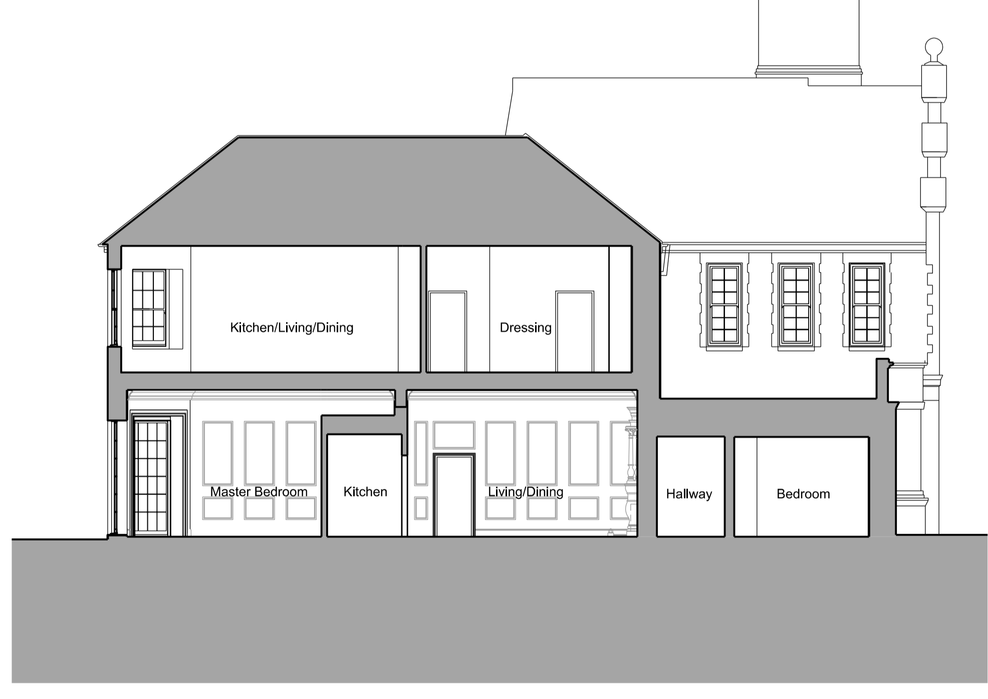
02 Proposed Section E - E SCALE: 1/100

00 Issued for Planning 20/12/13 VW GS Rev: Description: Date Dwn by: Ckd by: