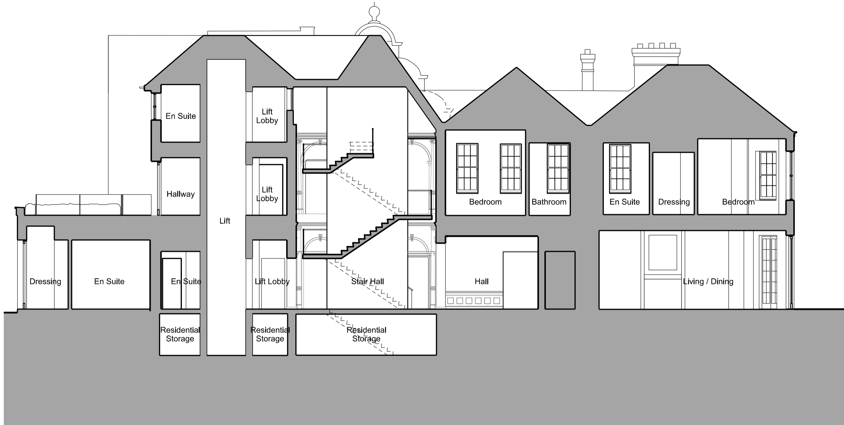
01 Proposed Section A - A SCALE: 1/100

Project Note: The internal layouts within residential apartments, houses and ancillary areas of buildings will be subject to design development. The precise locations of wall, internal doors, columns, risers and the detailed layouts of bathroom and kitchen areas will be the subject of non-material changes and may vary from the internal layouts set out in these plans. These minor alterations will not affect the position and arrangements of external doors and windows nor will they affect the relative relationship between habitable rooms and windows. All materials shown or highlighted are indicative only and may be subject to changes made during the detailed design development.