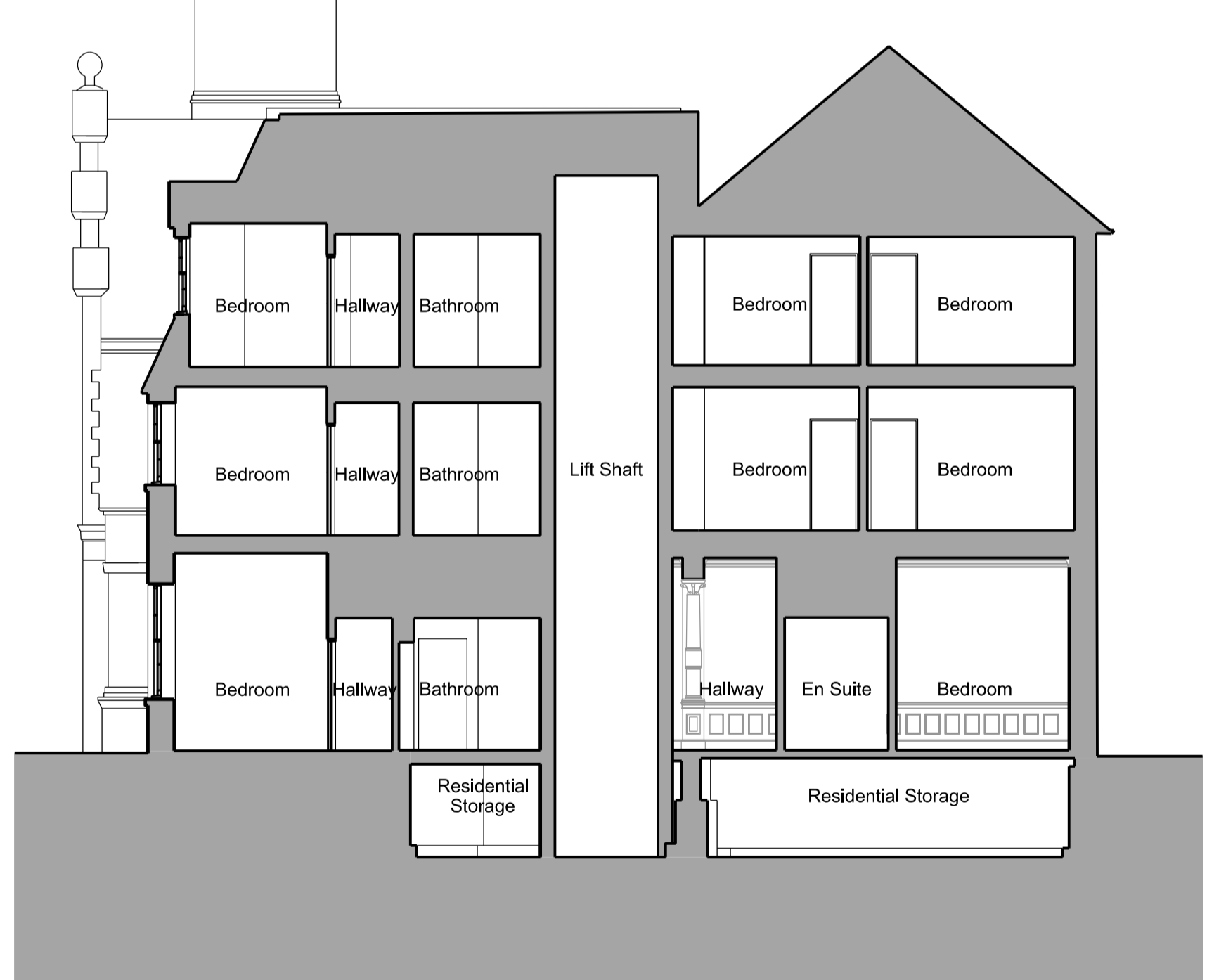
02 Proposed Section C - C SCALE: 1/100