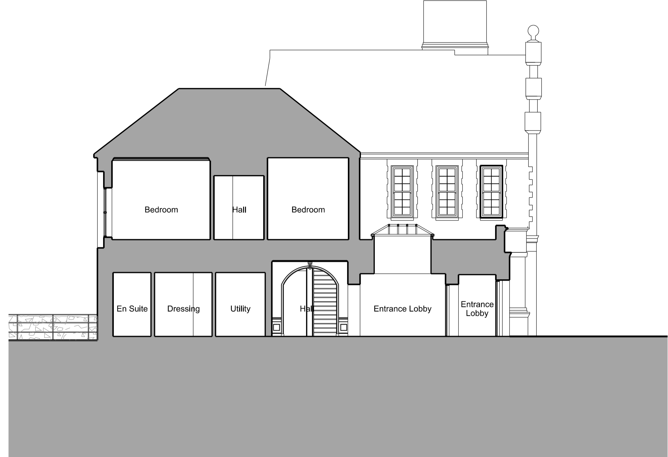
03 Proposed Section B - B SCALE: 1/100