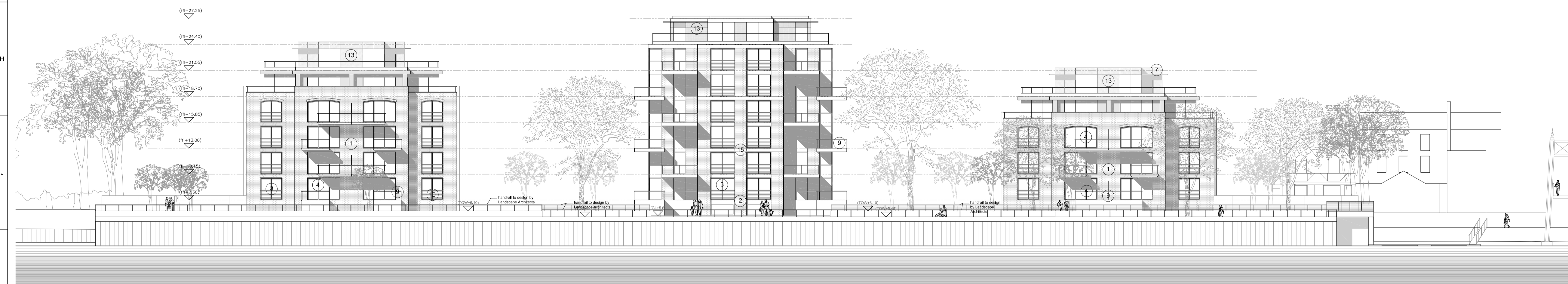
Proposed Elevation 2-2'