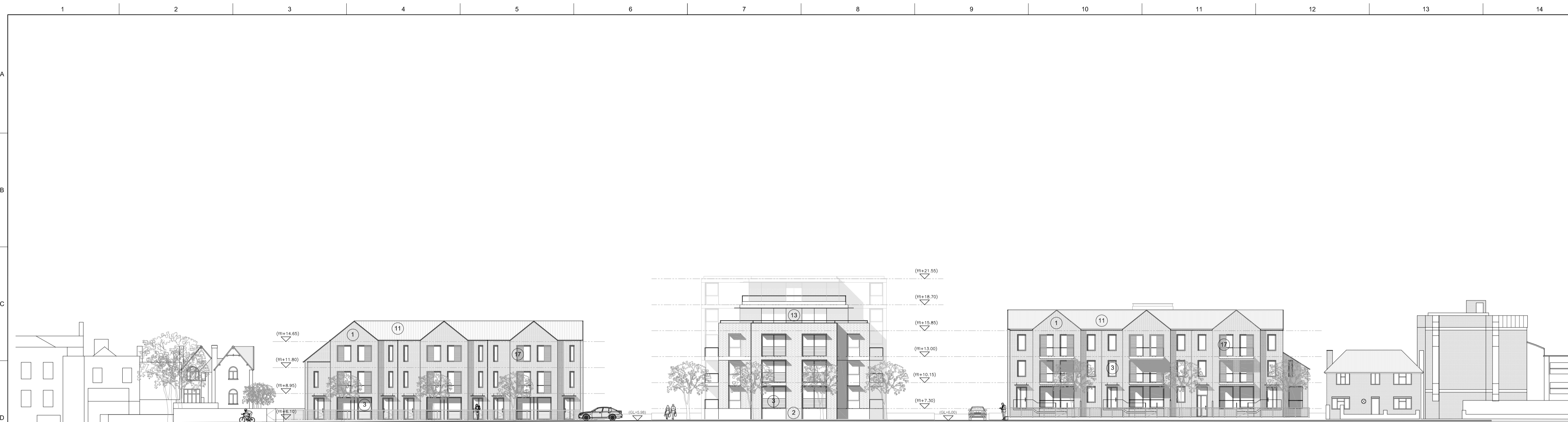
Proposed Elevation 1-1'