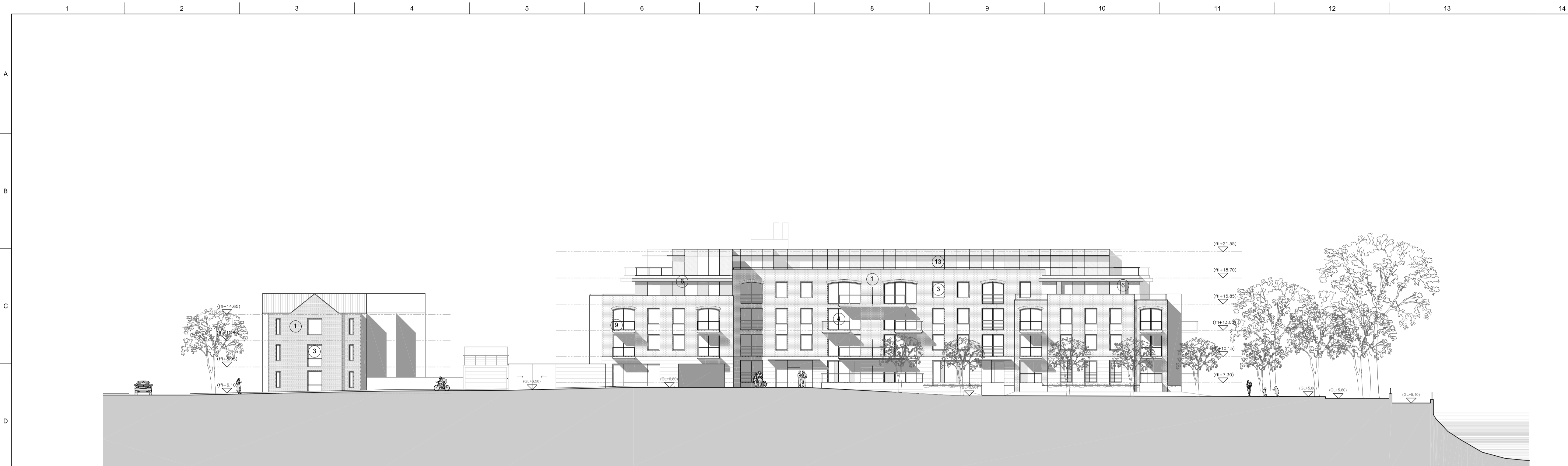
Proposed Elevation 3-3'