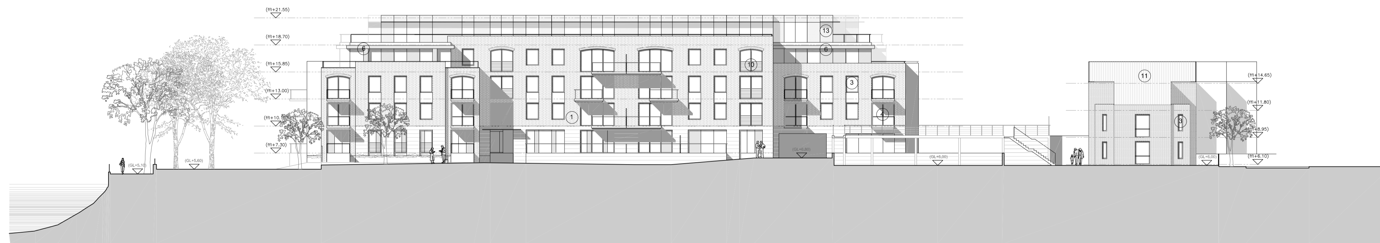
Proposed Elevation 4-4'

CLIENT STRUCTURAL ENGINEER SERVICES ENGINEER CONSULTANT