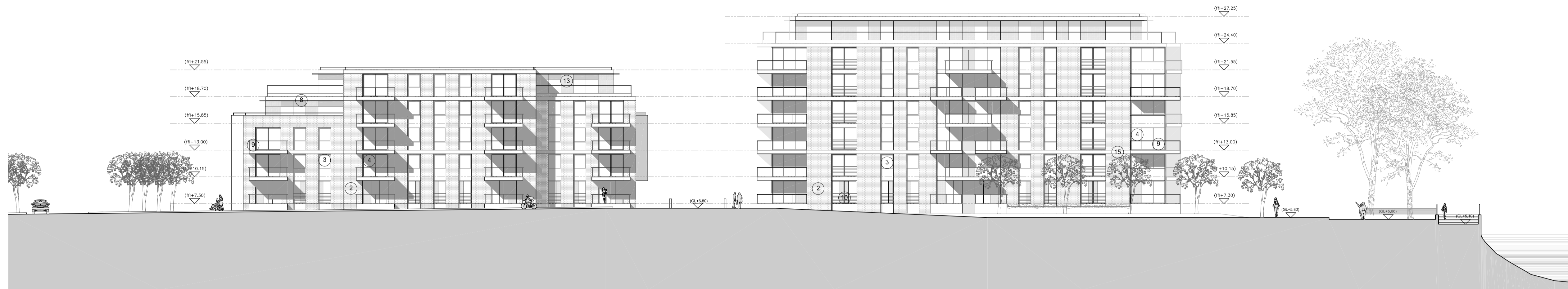
Proposed Elevation 5-5'