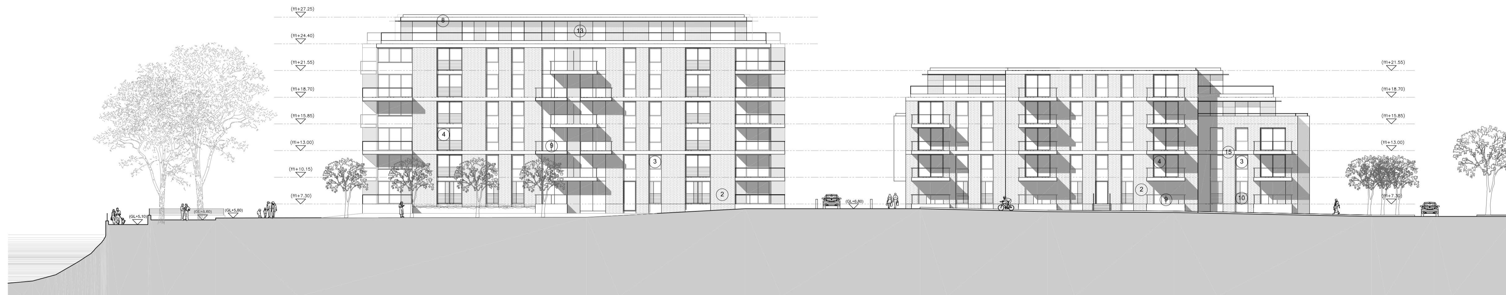
Proposed Elevation 6-6'