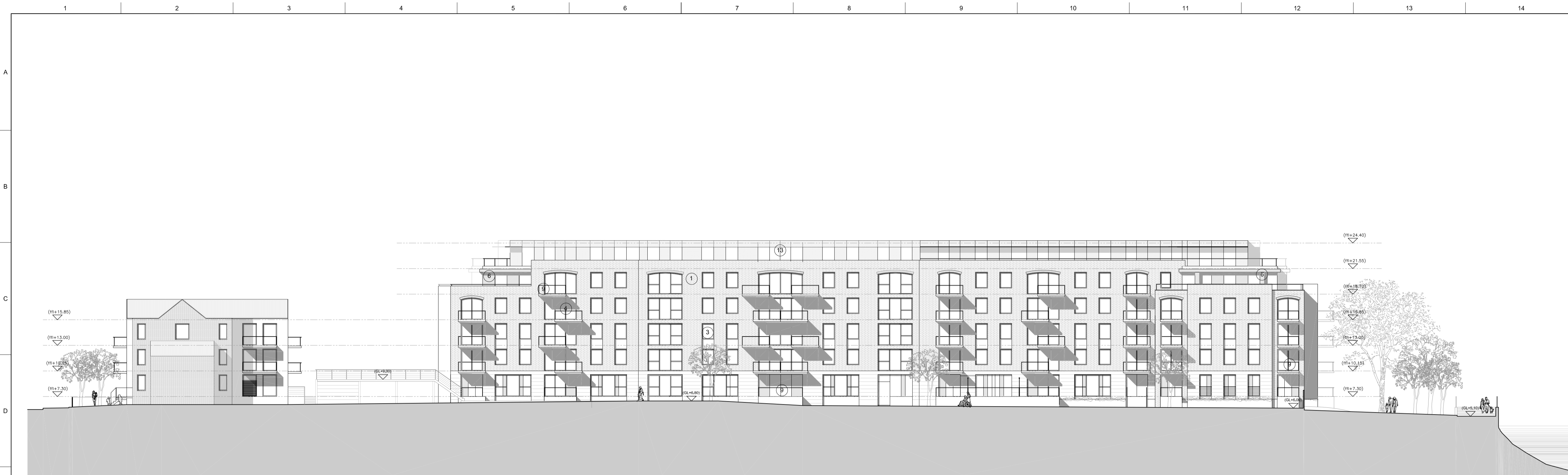
Proposed Elevation 7-7'