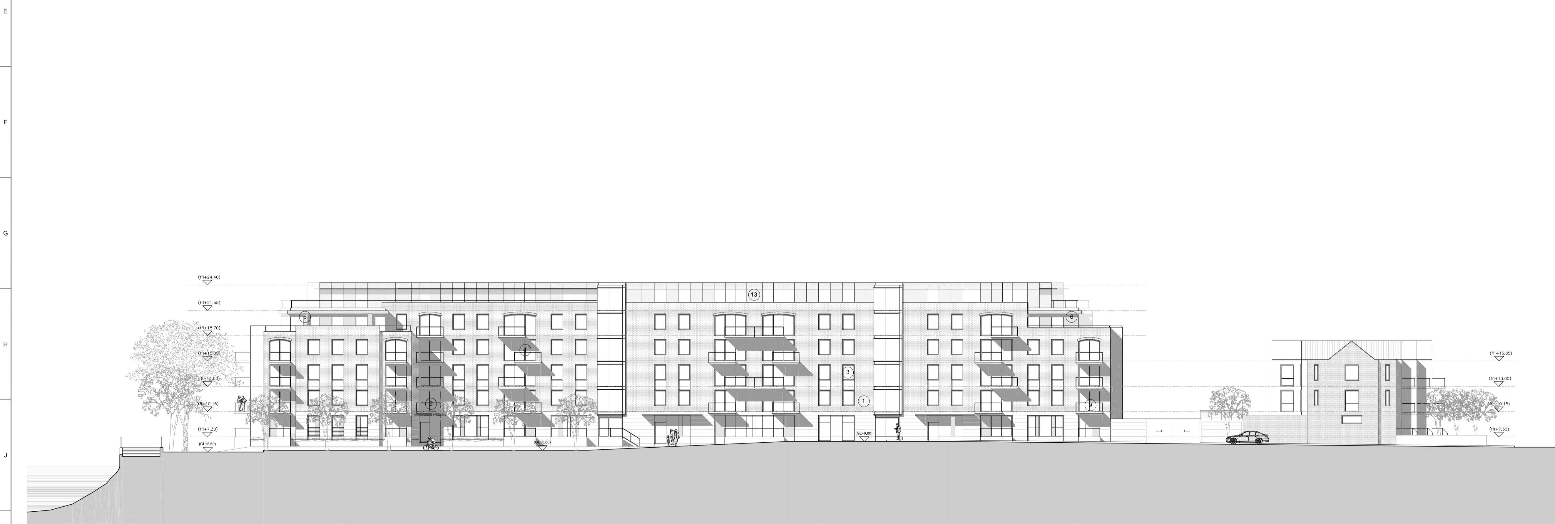
Proposed Elevation 8-8'

CLIENT STRUCTURAL ENGINEER SERVICES ENGINEER CONSULTANT