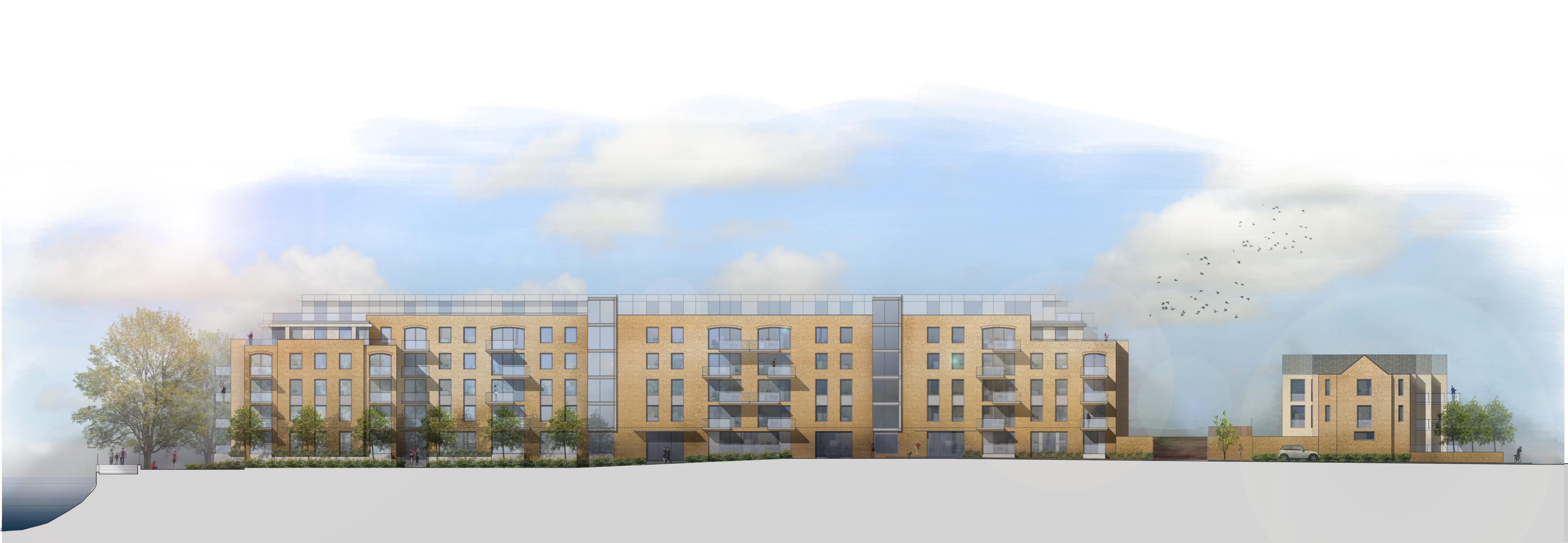
Proposed Elevation 8-8'

CLIENT STRUCTURAL ENGINEER SERVICES ENGINEER CONSULTANT