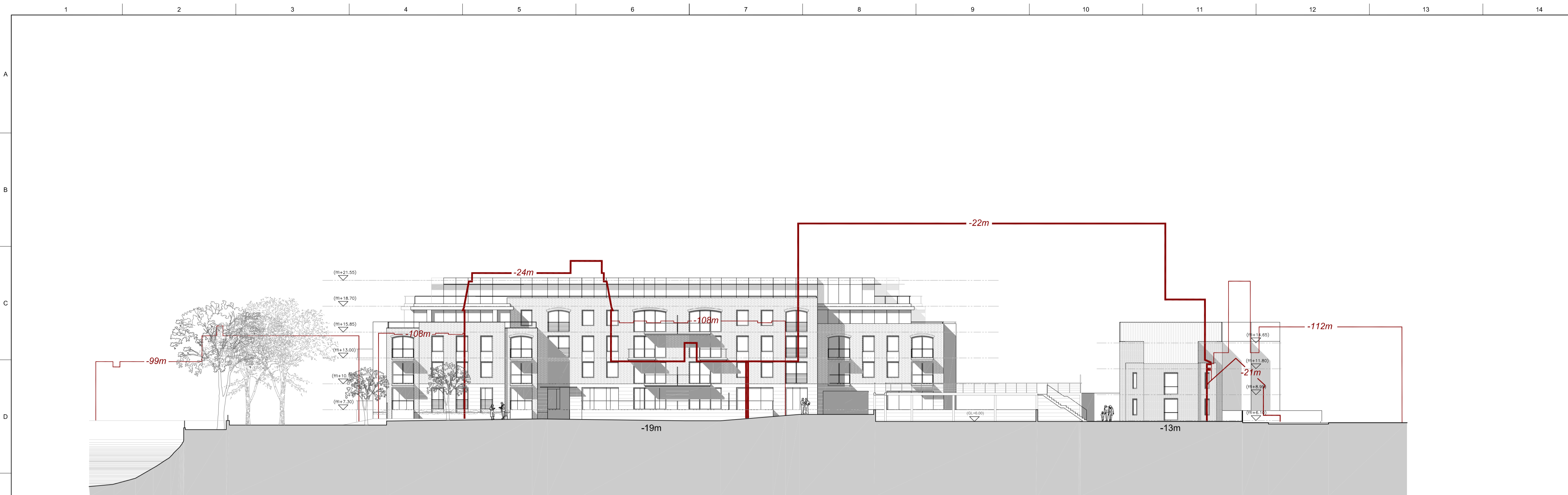
Elevation 3-3' (figured dimensions are the distance an existing or proposed plane is away from its relevant boundary)