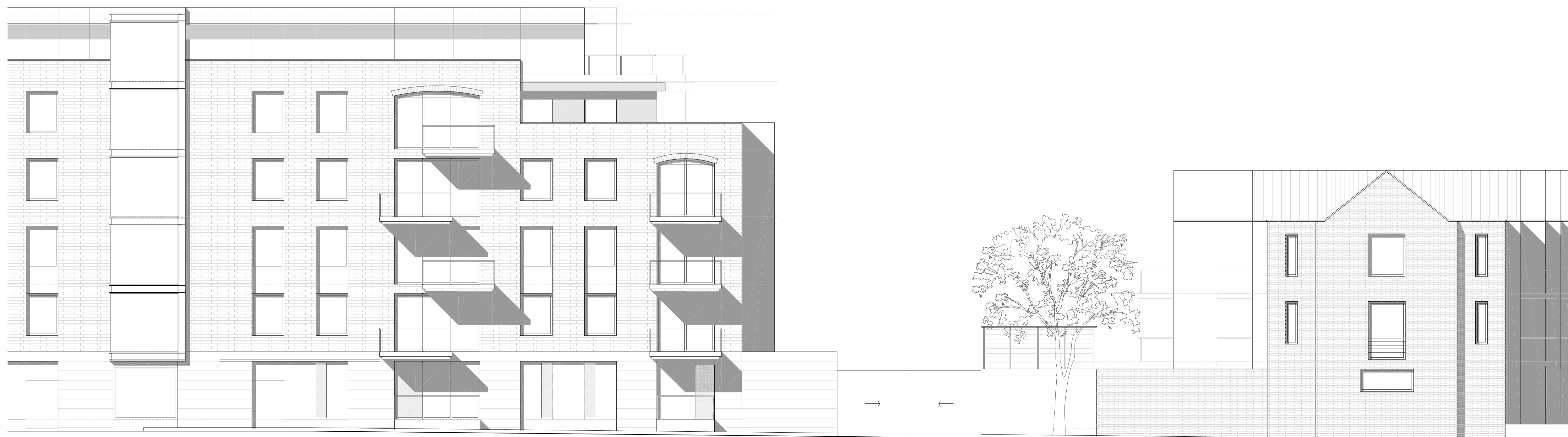
Proposed Elevation 8-8' _detail 1:100

CLIENT STRUCTURAL ENGINEER SERVICES ENGINEER CONSULTANT