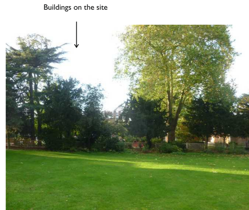
Viewpoint H: From the Lensbury Club gardens there are glimpsed views of the buildings on the behind the boundary vegetation.