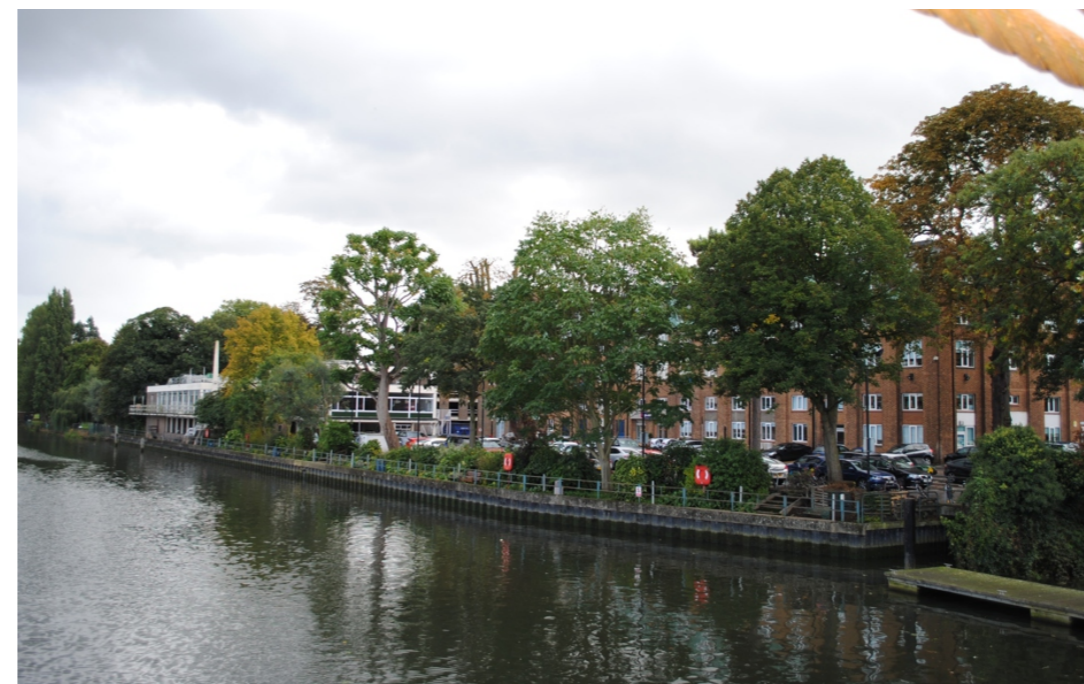
Viewpoint D: The length of the site's river frontage is visible from the Middlesex section of the footbridge