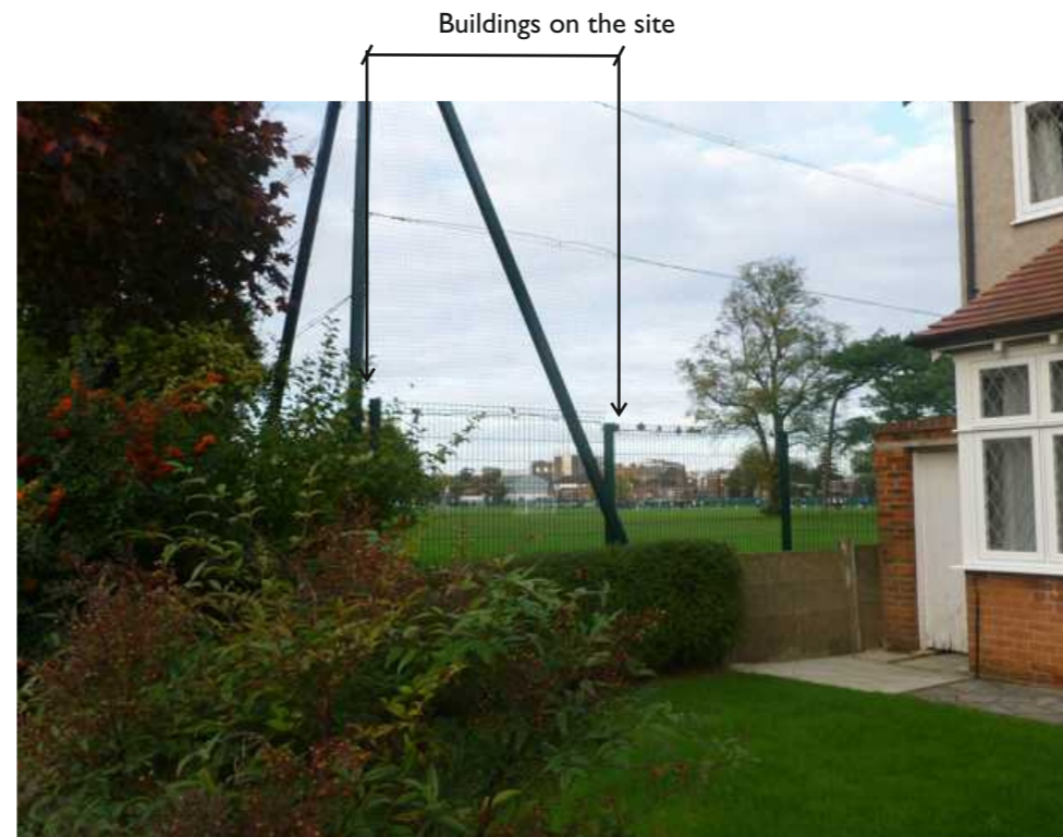
Viewpoint L: The studios are discernable within the broader view beyond the playing fields.