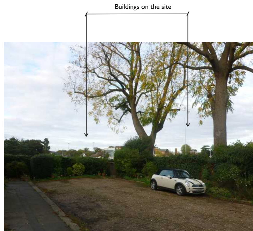
Viewpoint J: The existing buildings on site can be identified beyond the playing fields