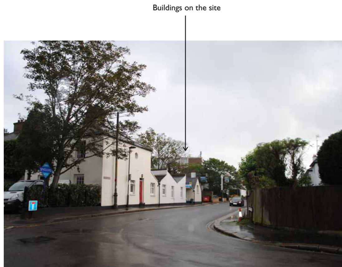
Viewpoint M: The taller buildings on the site are partially discernable beyond The Anglers public house.