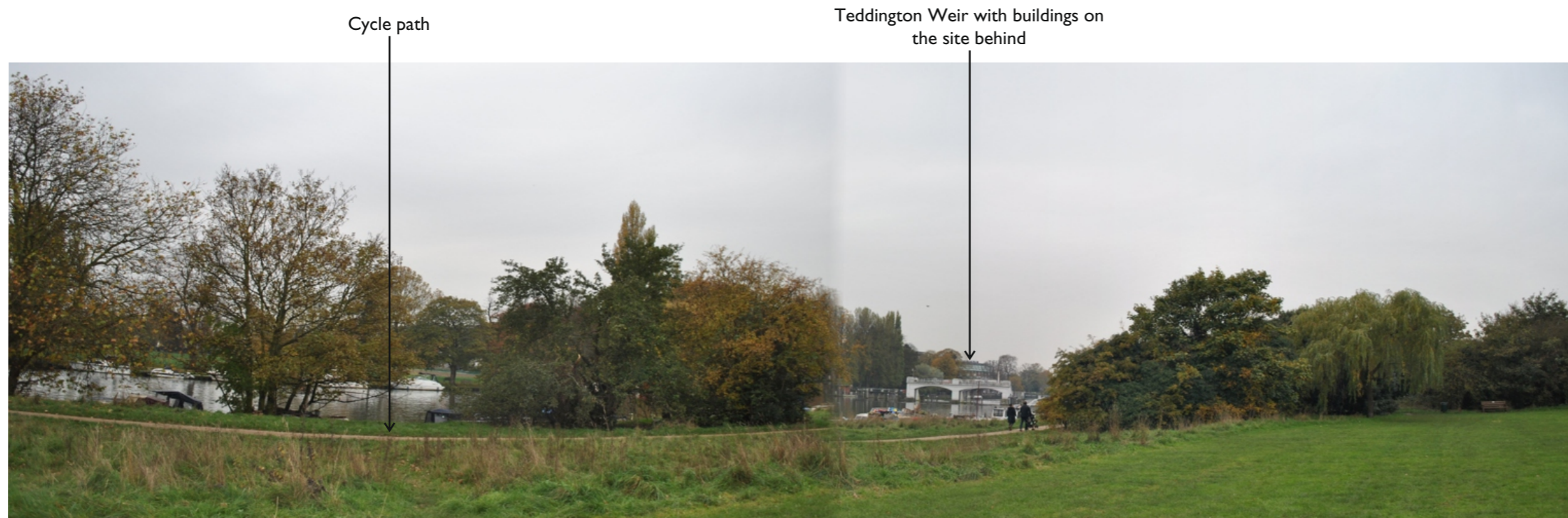
Viewpoint P: Buildings on the site are visible beyond the weir between gaps in the vegetation from the open space adjacent to Burnell Avenue and from the Thames Path.