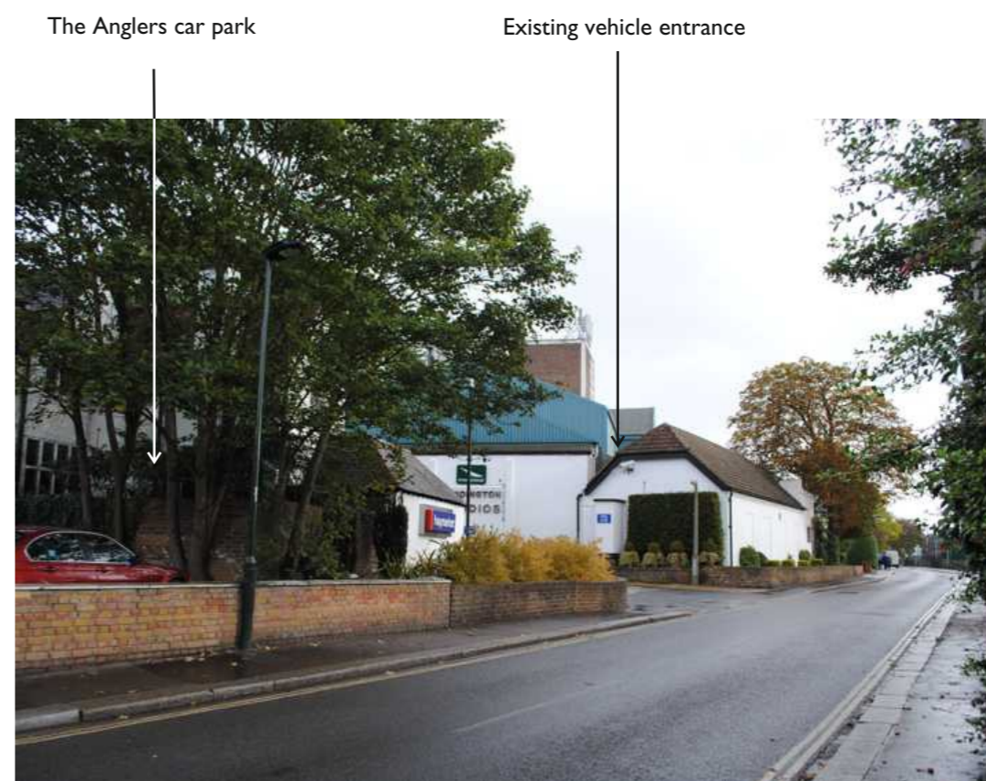
Viewpoint N: There are views towards the site looking southeast from properties on Broom Road.