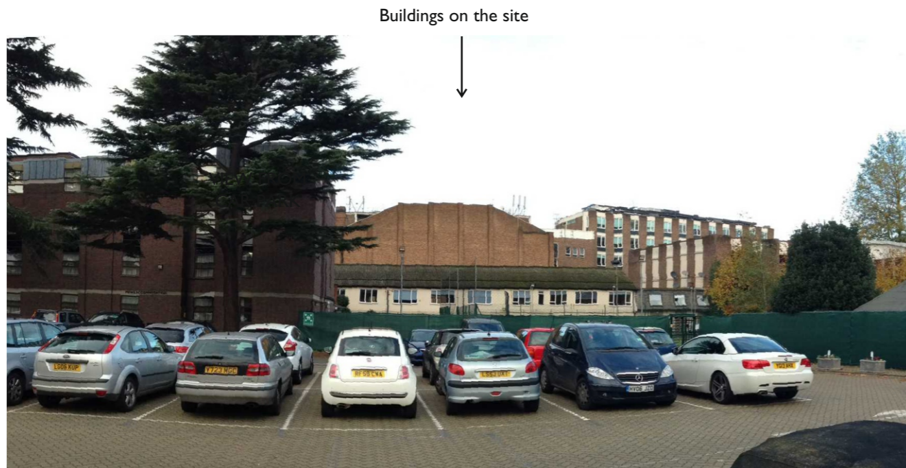
Viewpoint G: From the Lensbury Club car park there are views of the buildings on site beyond the boundary fencing.