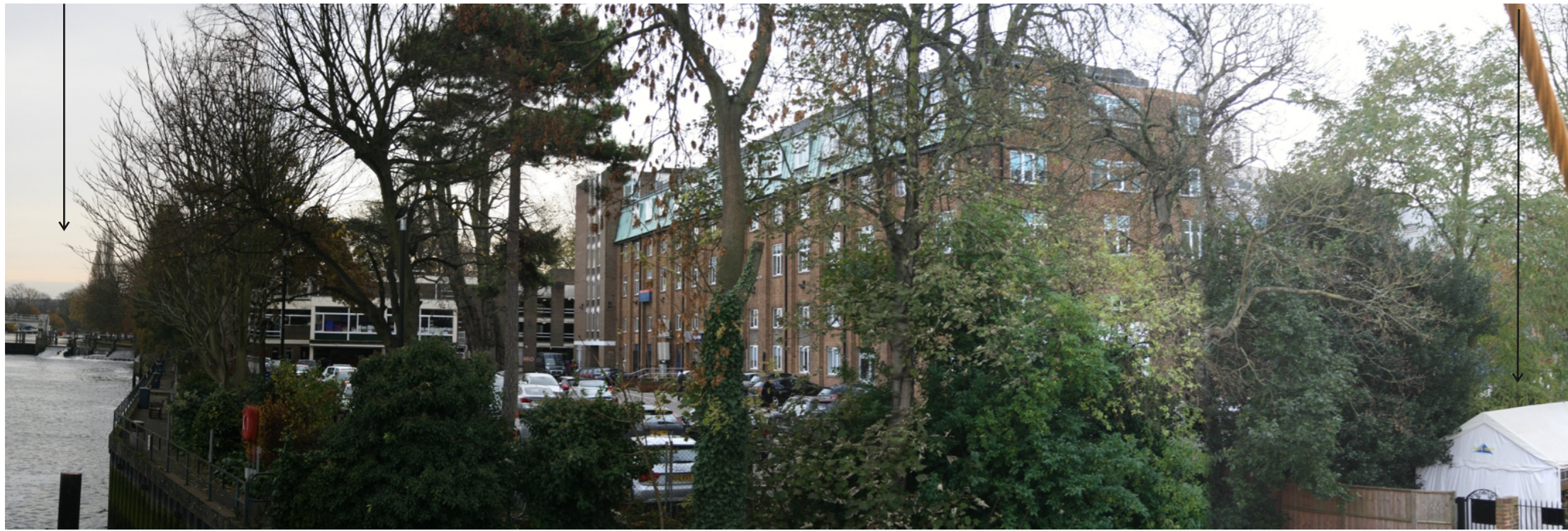
Viewpoint E: From the western end of the footbridge there are views through the boundary vegetation into the car park on site and the existing buildings beyond.