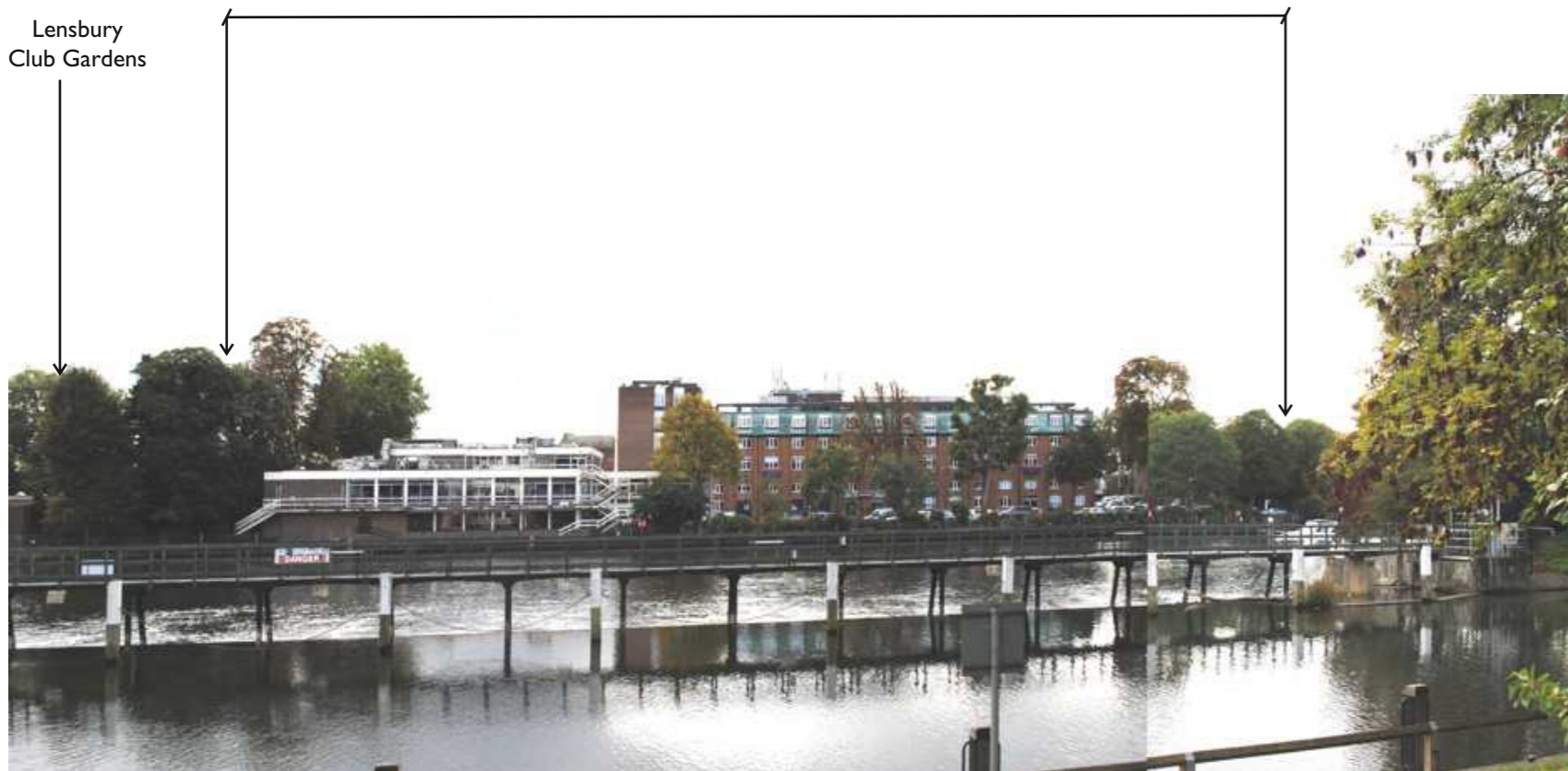
Viewpoint F: From the Thames Path and the river, there are views into the site across the Weir