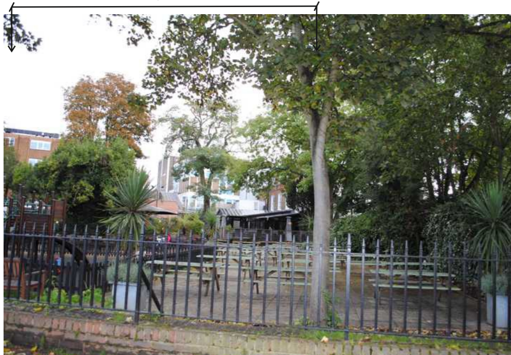
Viewpoint C: Buildings on the site are discernible through the vegetation and trees on The Anglers boundary