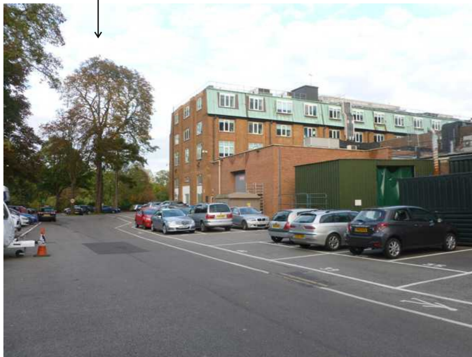
Viewpoint A: Looking north east from Weir Cottage across the existing car park to the buildings on site and the river beyond.