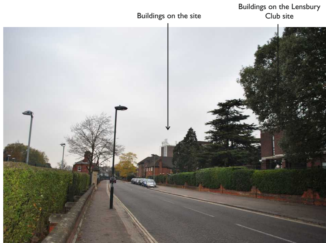
Viewpoint O: Looking north up Broom Road, the taller buildings on the site are visible beyond the trees and buildings to the northern end of the Lensbury Club site.