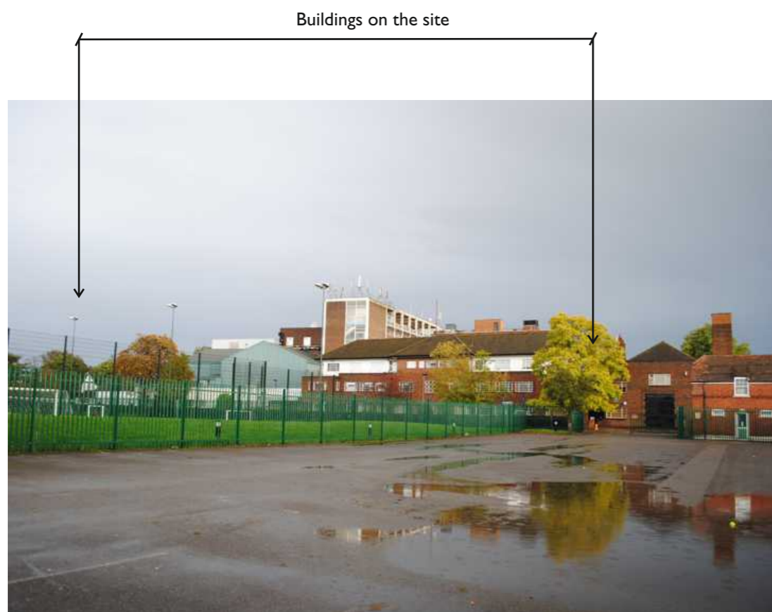
Viewpoint I: The existing buildings on site are clearly visible from St Marys Teddington Lock campus on the opposite side of Broom Road