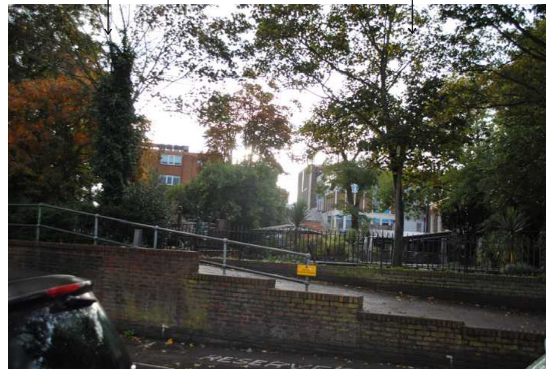
Viewpoint B: Buildings on the site are discernible through the vegetation and trees on The Anglers boundary