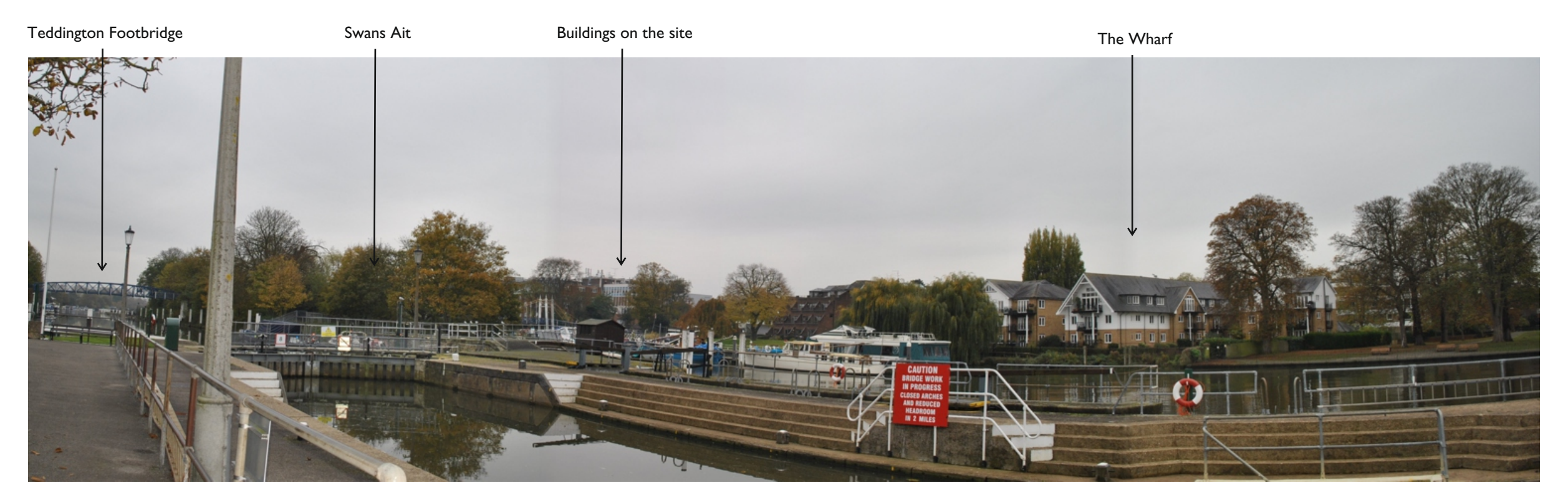
Viewpoint S: From Teddington Lock, the buildings on site are occasionally visible beyond the tree cover.