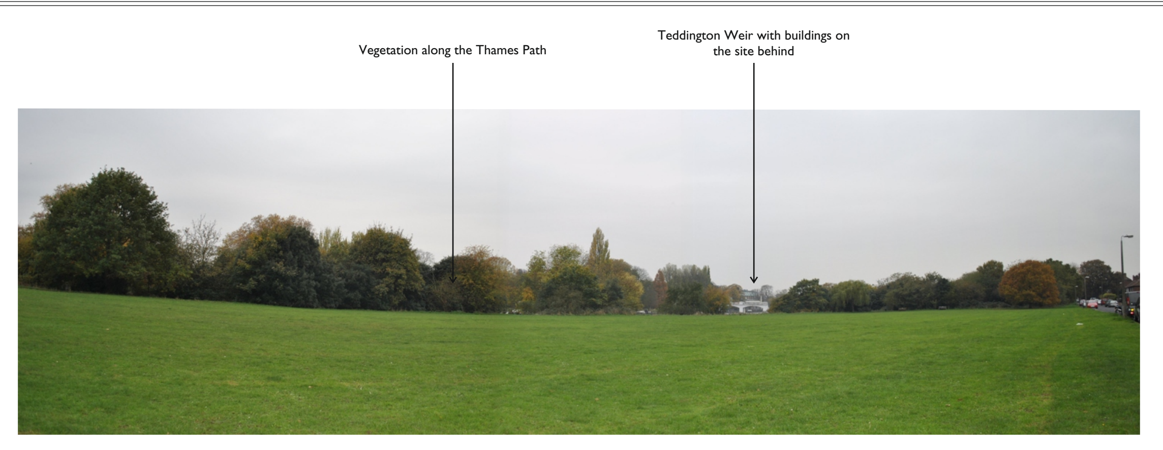
Viewpoint Q : From properties at the southern end of Burnell Avenue, the buildings on the site are visible beyond the weir between gaps in the vegetation.