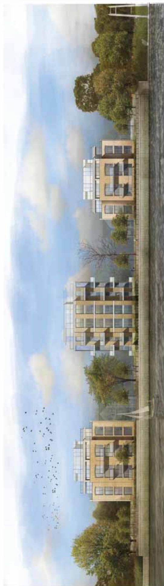
Proposed Elevation 2-2'

PROJECT NUMBER: _____ SERVICE ENGINEER: _____ LICENSE NUMBER: _____ DATE: _____