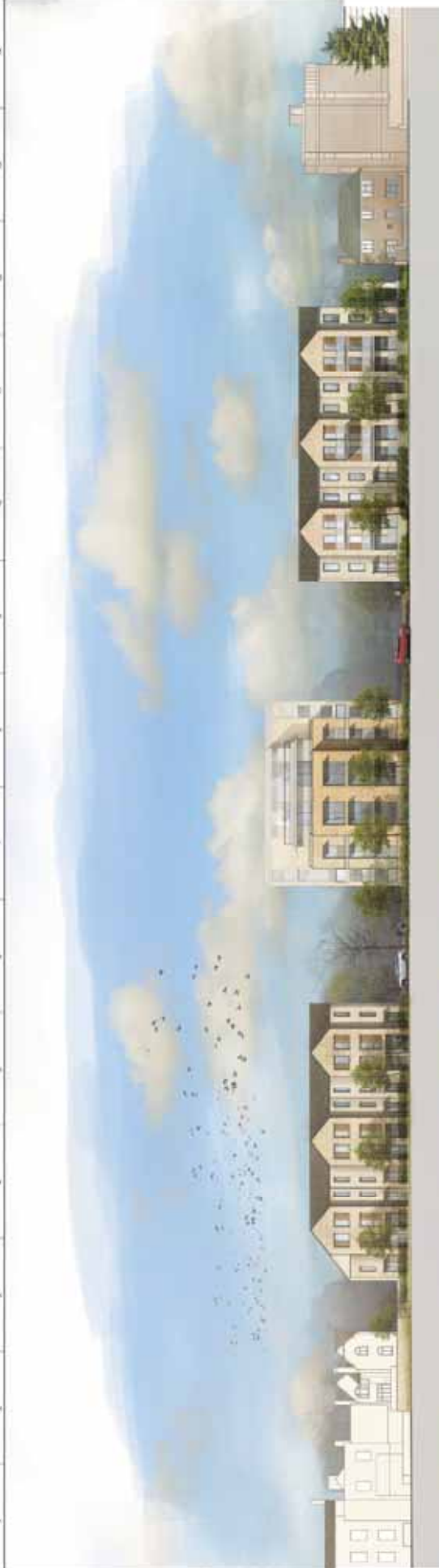
Proposed Elevation 1-1'