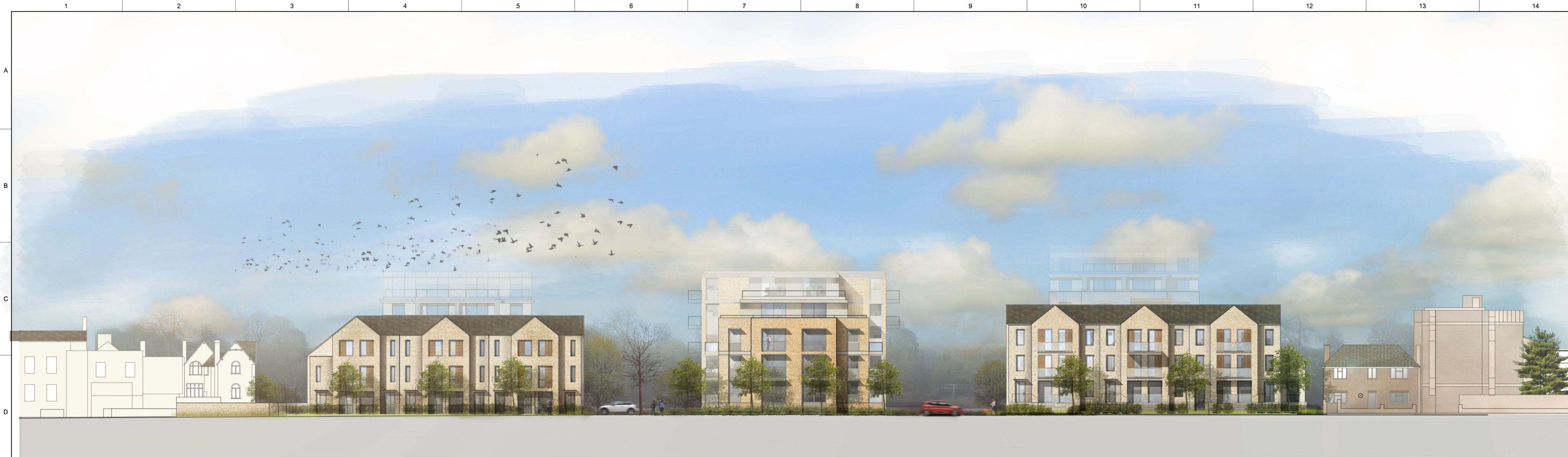
Proposed Elevation 1-1'