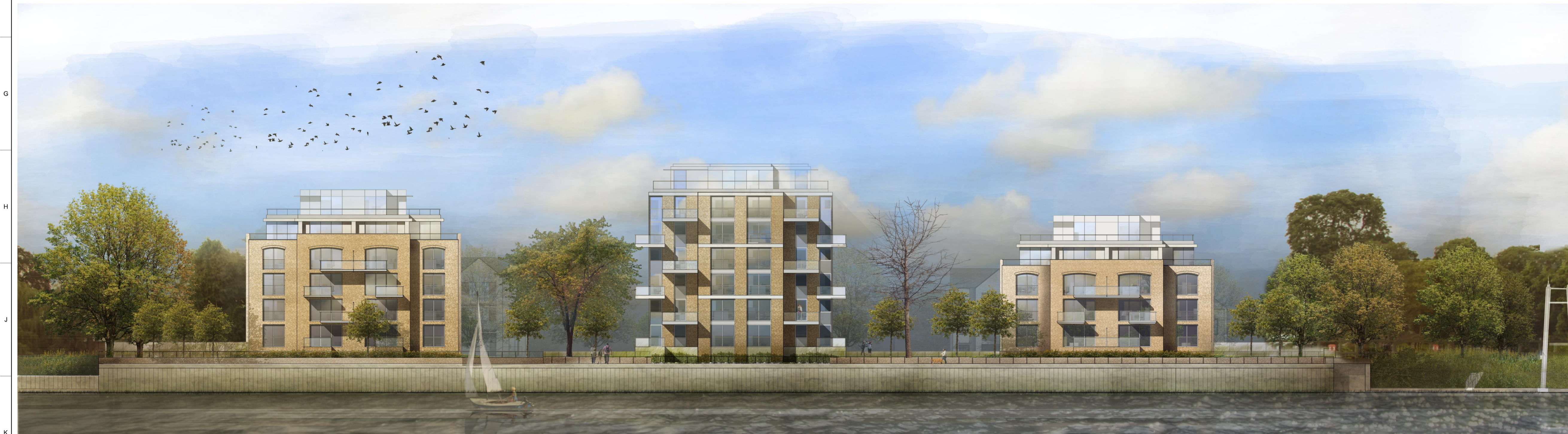
Proposed Elevation 2-2'

CLIENT STRUCTURAL ENGINEER SERVICES ENGINEER CONSULTANT