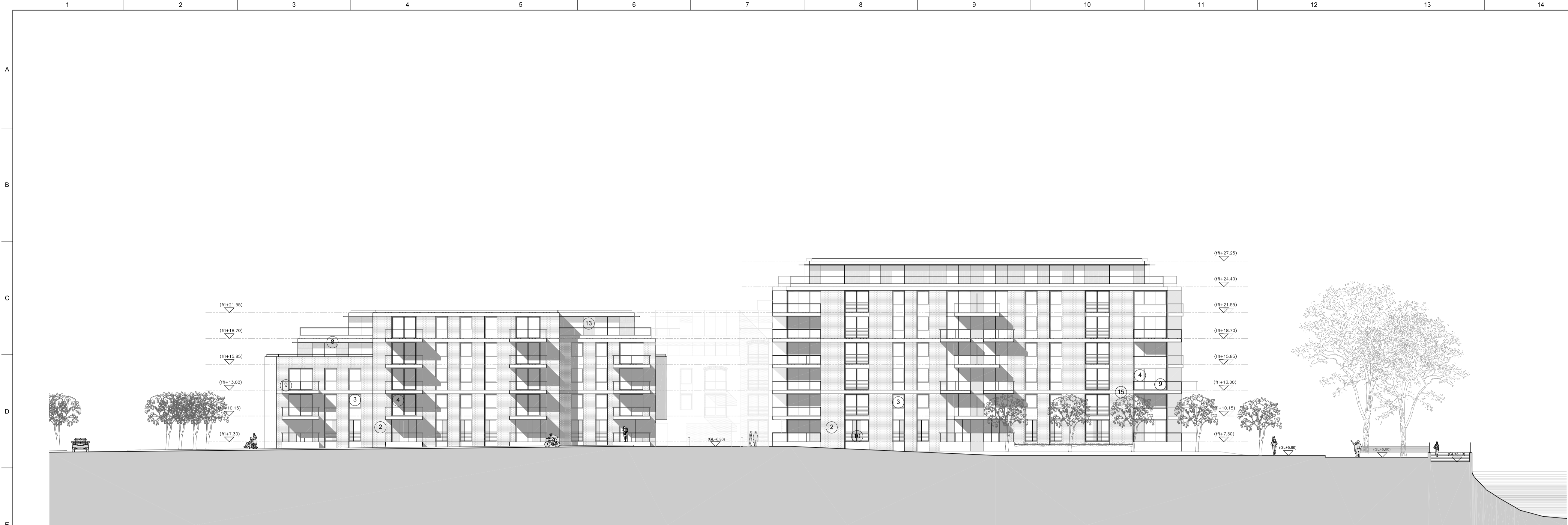
Proposed Elevation 5-5'